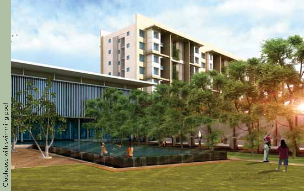
Clubhouse with swimming pool