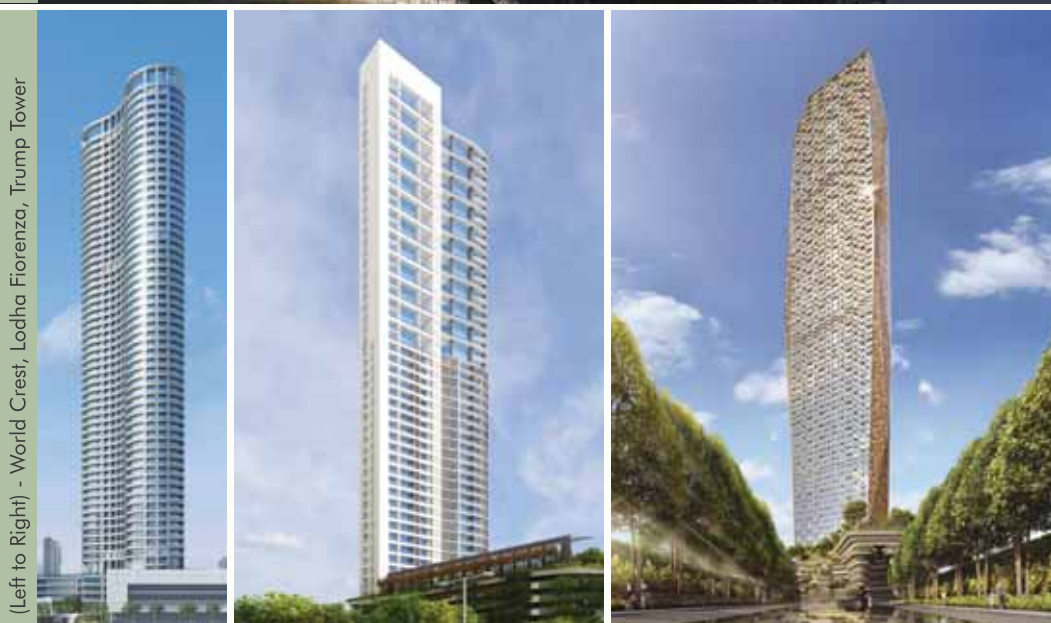
(Left to Right) - World Crest, Lodha Florenza, Trump Tower