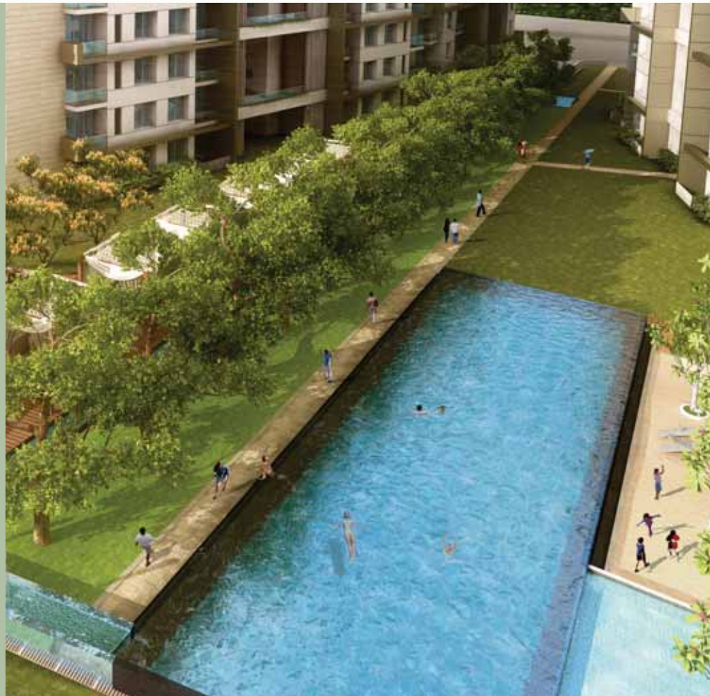
Swimming pool with children's splash pool