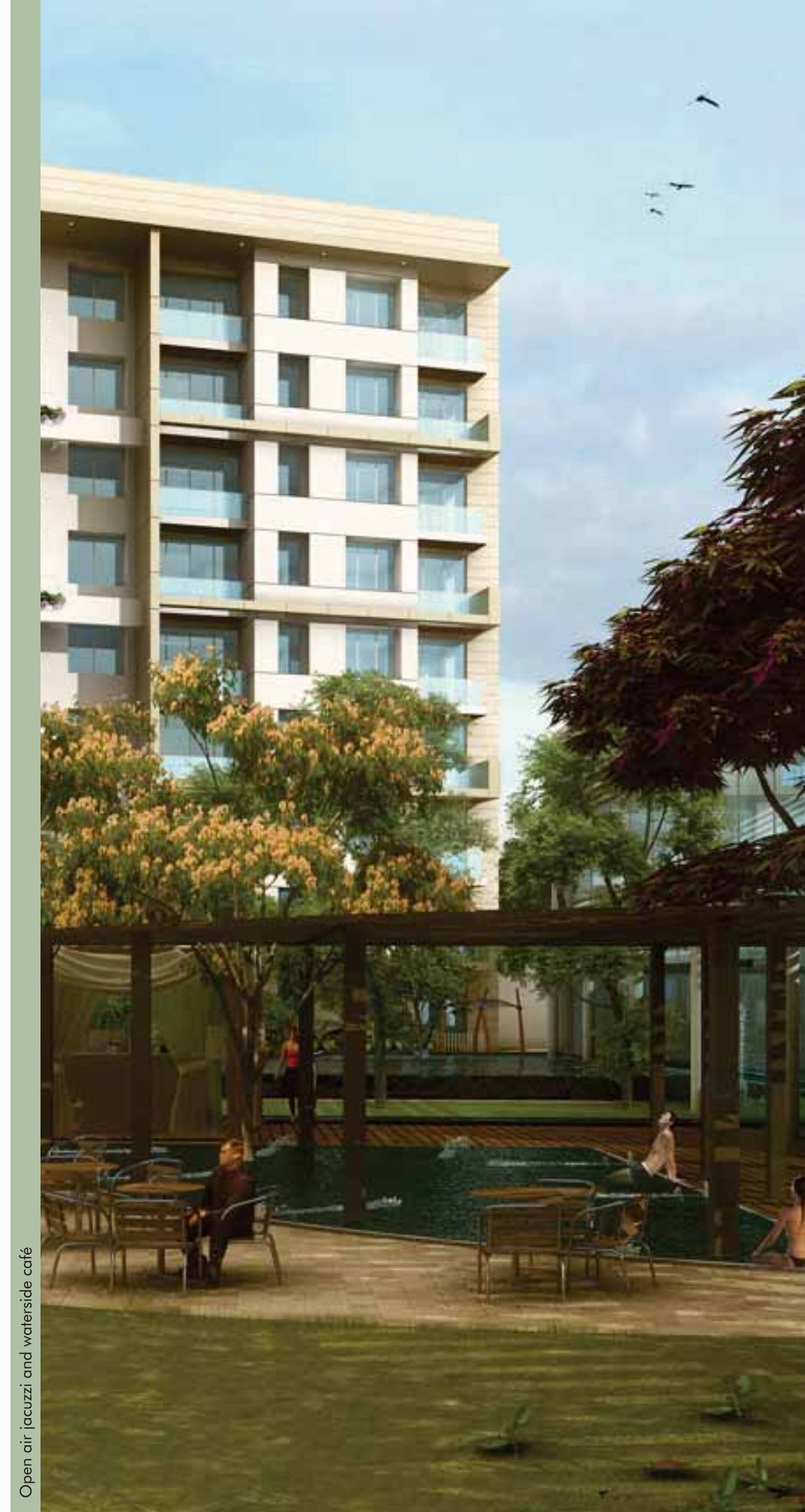
Open air jacuzzi and waterside café