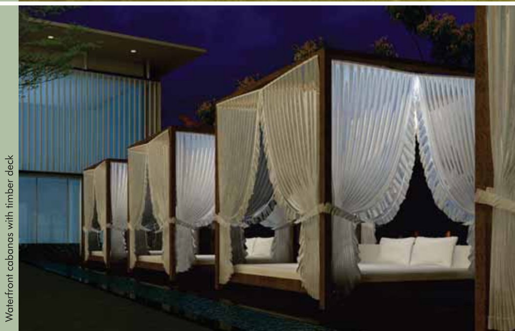
Waterfront cabanas with timber deck