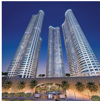
The World Towers One of India's most iconic addresses.