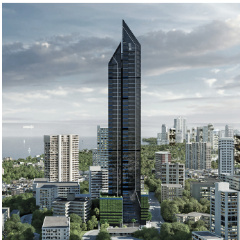
Lodha Altamount India's finest residences on Mumbai's Billionaires' Row.

Today, Lodha is India's largest real estate developer. ^ In the last 7 years, the company has delivered 8.5 crore sq. ft. of area and has achieved sales of over ₹55,000 crore. ** We have 40 ongoing projects and 24 upcoming project. ^^ Our team of 3,000 associates works relentlessly to create developments of exceptional quality, and is committed to delivering the world's finest homes, offices, and retail spaces.