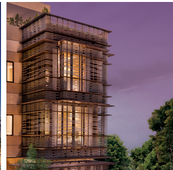
Lodha Maison Limited edition luxury townhouses in the heart of the city.