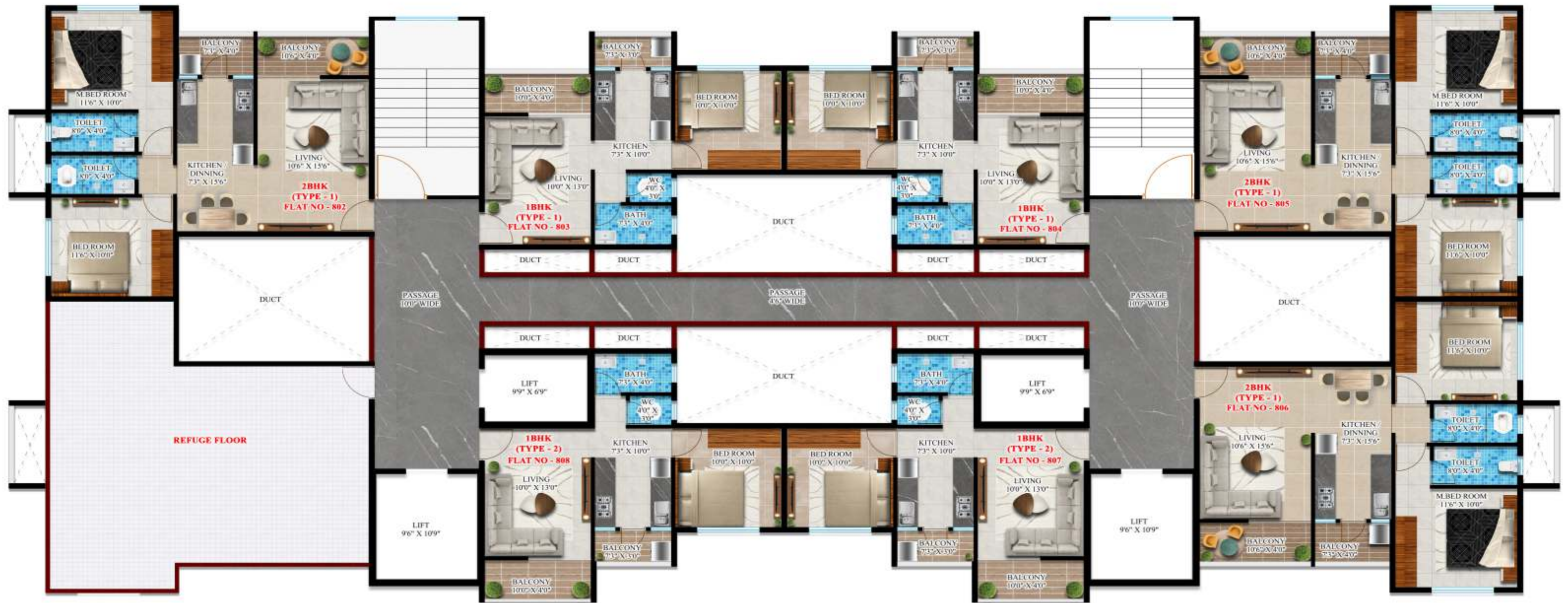
A-WING REFUGE FLOOR PLAN