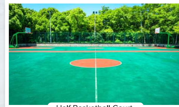
Half Basketball Court