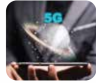
5G ENABLED CONNECTION INTERNET