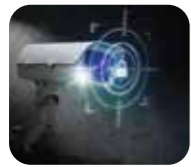
3 TIER SECURITY