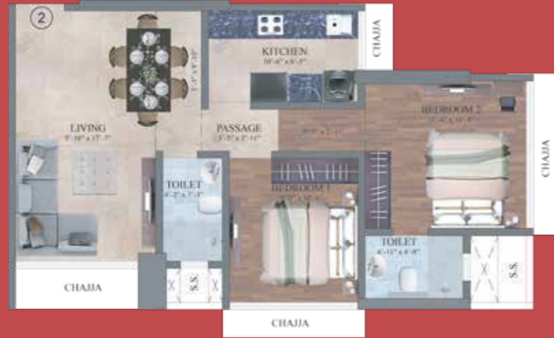
Layout for 611 SF RERA CARPET