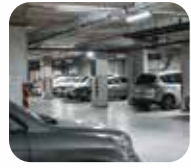
AMPLE CAR PARKING