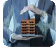
EARTHQUAKE RESISTANCE R.C.C. STRUCTURE