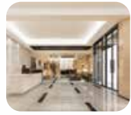
GRAND ENTRANCE LOBBY