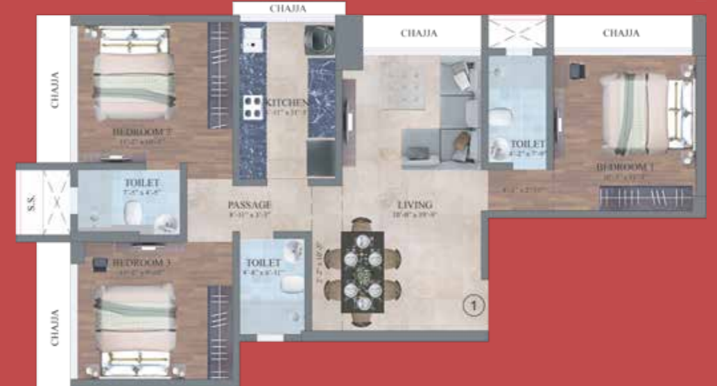
Layout for 832 SF RERA CARPET