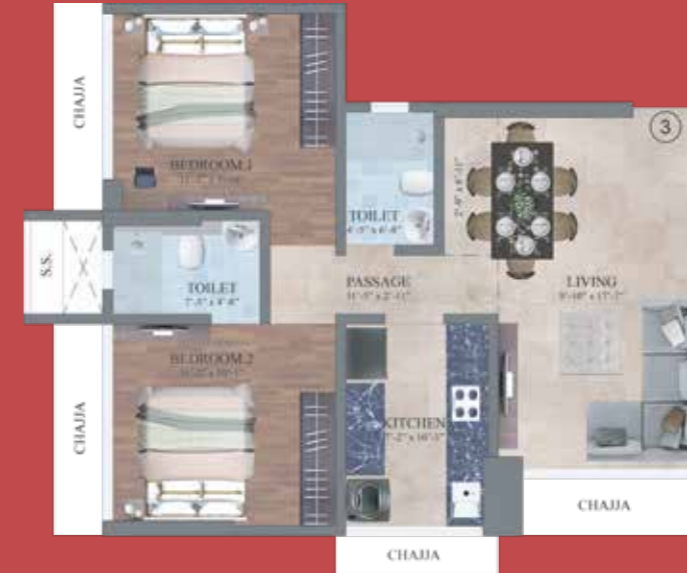
Layout for 632 SF RERA CARPET