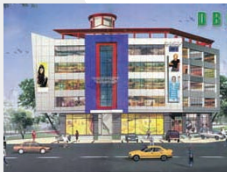
Commercial Complex Mayur Vihar, Delhi