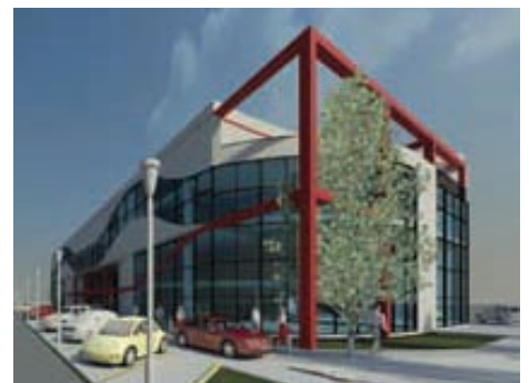
Commercial Complex Jaipur