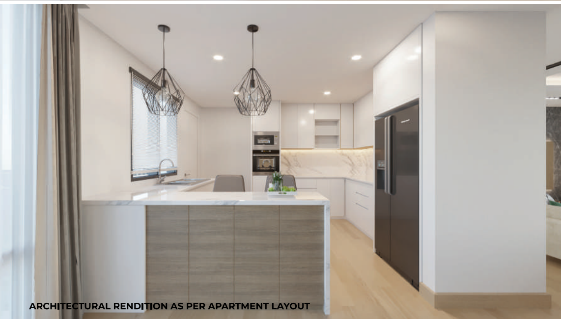
ARCHITECTURAL RENDITION AS PER APARTMENT LAYOUT