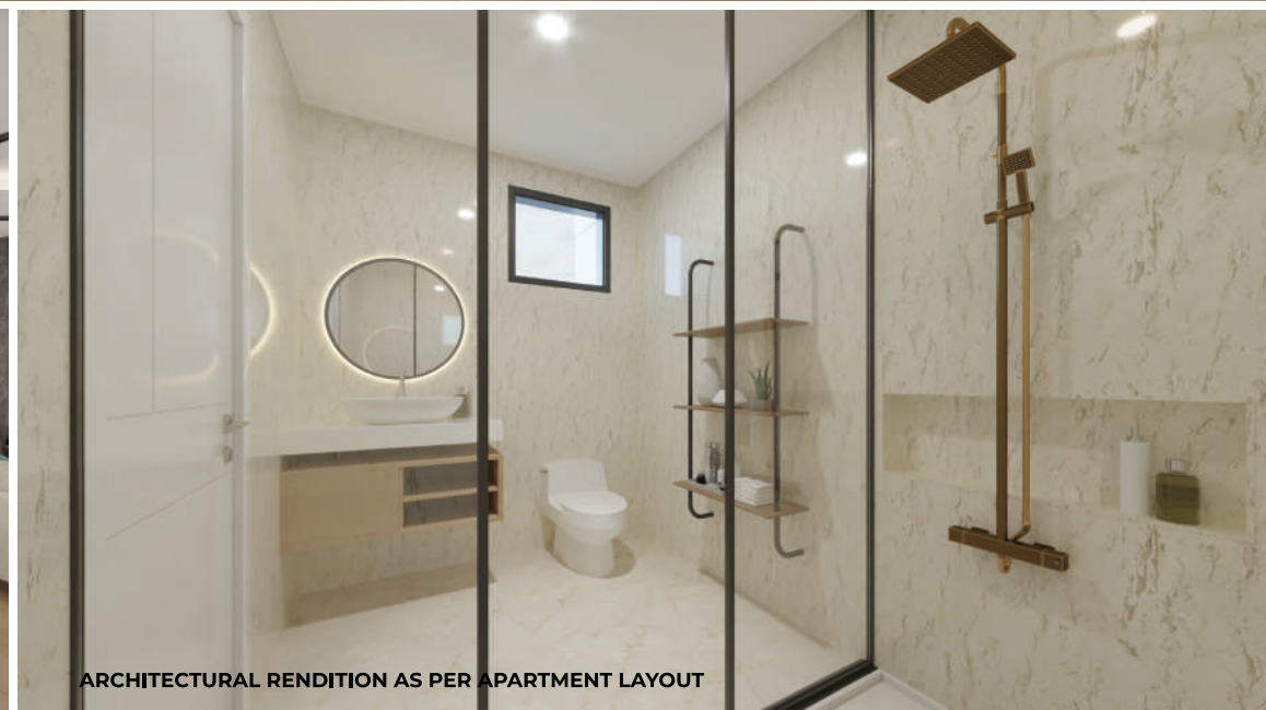
ARCHITECTURAL RENDITION AS PER APARTMENT LAYOUT

A refined space in itself, The Elite residences make a bold statement, highlighting your personal taste and style.