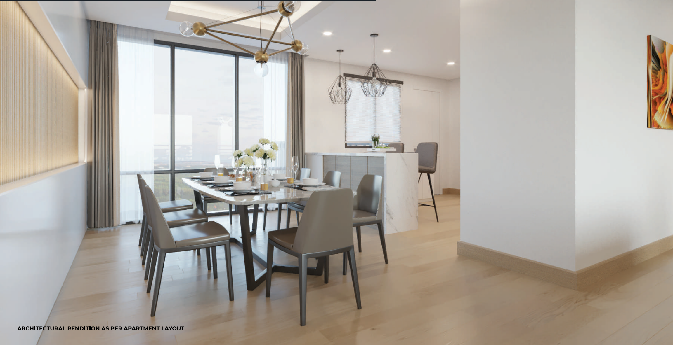
ARCHITECTURAL RENDITION AS PER APARTMENT LAYOUT