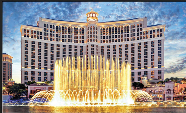
The Fountains of Bellagio