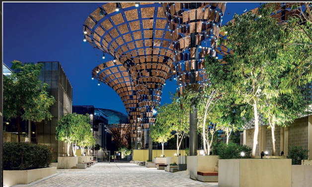
Dubai Expo 2020