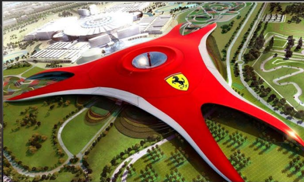
Ferrari World Abu Dhabi