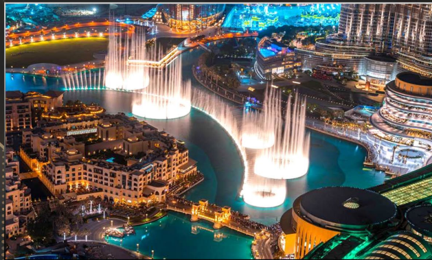
The Majestic Dubai Fountain

PIONEERS IN CURATING FUSION OF ICE, WATER & FIRE