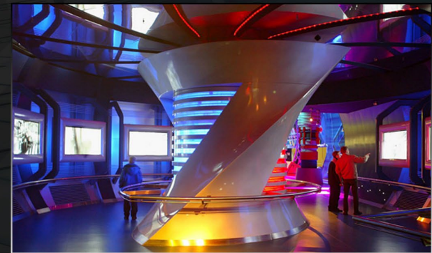
Space Park Germany, UK