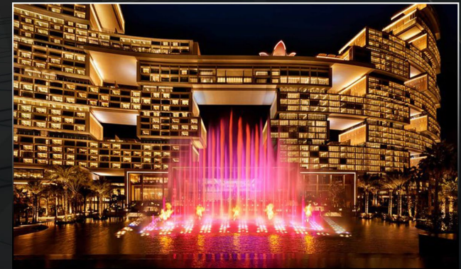
Atlantis The Royal Dubai