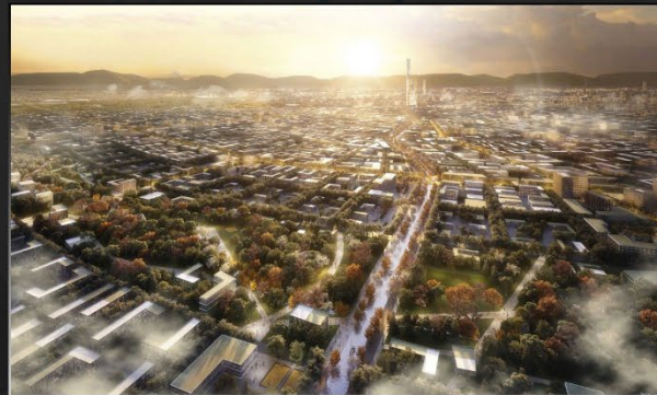
Premium Residential Tashkent