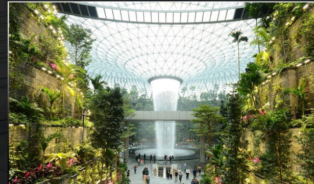
Changi Airport Singapore