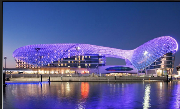
Mesmerising W Yas Island