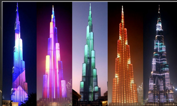
Burj Khalifa's Media Facade