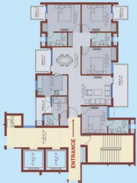
4 BHK Apartments 2321 sqft*

1 sq mts = 10.76 sq ft, 1 sq yards = 9 sq ft, 1 sq mts = 1,196 sq yards