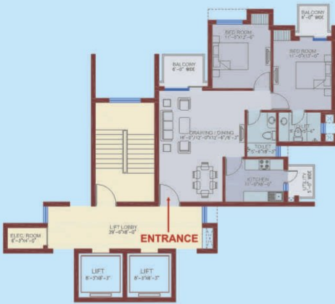
2 BHK Apartments 1348 sqft*