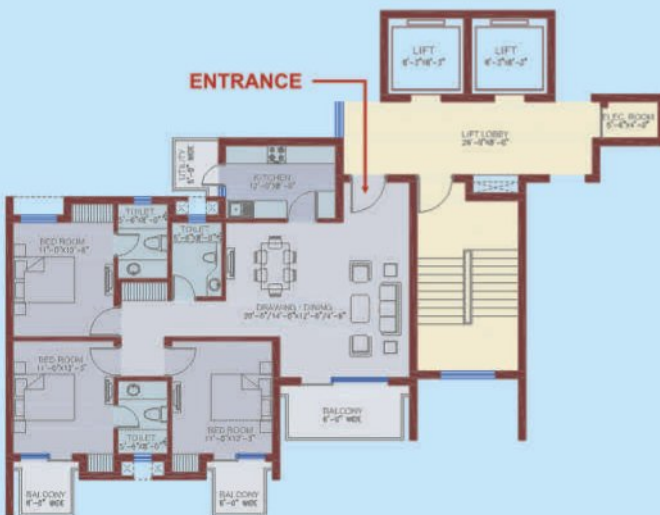
3 BHK Apartments 1877 sqft*