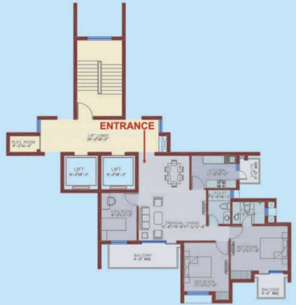
2 BHK with Kids Room 1618 sqft*