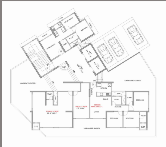
2ND FLOOR : PODIUM LEVEL