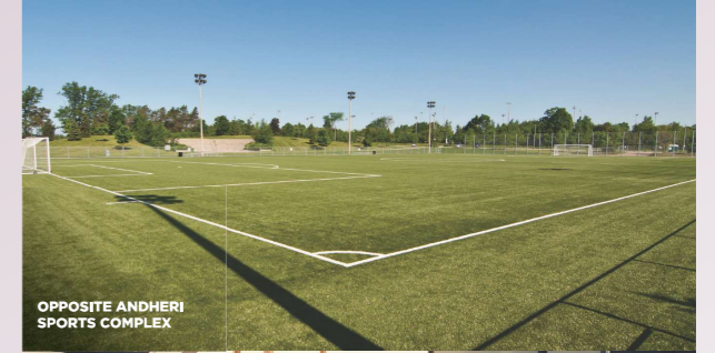
OPPOSITE ANDHERI SPORTS COMPLEX