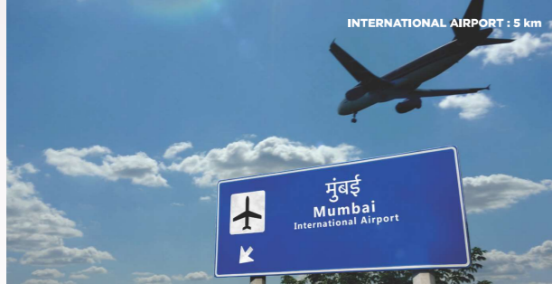
INTERNATIONAL AIRPORT : 5 km

Images are for illustrative purposes only.