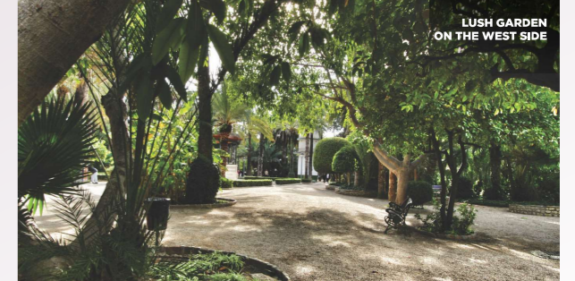
LUSH GARDEN ON THE WEST SIDE

Images are for illustrative purposes only.