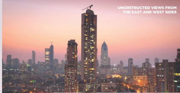
UNOBSTRUCTED VIEWS FROM THE EAST AND WEST SIDES