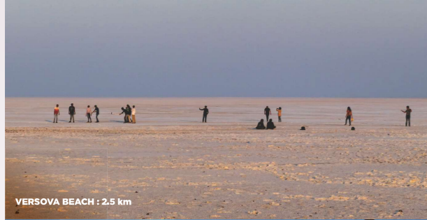
VERSOVA BEACH : 2.5 km