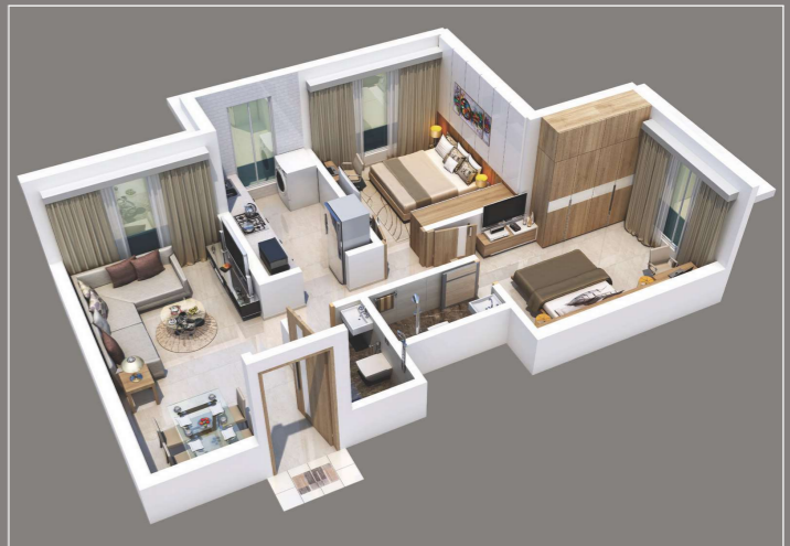
2 BHK : FLOORPLAN CUTVIEW