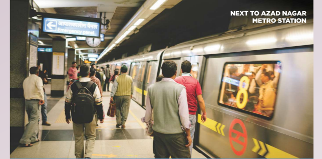
NEXT TO AZAD NAGAR METRO STATION