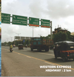
WESTERN EXPRESS HIGHWAY : 2 km