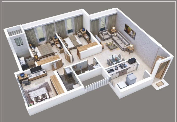
3 BHK : FLOORPLAN CUTVIEW