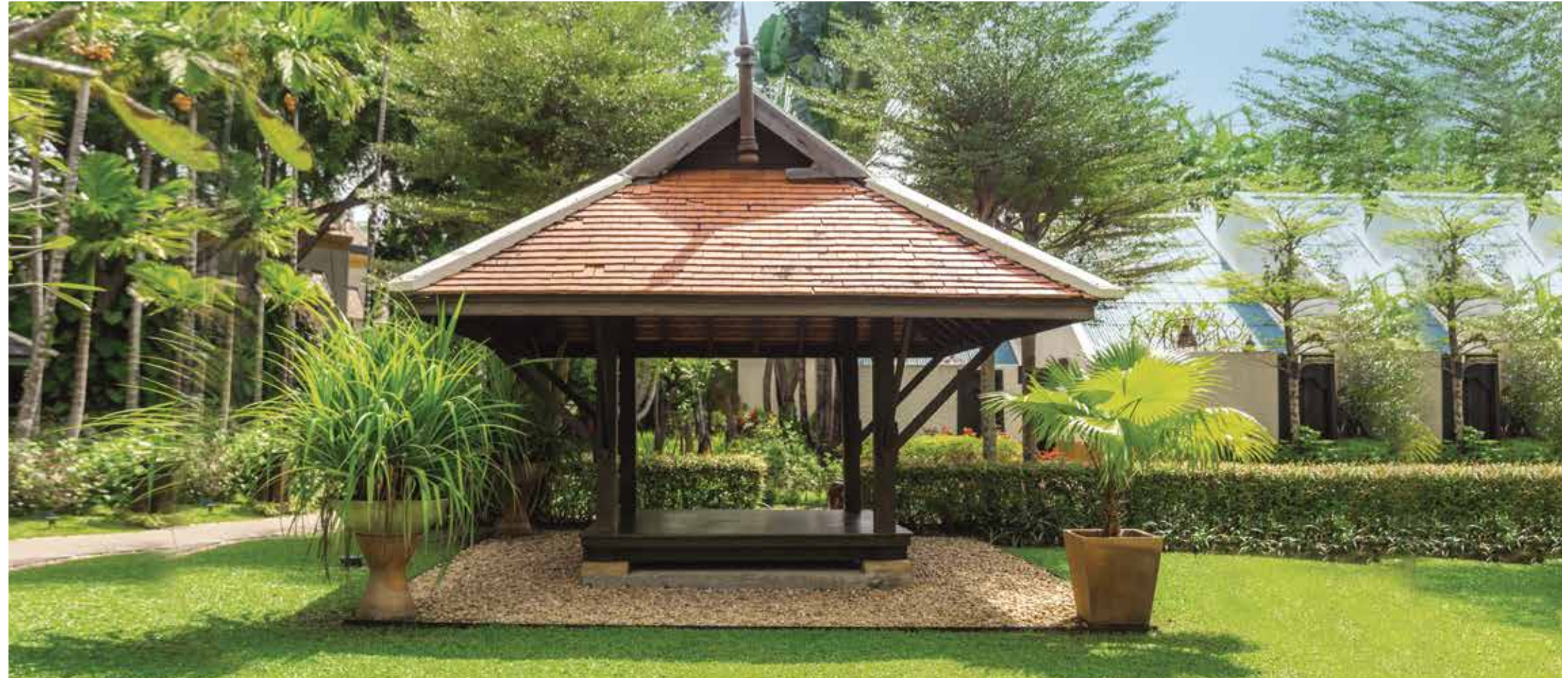
Designed For The Curious Minds