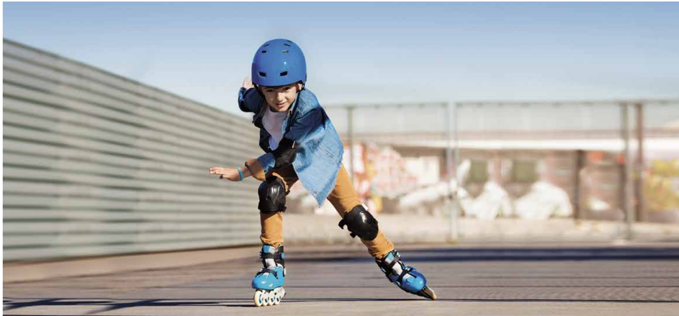
Play With Family