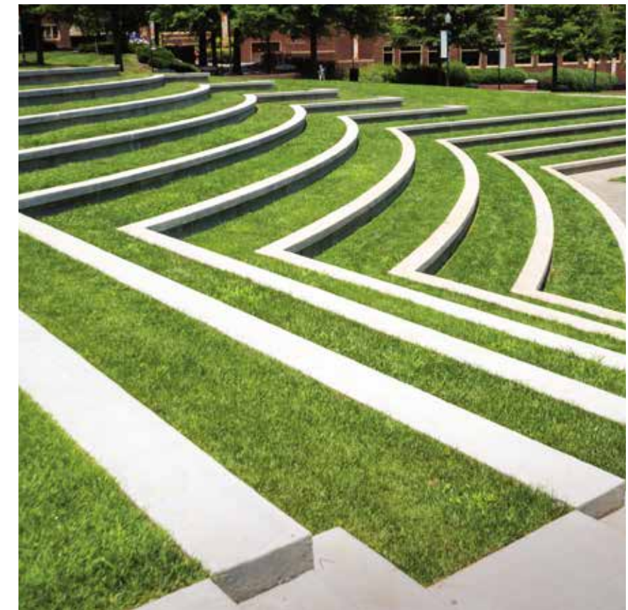
An Escape In Solitude & Books