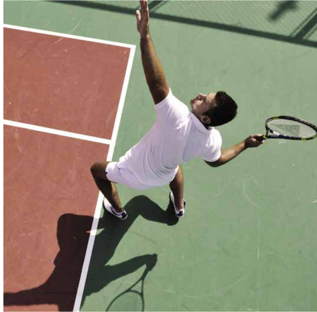
Ace Your Game