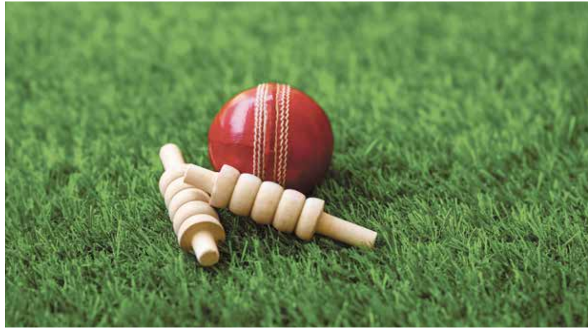
Different Strokes For Different Folks