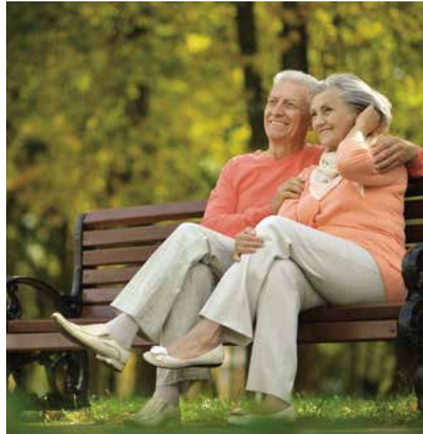
Hangout Of The Young At Heart