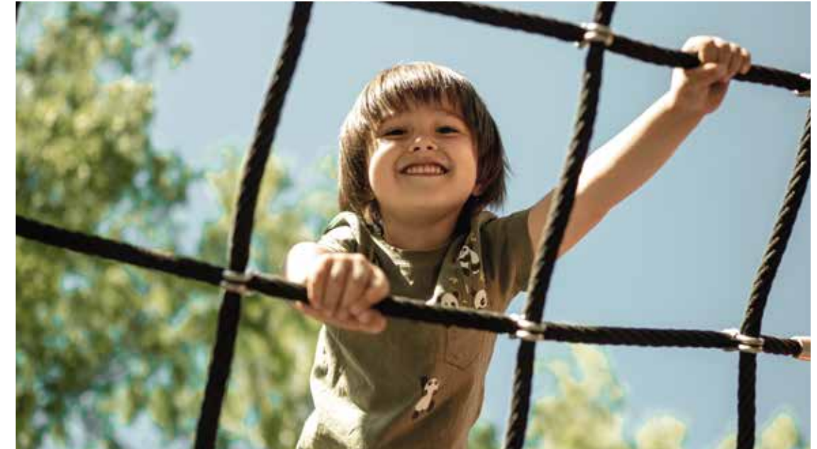
Little One's Funtom