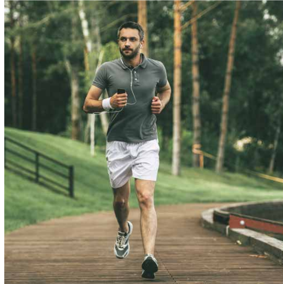
Fitness Comes First