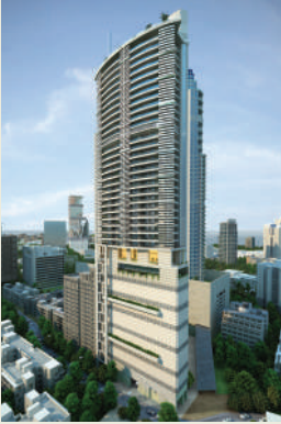
THE IMPERIAL EDGE