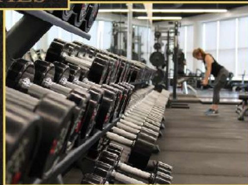
STATE-OF-ART GYM STAY FIT