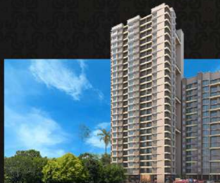
BALAJI SIDDHIVINAYAK COMPLEX DOMBIVILI (W)