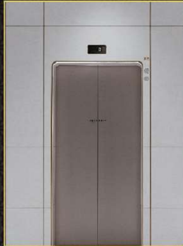
WORLD CLASS ELEVATORS