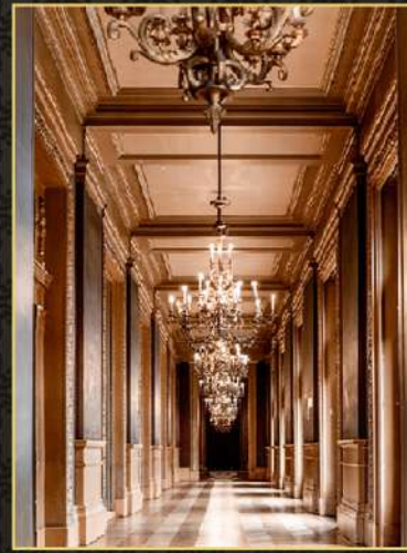
GRAND ELEGANT LOBBY