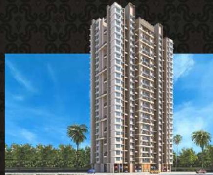
BALAJI ANNEX THAKURLI (E)