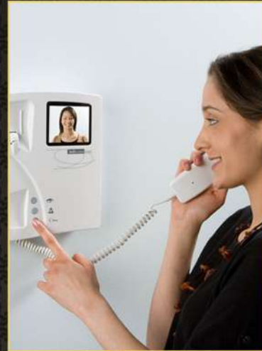
VIDEO DOOR PHONE