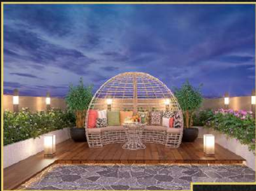
GAZEBO ARENA STAY HEALTHY, STAY FIT