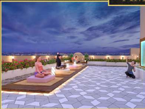
YOGA AREA STAY HEALTHY, STAY FIT