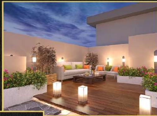
SEATING AREA JUST RELAX