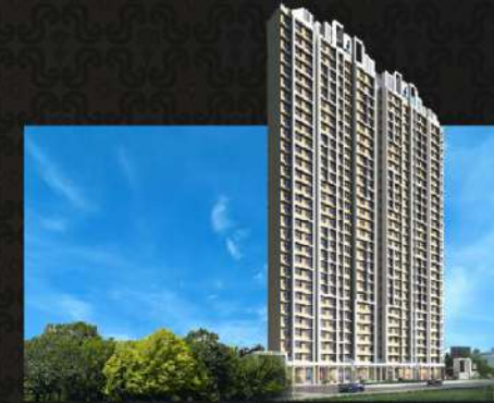
VENUS SKKY CITY DOMBIVILI (E)