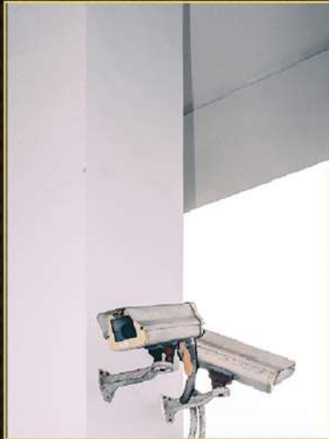
24X7 CCTV SURVEILLANCE