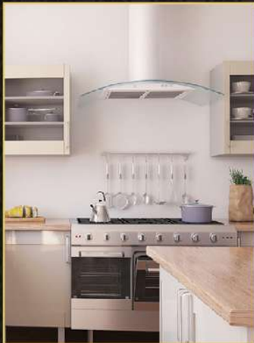
FULL WALL TILES IN KITCHEN