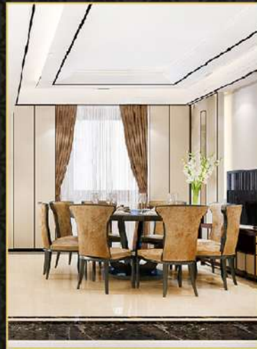
BEAUTIFUL FALSE CEILING