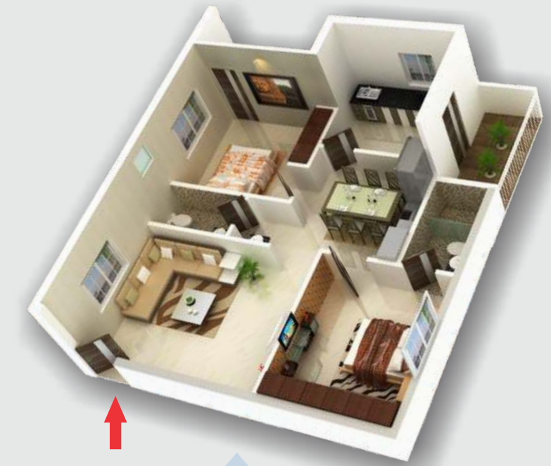
2 BHK West Face