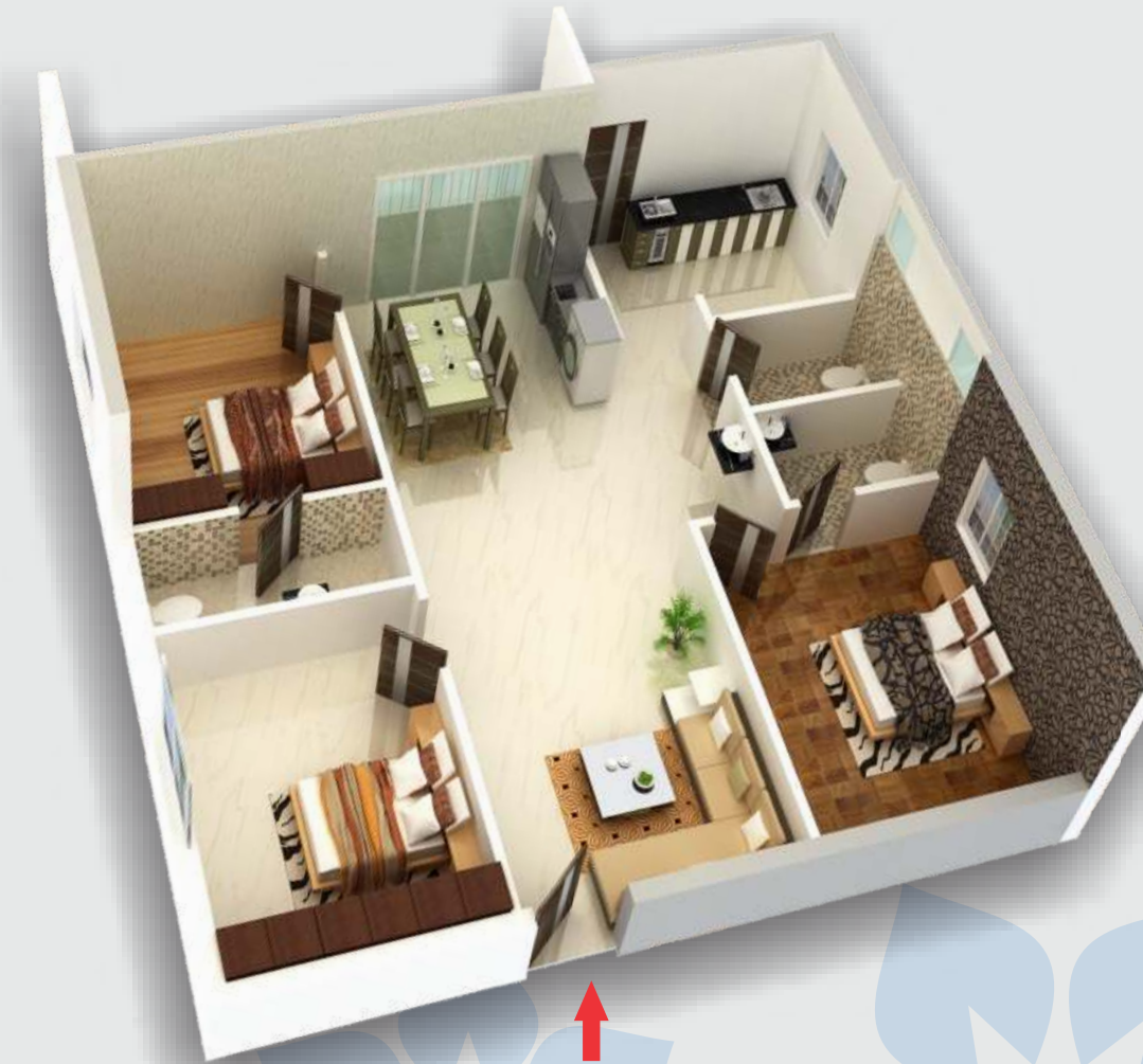
3 BHK West Face