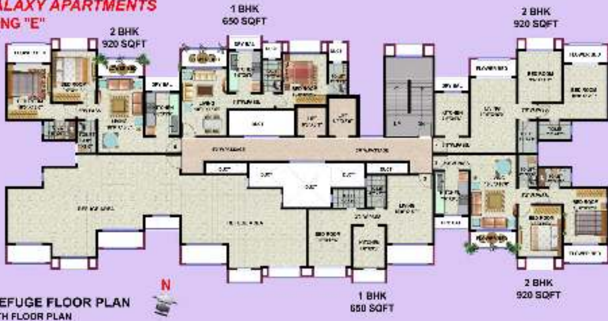
REFUGE FLOOR PLAN 8 TH FLOOR PLAN