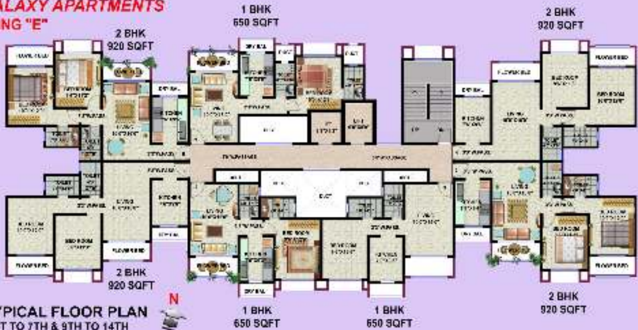
TYPICAL FLOOR PLAN 1ST TO 7TH & 9TH TO 14TH