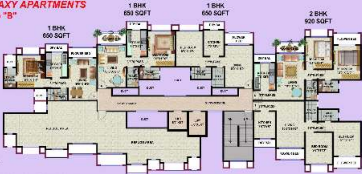
REFUGE FLOOR PLAN 8 TH FLOOR PLAN