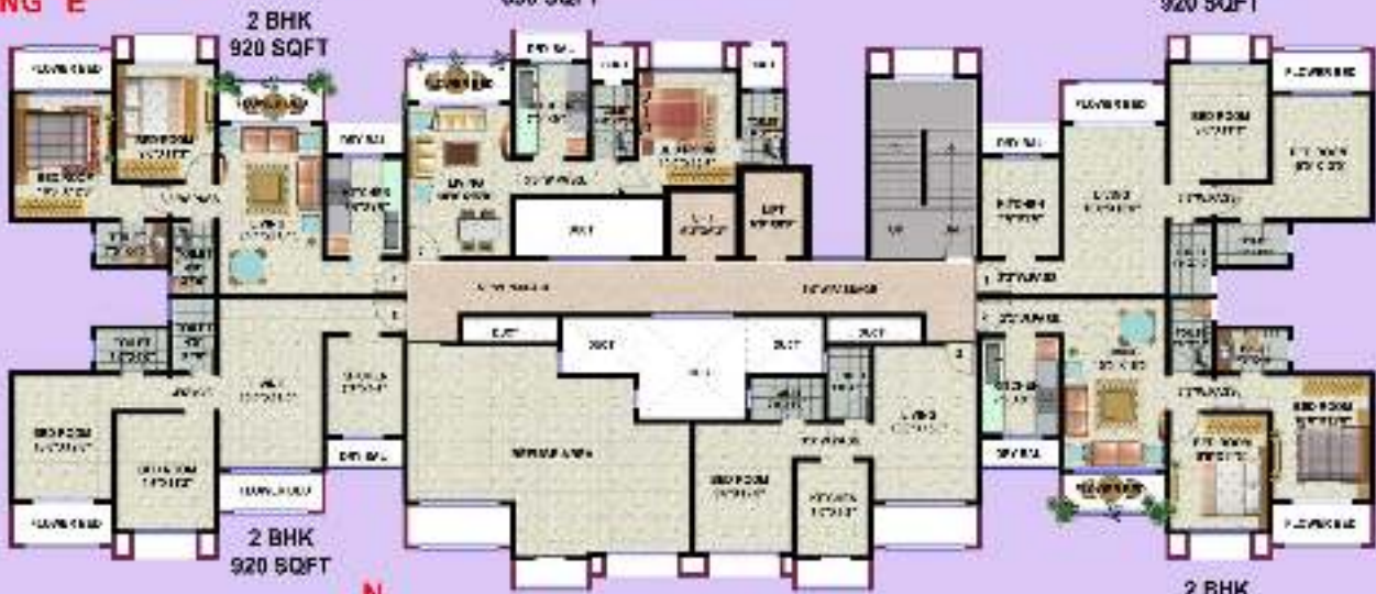
REFUGE FLOOR PLAN 15TH FLOOR PLAN