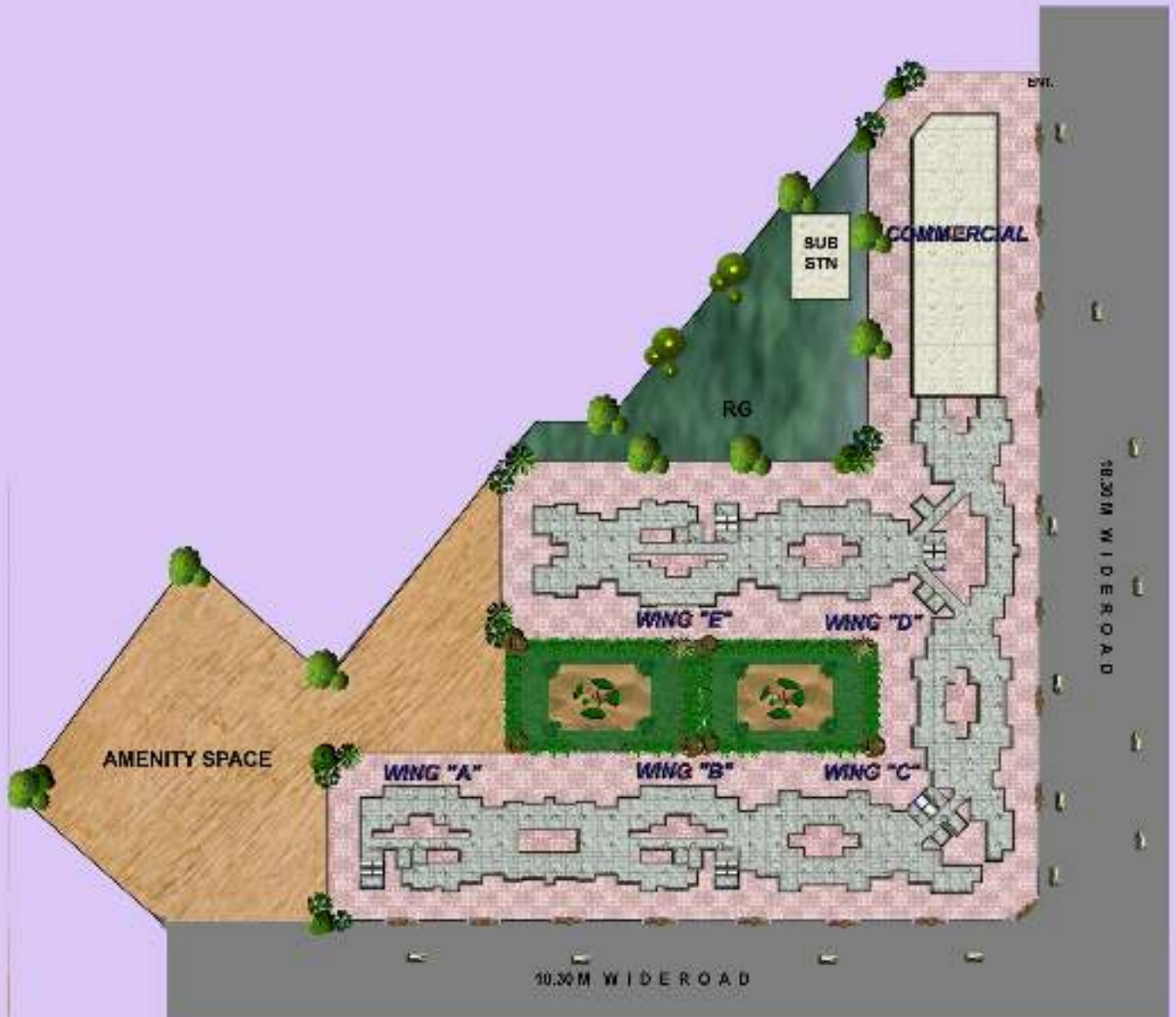
PROPOSED RESIDENTIAL COMPLEX AT KURLA (E) MUMBAI.