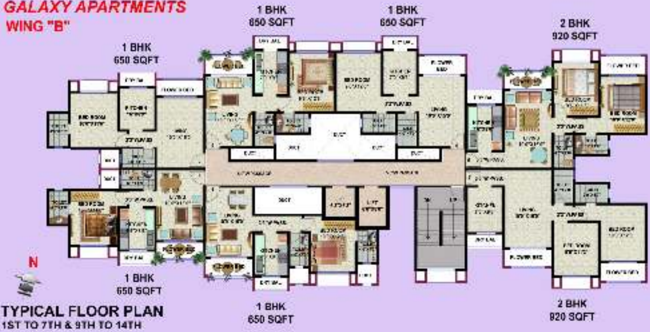
TYPICAL FLOOR PLAN 1ST TO 7TH & 9TH TO 14TH