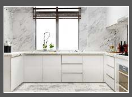
Modular Kitchen Trolley