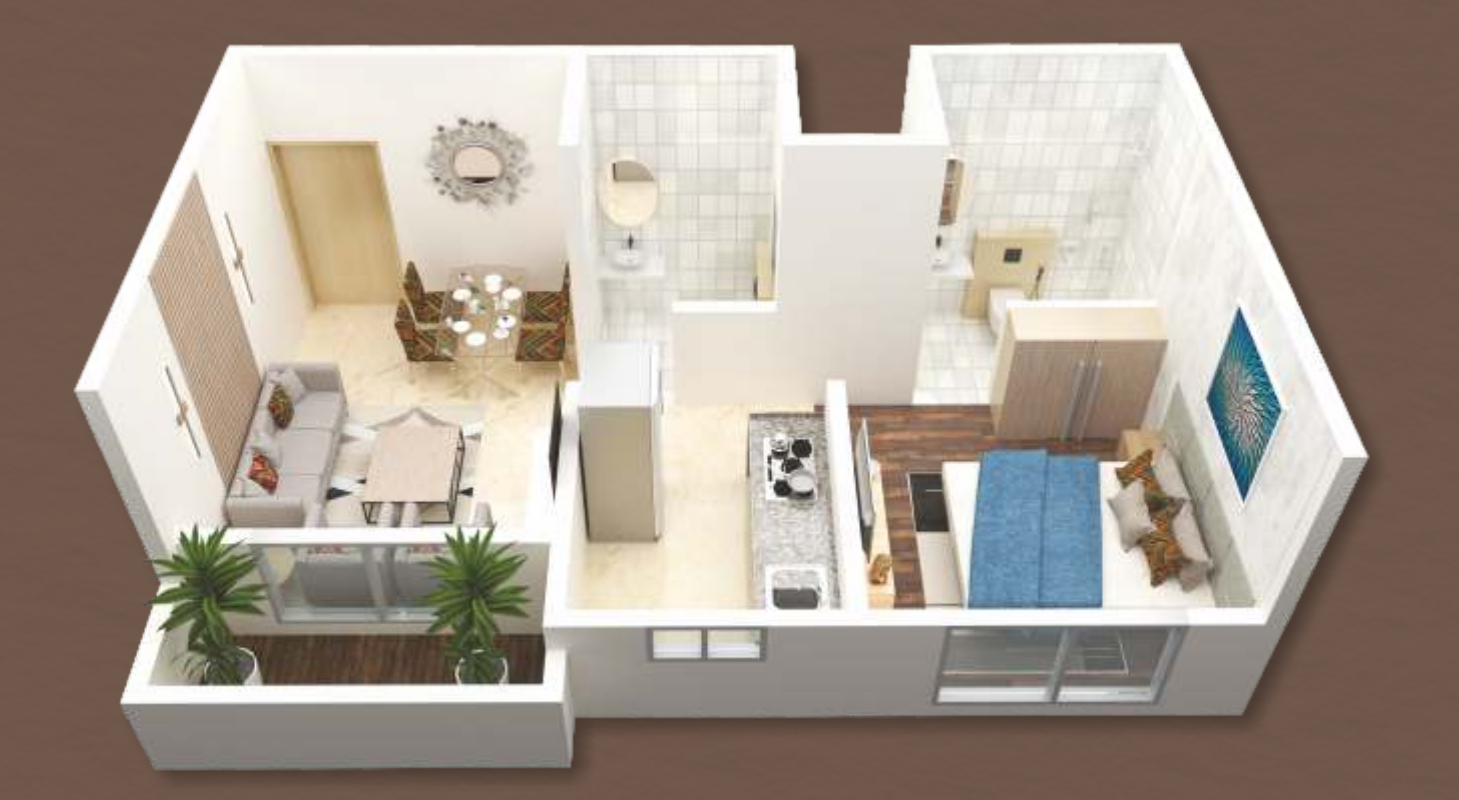
2 BHK ISOMETRIC