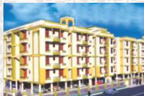
Rudra Apartments Shivpur, Varanasi