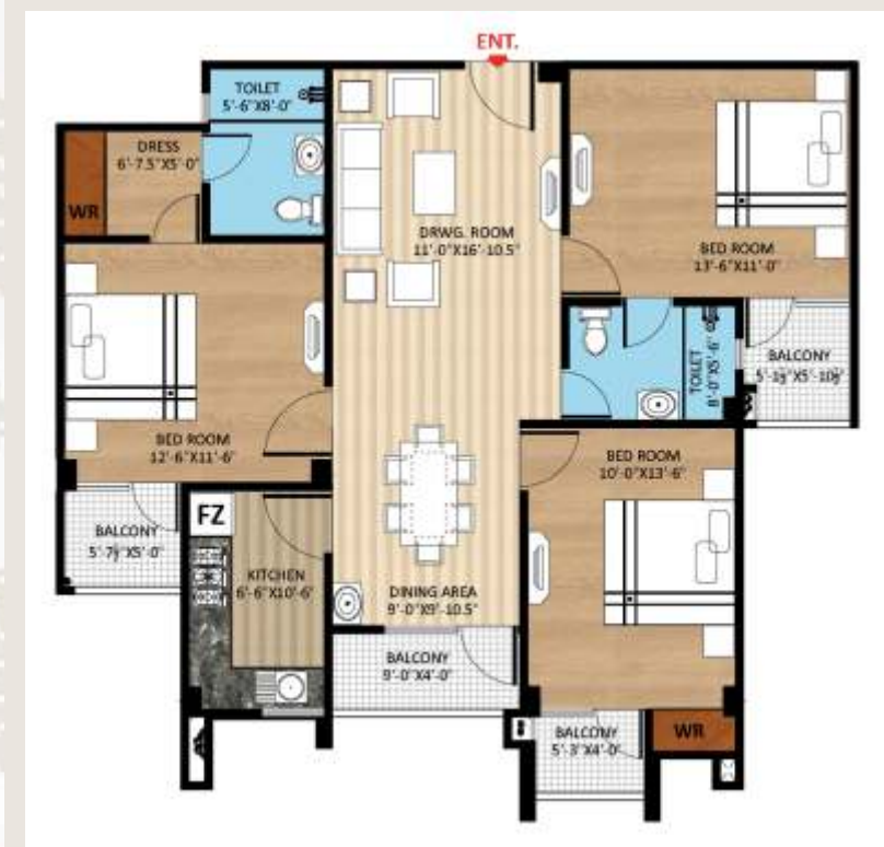
TYPE - 2, 3 BHK, AREA - 1350 Sq.Ft.