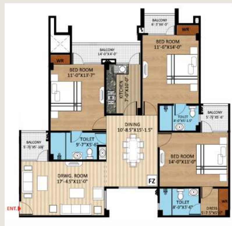
TYPE - 6, 3 BHK, AREA - 1655 Sq.Ft.