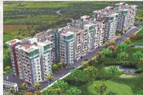
Rudra Greens Singhpur, Kanpur