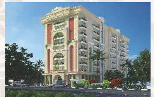
Rudra Prestige Ghantimill, Varanasi