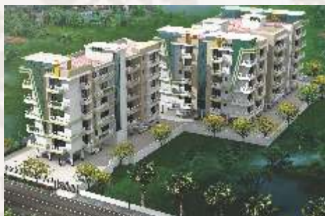
Rudra Twin Towers New Berry Road, Lucknow