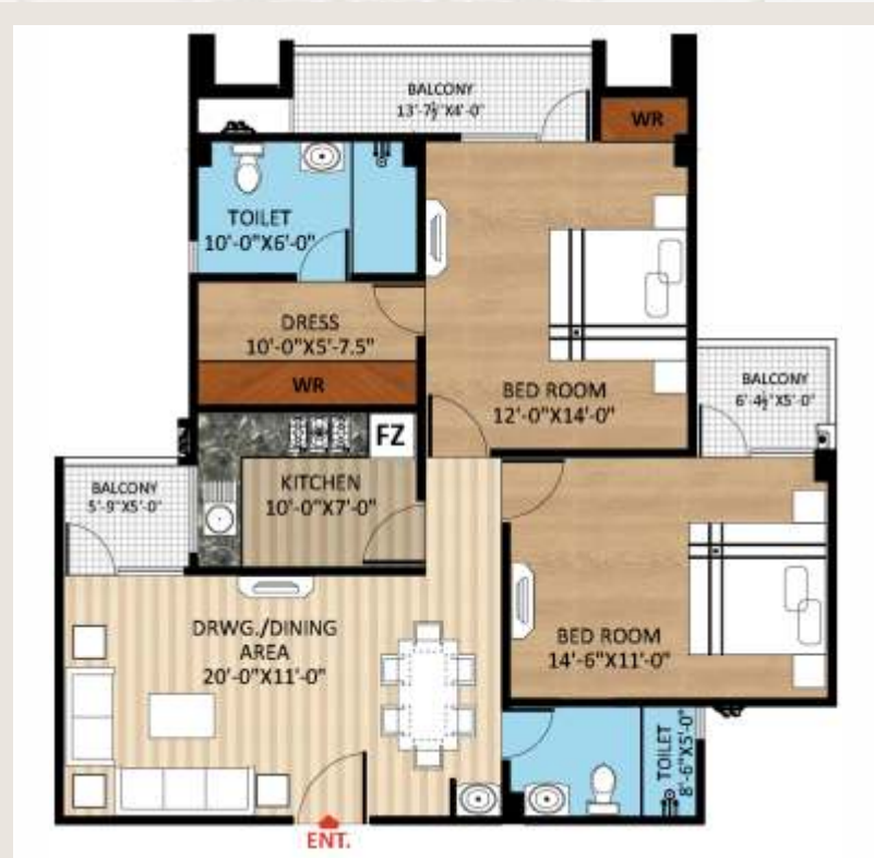
TYPE - 5, 2 BHK, AREA - 1225 Sq.Ft.