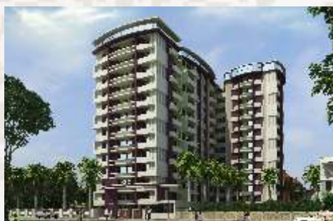
Rudra Banke Bihari Residency Bhaktinagar, Pandeypur, Varanasi