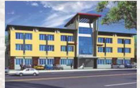
The Mall Kanpur