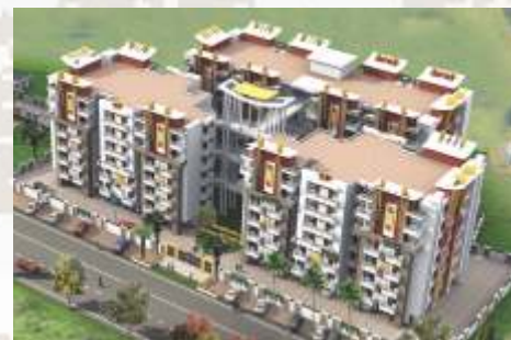
Rudra Towers Sunderpur, Varanasi