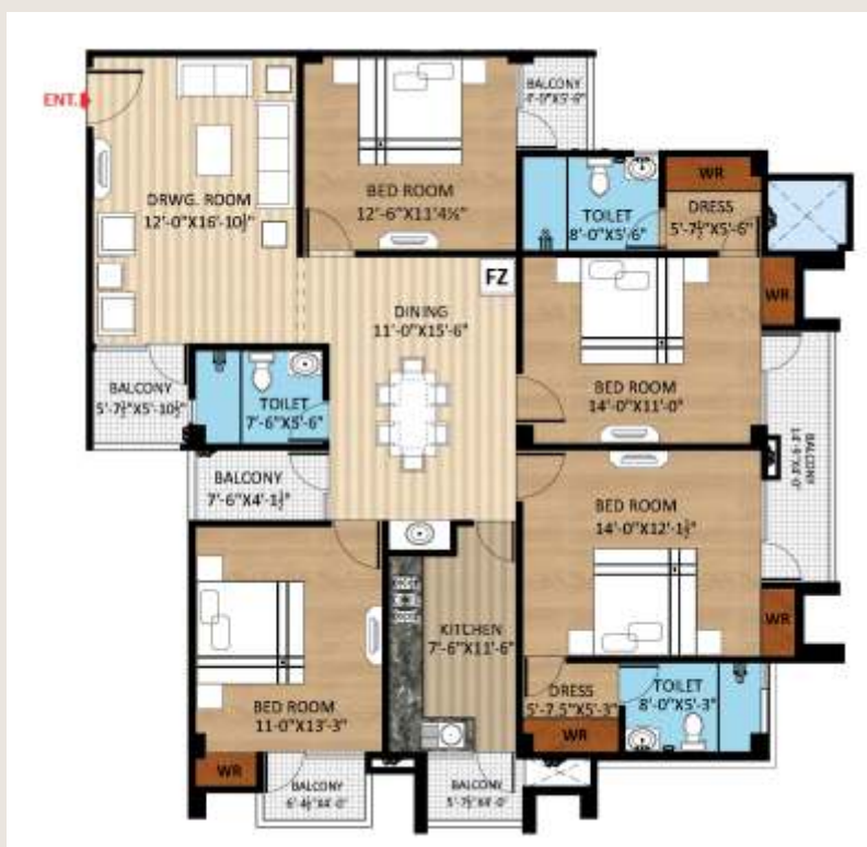
TYPE - 1, 4 BHK, AREA - 2000 Sq.Ft.