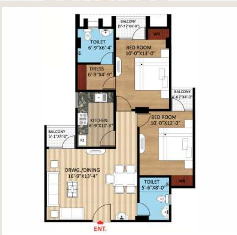
TYPE - 9, 2 BHK, AREA - 1022 Sq.Ft.