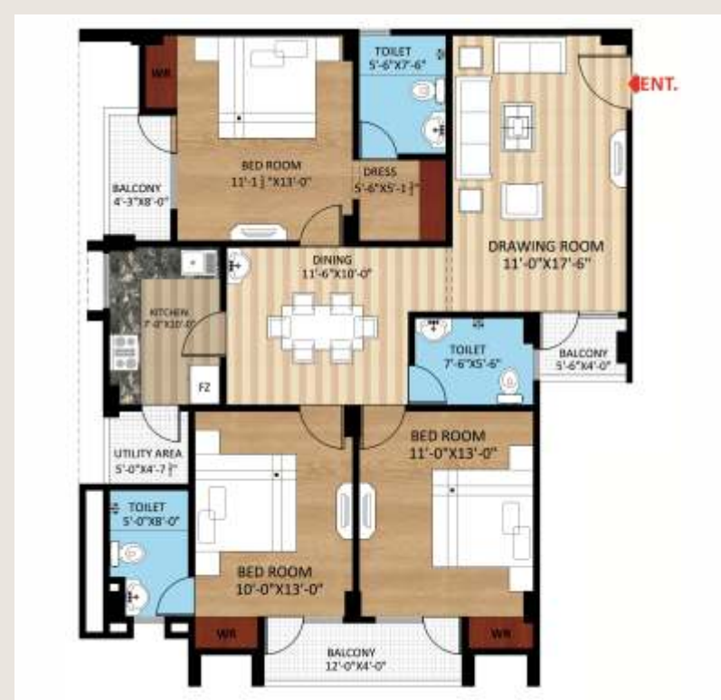
TYPE - 8, 3 BHK, AREA - 1495 Sq.Ft.