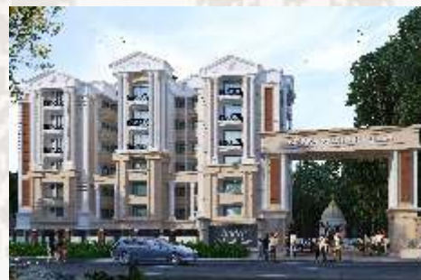
Rudra Mukund Villas Nati Imli, Varanasi