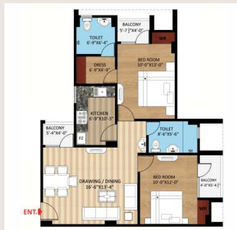
TYPE - 10, 2 BHK, AREA - 1055 Sq.Ft.