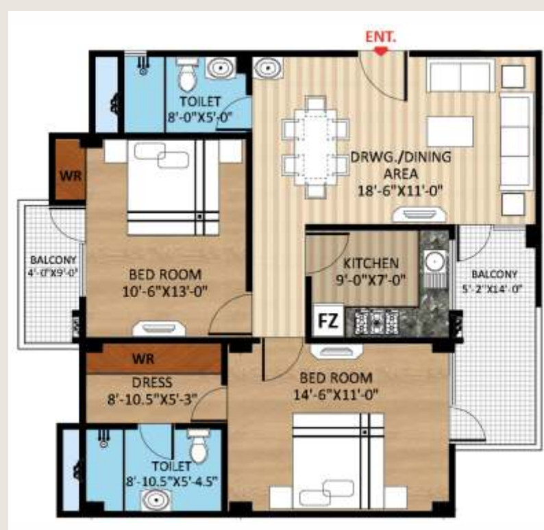
TYPE - 7, 2 BHK, AREA - 1130 Sq.Ft.