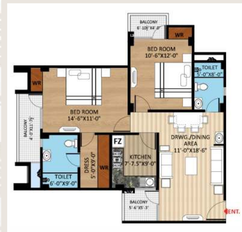
TYPE - 4, 2 BHK, AREA - 1130 Sq.Ft.