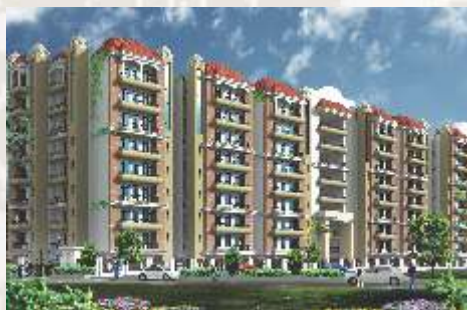
Rudra Heights Paharia, Varanasi