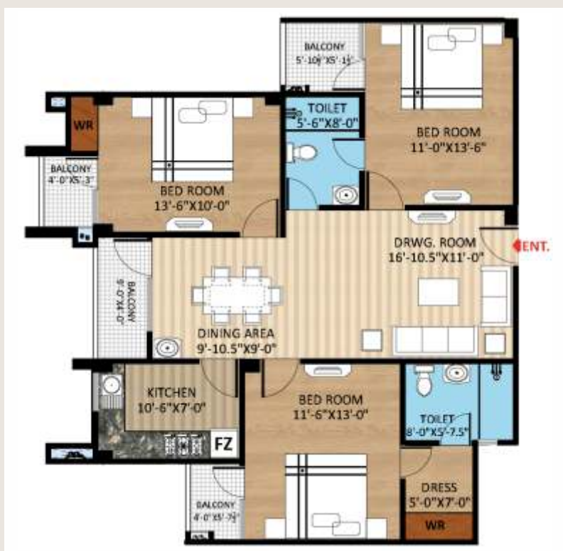
TYPE - 3, 3 BHK, AREA - 1370 Sq.Ft.