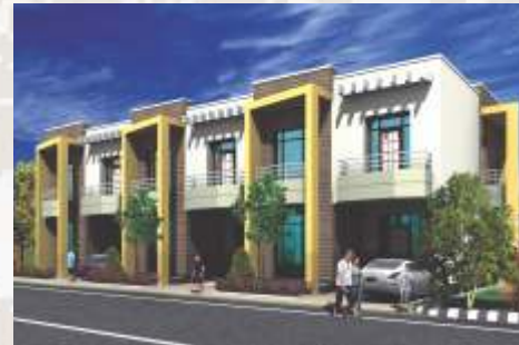
Rudra Residency Swaroop Nagar, Kanpur