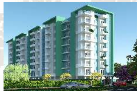
Rudra Samridhi Bhagwanpur, Varanasi