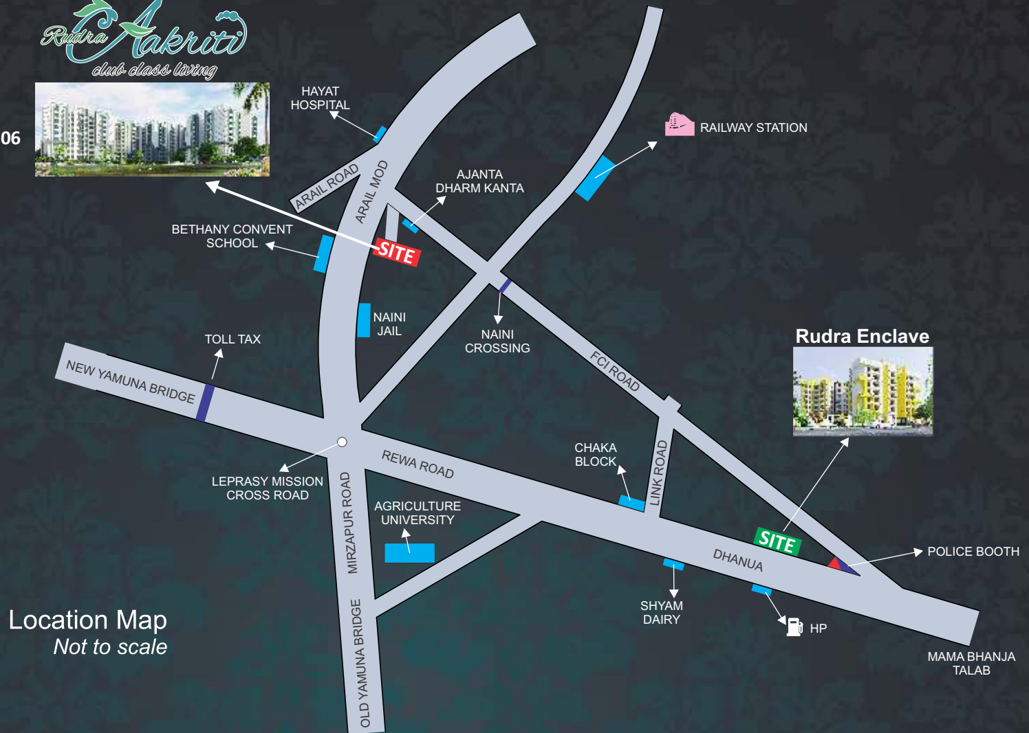
Location Map Not to scale