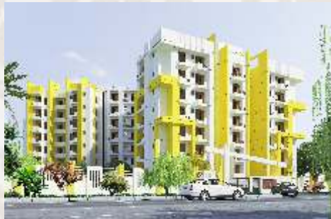
Rudra Enclave Rewa Road, Allahabad