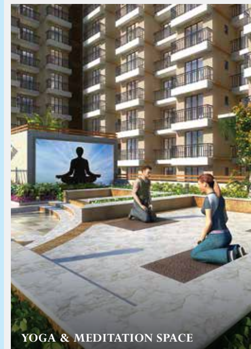
YOGA & MEDITATION SPACE