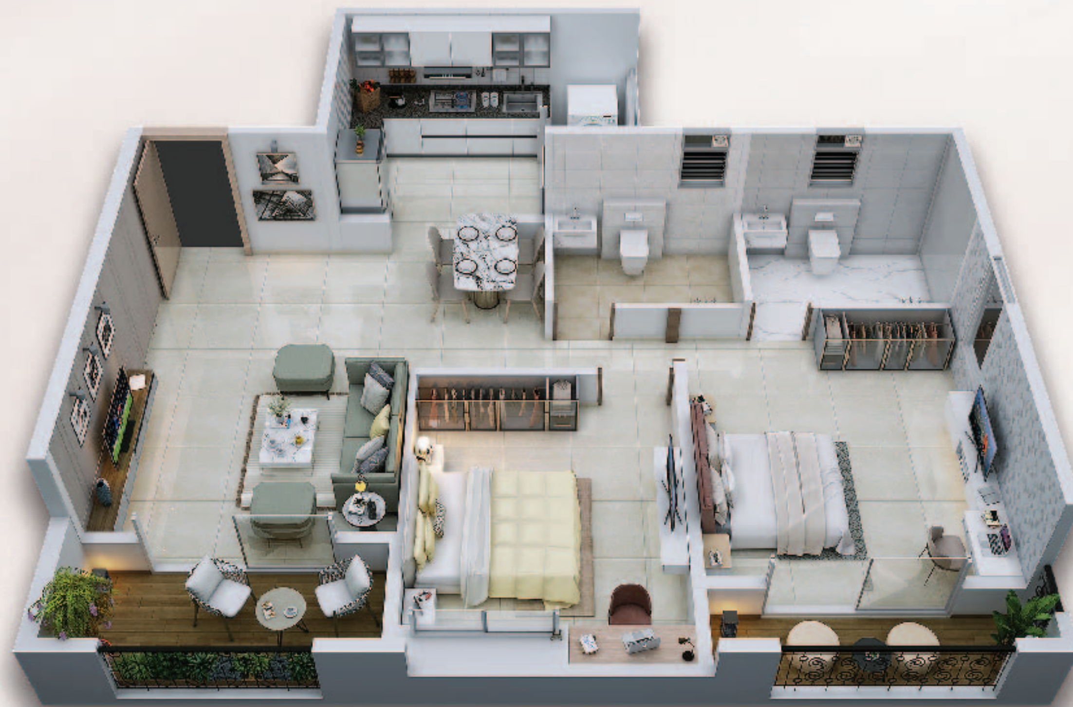
TYPE 2 (L - SHAPED LIVING DINING)