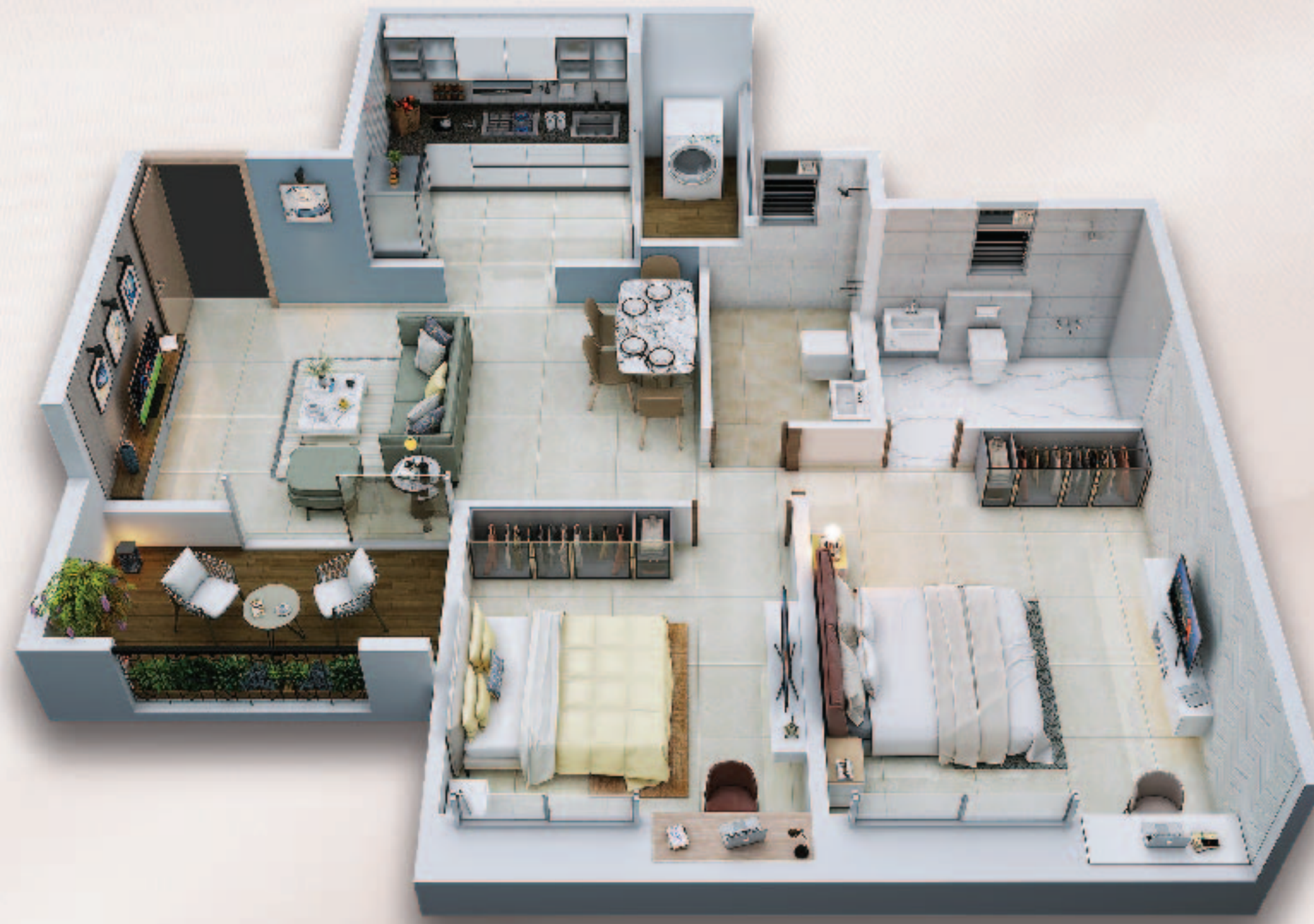
TYPE 1 (RECTANGULAR LIVING DINING)