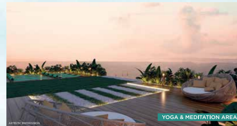
YOGA & MEDITATION AREA

The beauty and luxuries of Gurukrupa Nigam a 16 storey tower which is beyond your imagination. With scenic garden facing residences, Gurukrupa Nigam is an ideal place for those who are looking for an eco-friendly and green environment. Breathe in the healthy air of the surroundings & enjoy the scenic beauty, something that is a rare in Mumbai. Time to go green