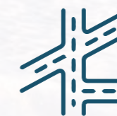
Mumbai Trans-Harbour Link via Eastern Freeway