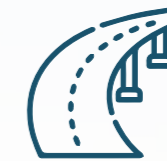
Road Widening Projects