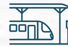
Metro Line 4