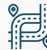
SCLR Phase 2