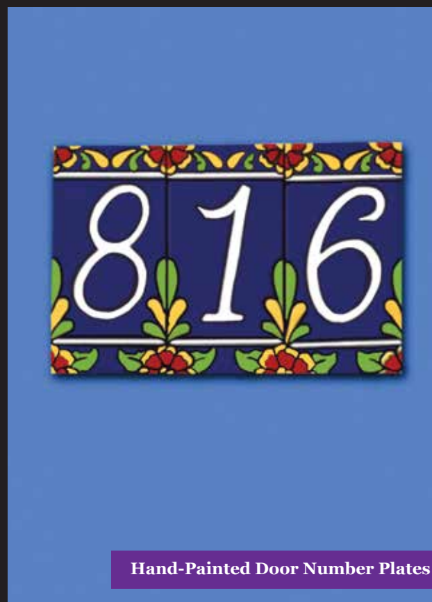
Hand-Painted Door Number Plates