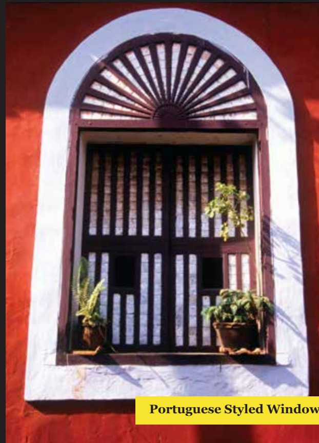
Portuguese Styled Window

The entire elevation and landscape of Adora de Goa stems from the idea of fusion. At Adora de Goa you'll find the true spirit of Goa, that's vintage yet modern in outlook. The bright coloured facade, the Piazza, Baroque statues, hand painted tiles and such other thoughtful fixtures will evoke the grandeur of bygone Portuguese era, while the ultra-modern amenities, precisely finished interiors and fixtures like rain shower in the en-suite bathroom and digital locks at the entrance are a reflection of modern aesthetics.