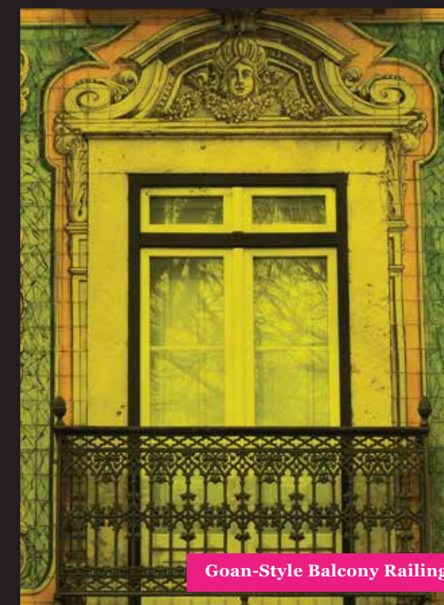
Goan-Style Balcony Railing