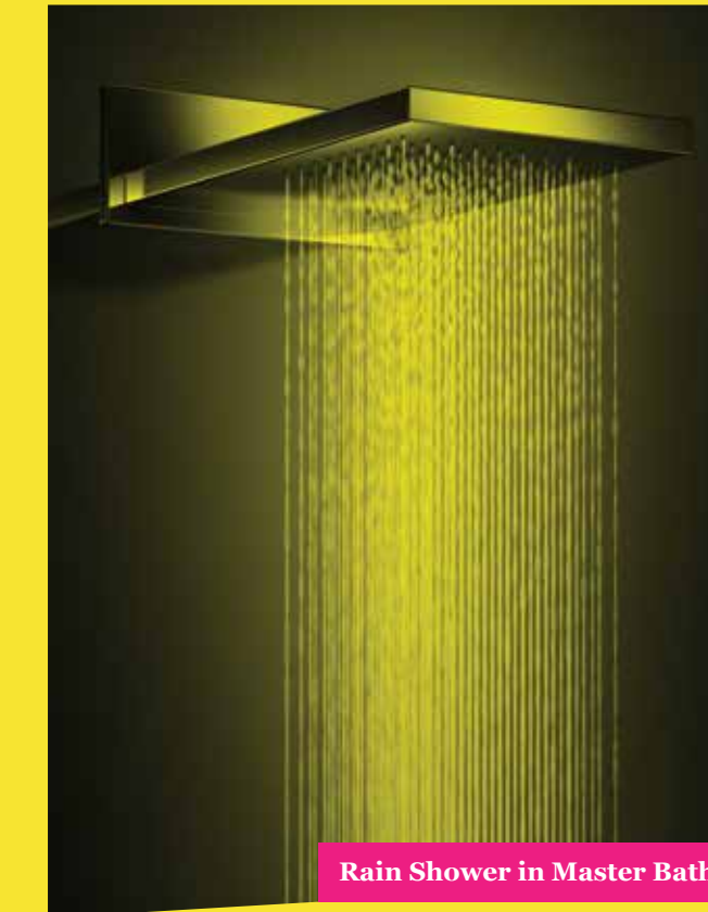
Rain Shower in Master Bath