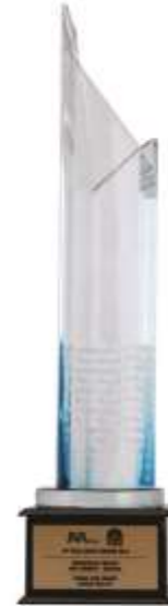
CNBC Awaaz Real Estate Award 2015 - 100 Complete Residential Project Mid Segment for Siddha Pinewoods