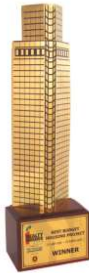
CREDAI Bengal Real Estate Award 2014 - Best Budget Housing Project for Siddha Town Rajarhat