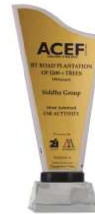
ACEF Excellence in Real Estate Award Most Admired CSR Activity for BT Road Tree Plantation