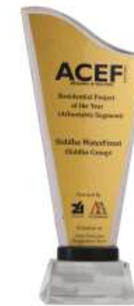
ACEF Excellence in Real Estate Award Residential Project of the year (Affordable Segment) for Siddha WaterFront