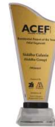
ACEF Excellence in Real Estate Award Residential Project of the year (Mid Segment) for Siddha Galaxia