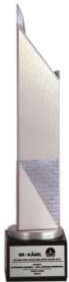
CREDAI Awaaz Real Estate Award 2013 - 100% Complete Residential Affordable Segment for Siddha Town Rajarhat