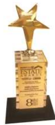
8th Annual Estate Awards 2015 Project of the year for Siddha Galaxia