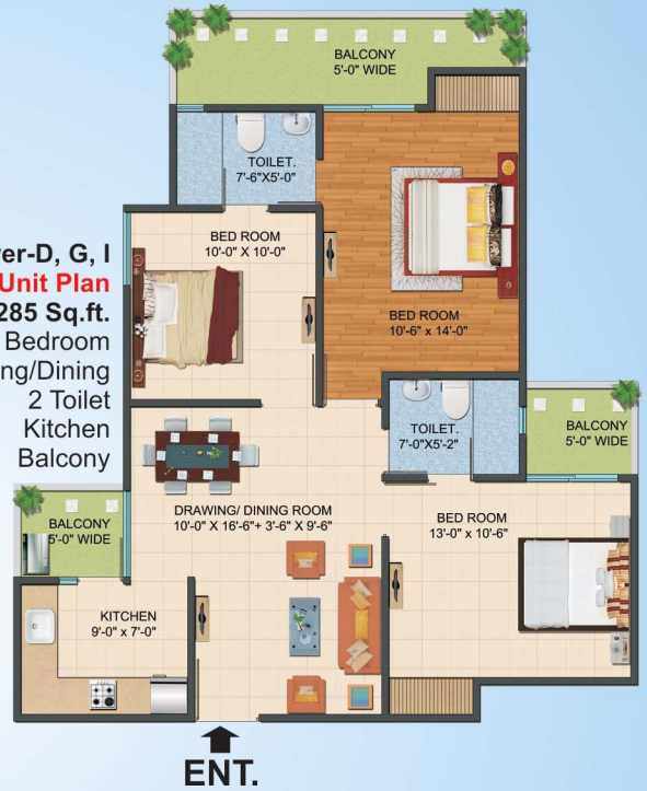
Tower-D, G, I Unit Plan Super Area= 1285 Sq.ft. 3 Bedroom Drawing/Dining 2 Toilet Kitchen Balcony