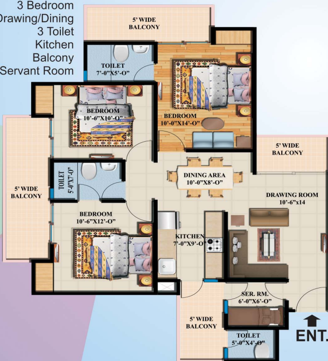
Tower-H, J Unit Plan Super Area 1495 Sq.ft. 3 Bedroom Drawing/Dining 3 Toilet Kitchen Balcony Servant Room