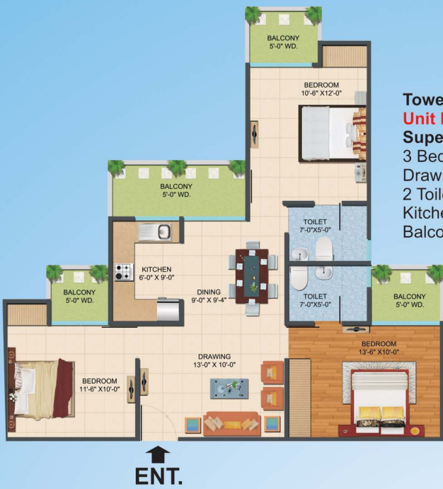
Tower-H, J Unit Plan Super Area= 1195 Sq.ft. 3 Bedroom Drawing/Dining 2 Toilet Kitchen Balcony