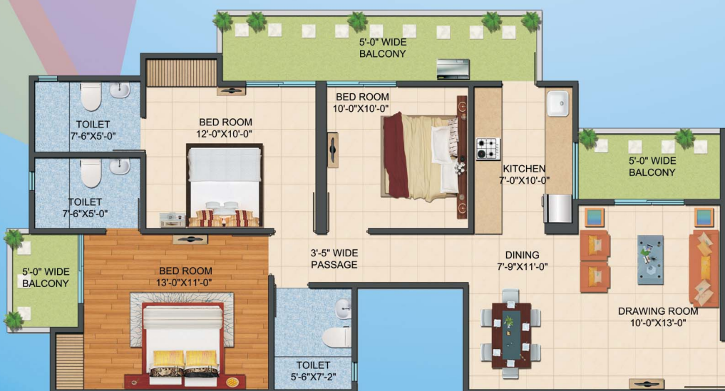
Tower-D, G Unit Plan Super Area= 1500 Sq.ft. 3 Bedroom Drawing/Dining 3 Toilet Kitchen Balcony