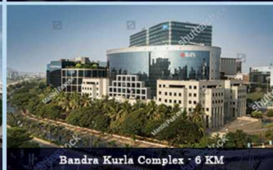
Bandra Kurla Complex - 6 KM