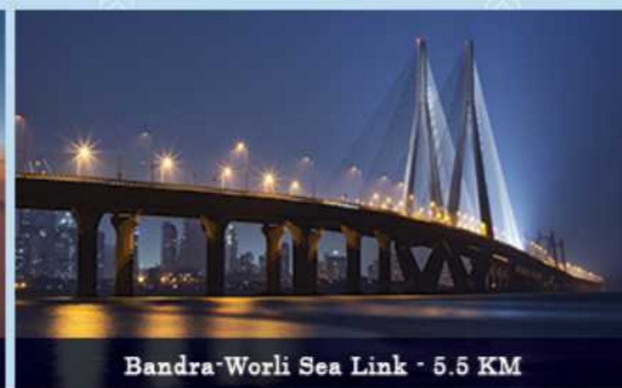
Bandra-Worli Sea Link - 5.5 KM