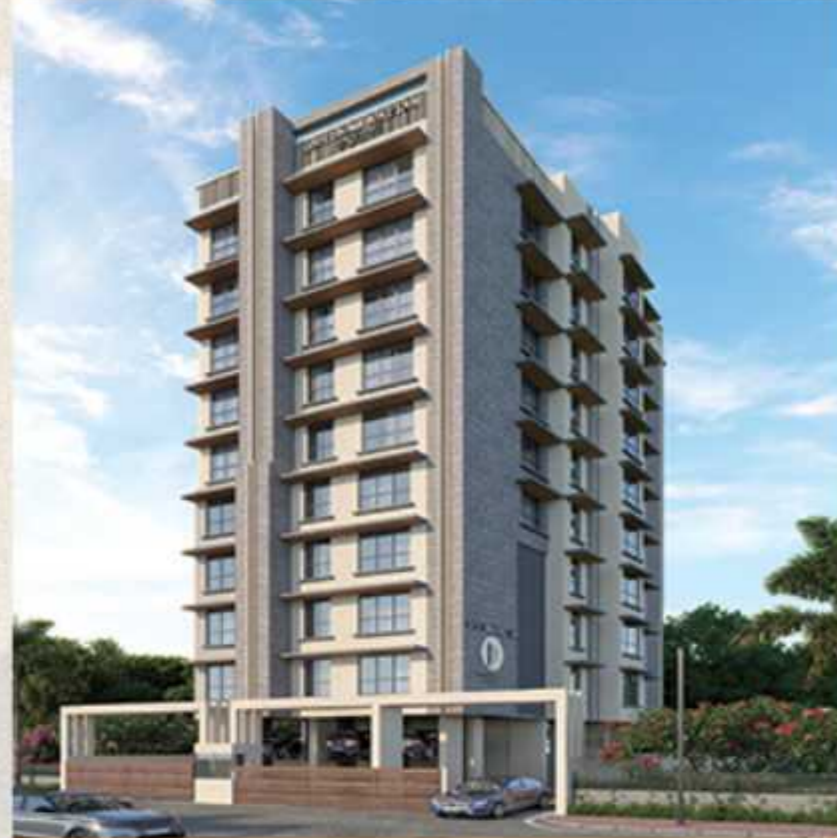
SHIV SHAM NIKETAN KANDIVALI W