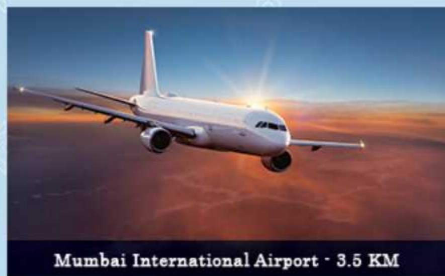
Mumbai International Airport - 3.5 KM