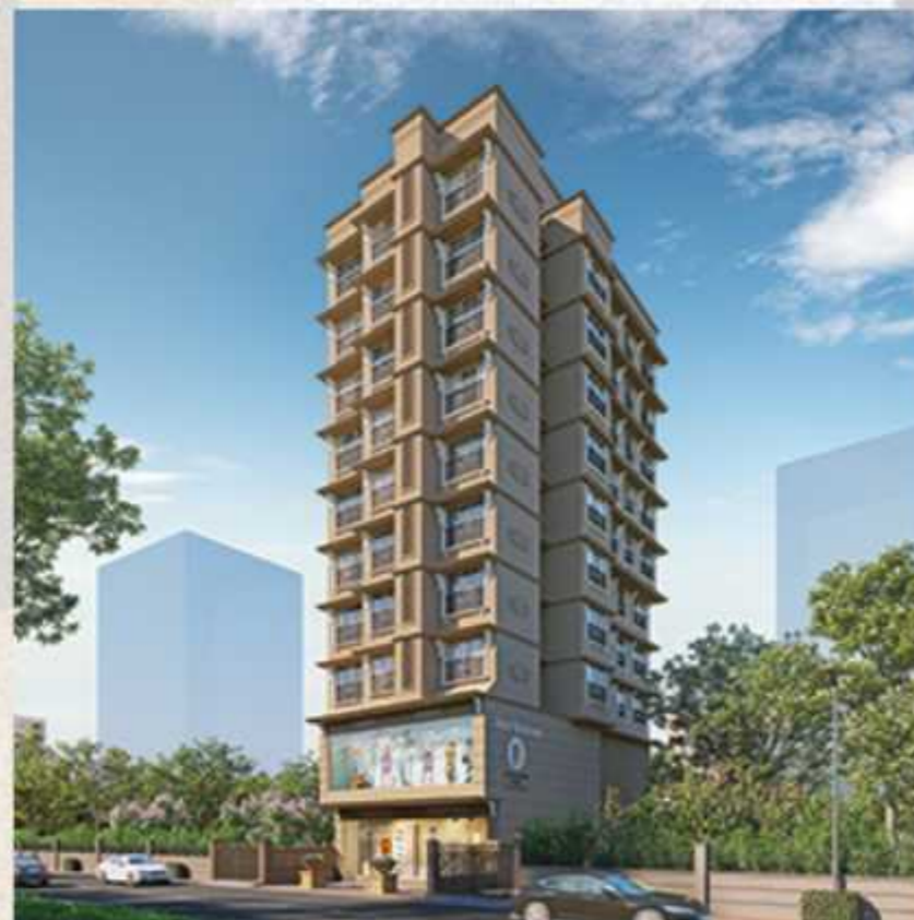
SHIV-RATNAM MALAD EAST (2023)