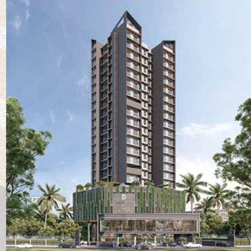
SHIV LILAM BORIVALI E