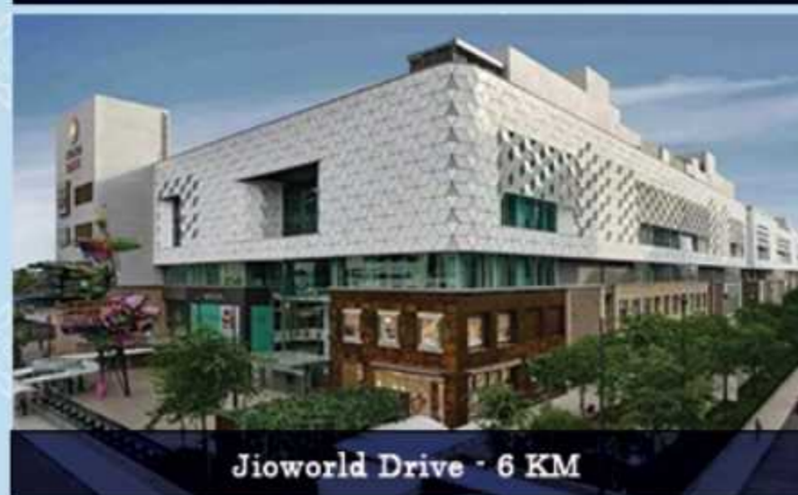
Jioworld Drive - 6 KM