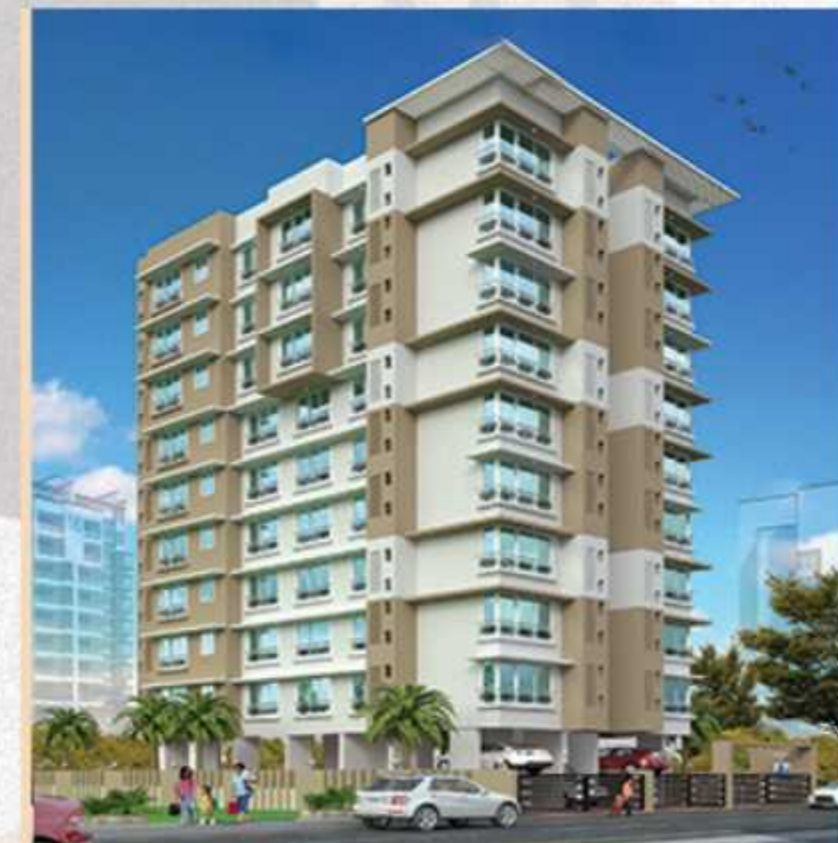
SHIV-SHUBHARAM MALAD EAST (2022)