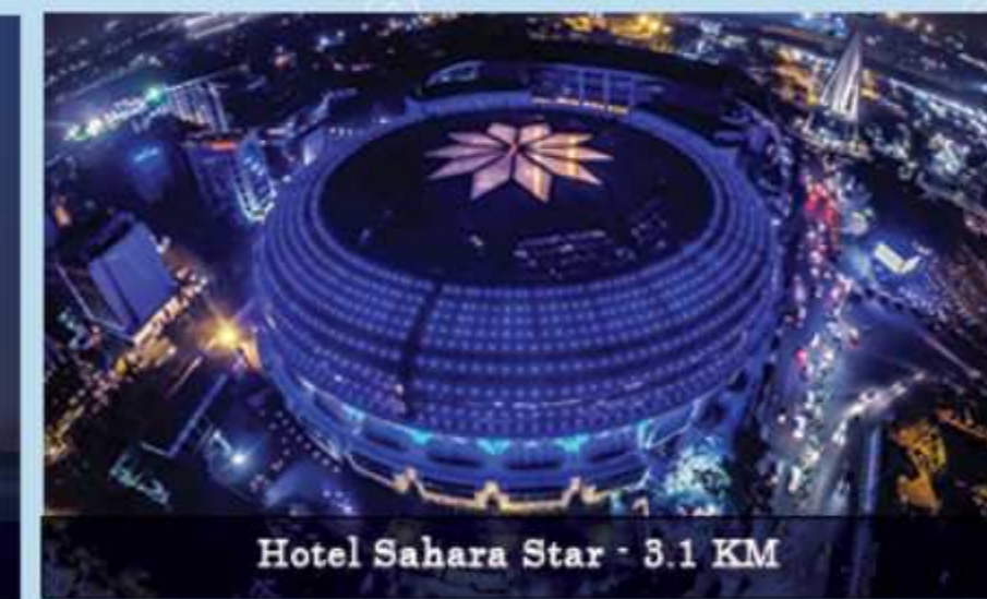
Hotel Sahara Star - 3.1 KM