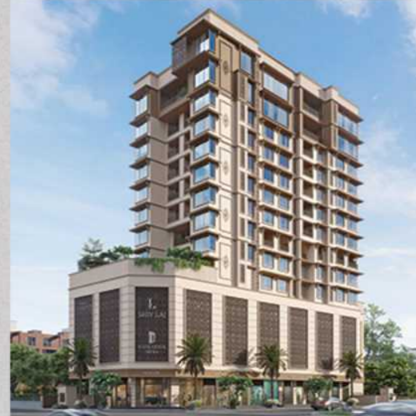
SHIV LAJ SANTACRUZ W