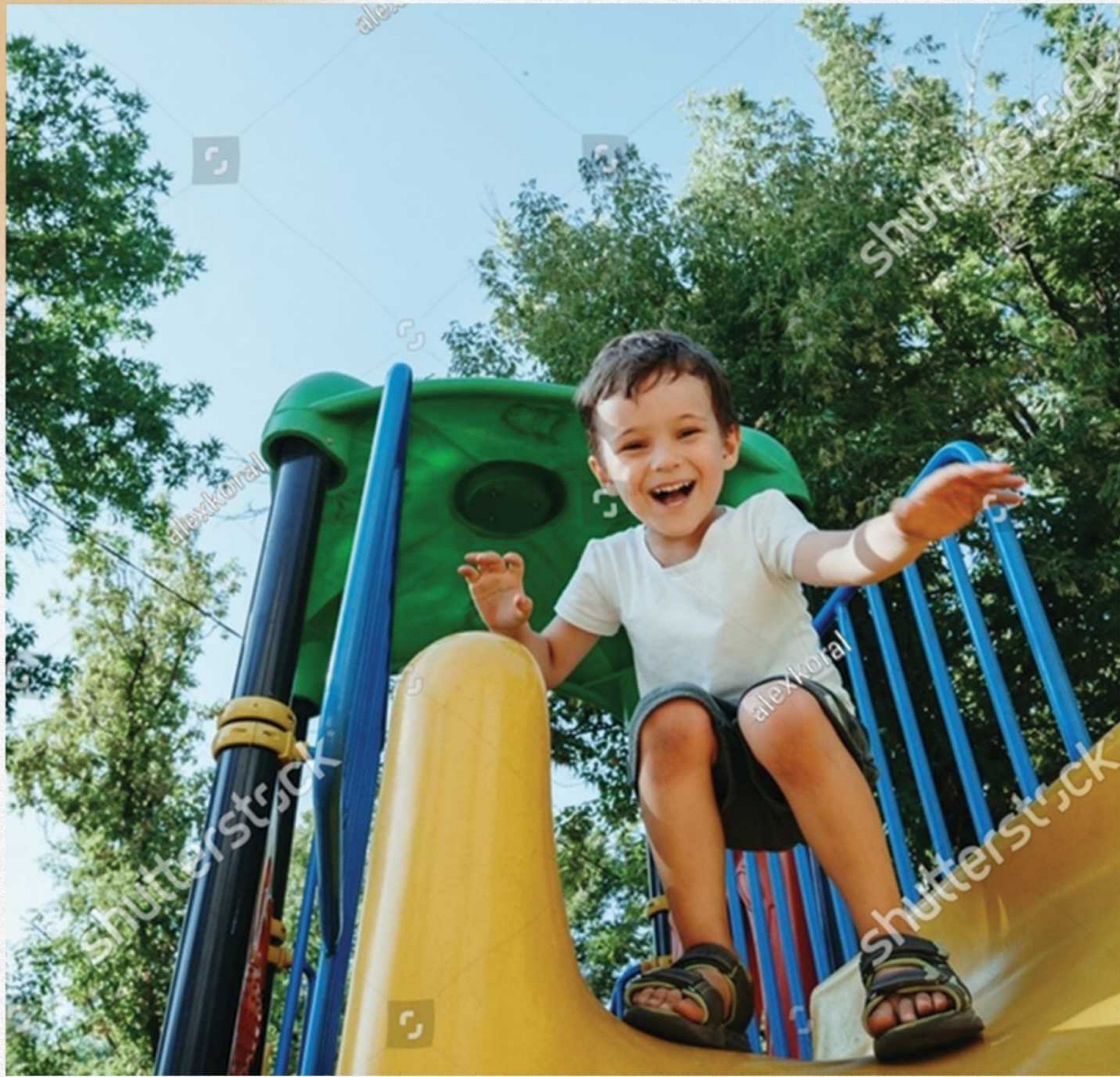
WONDERLAND FOR WONDER KIDS KIDS PLAY AREA