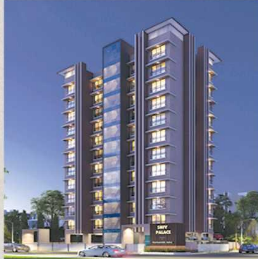
SHIV PALACE MALAD E