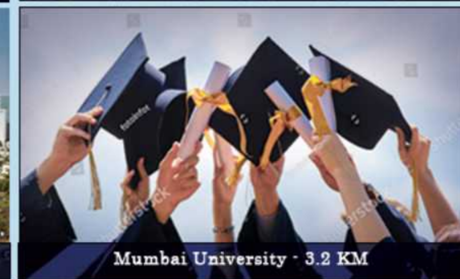
Mumbai University - 3.2 KM