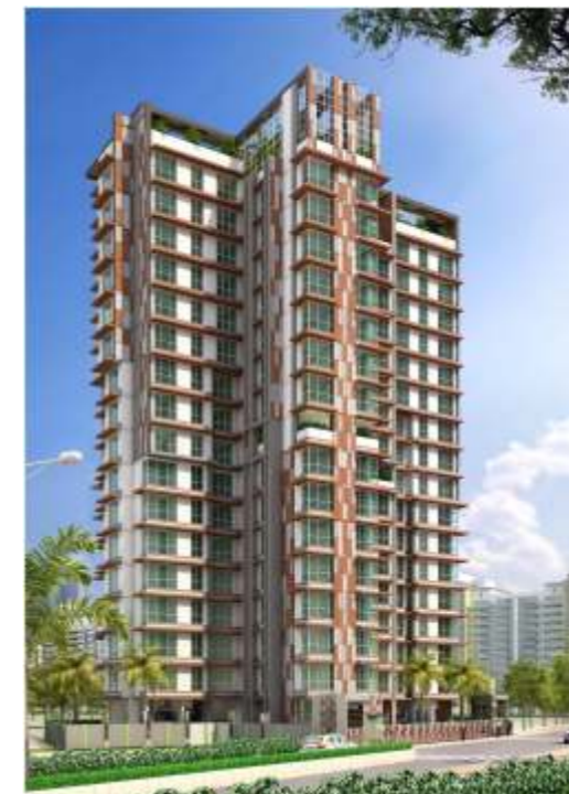
SWANAND OASIS, BLDG. NO. 33, KURLA (E)