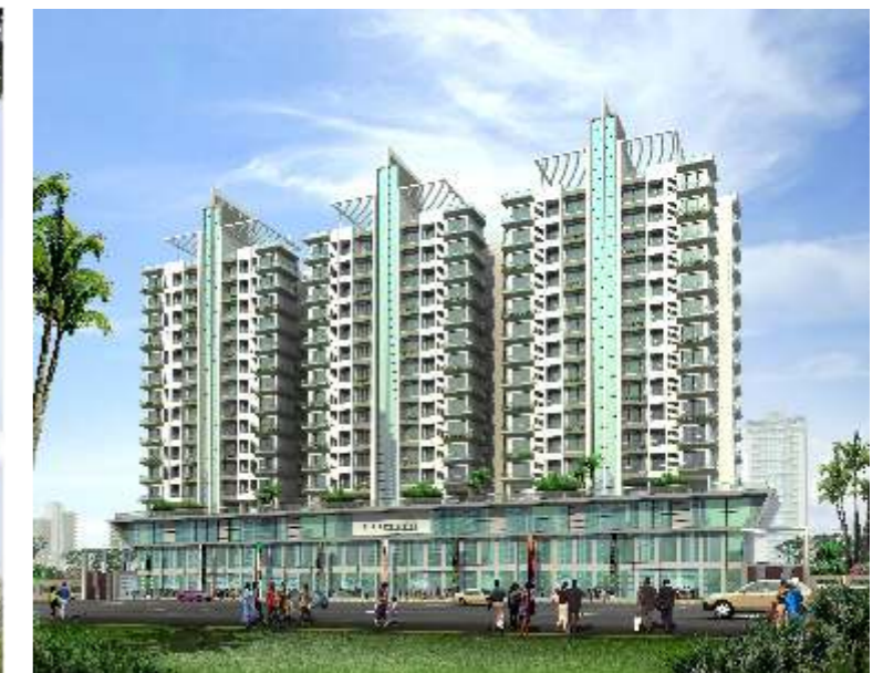
MANGAL MURTI, BLDG. NO. 120, KURLA (E)