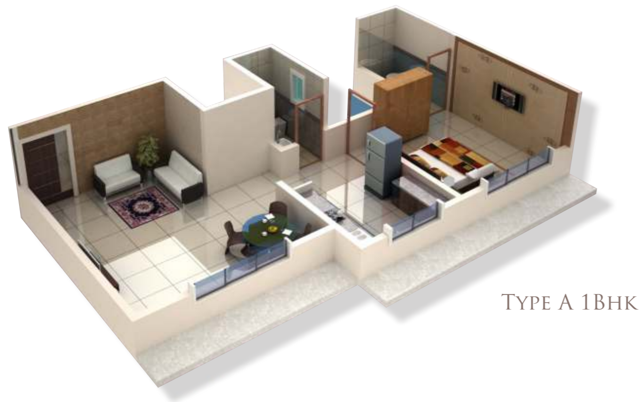
TYPE A 1BHK