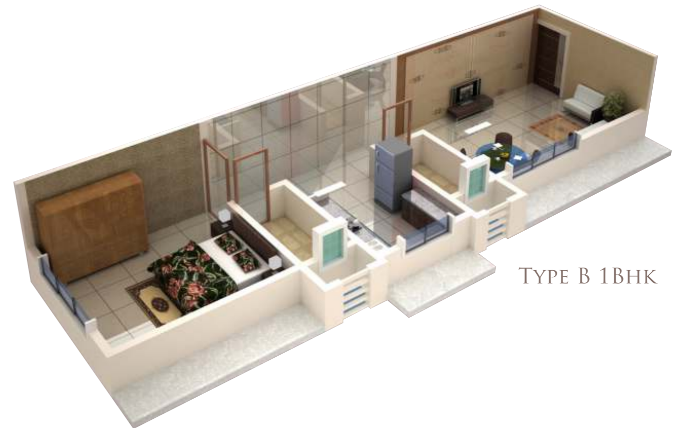
TYPE B 1BHK