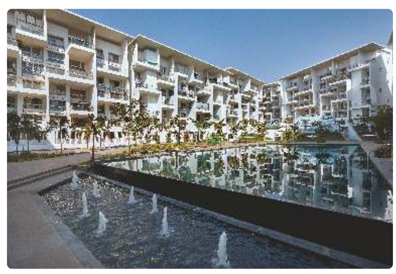
Rohan Kritika, Sinhagad Road