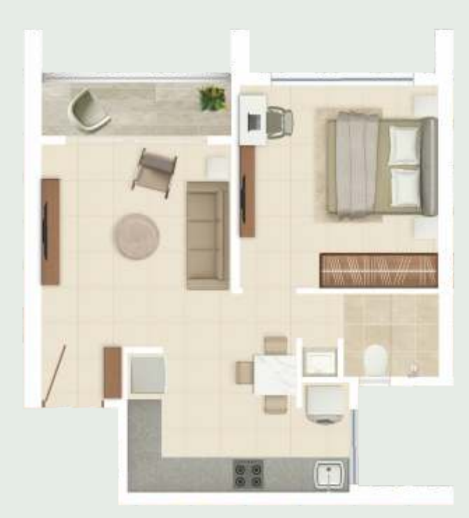
1 BHK A Usable Carpet Area - 443 to 450 sq.ft.