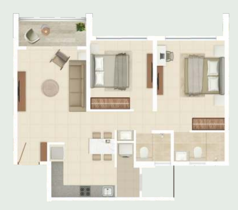
2 BHK C Usable Carpet Area - 713 sq.ft.