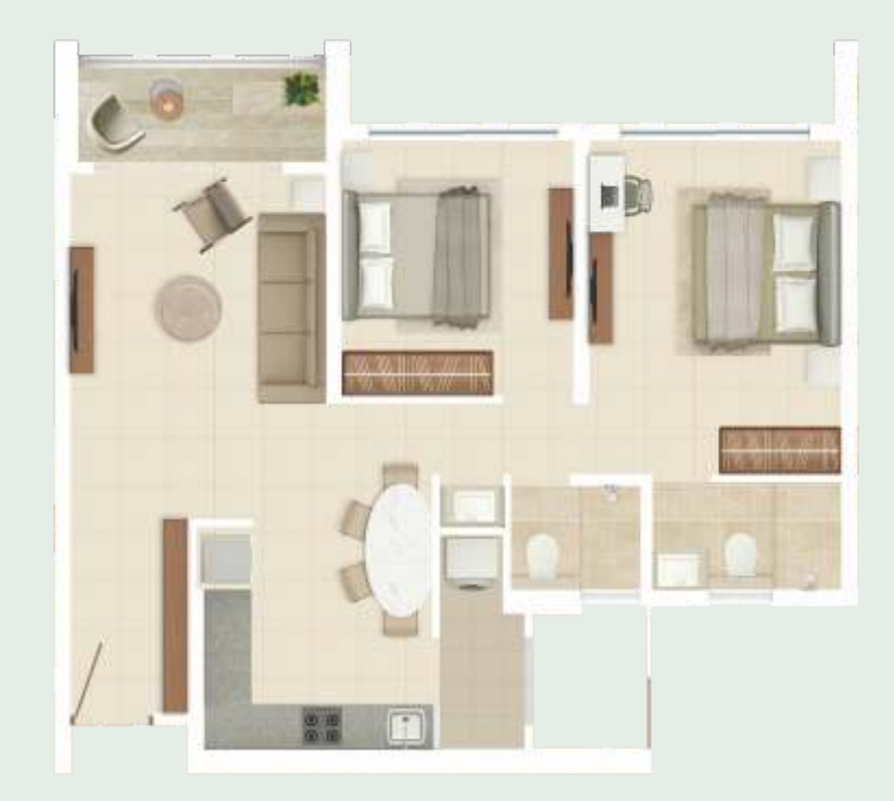
2 BHK PB Usable Carpet Area - 733 to 755 sq.ft.