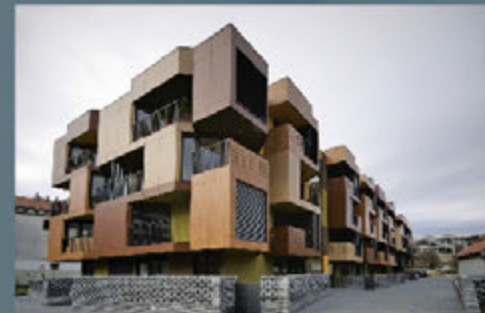
Gurgaon - Eternia Apartments