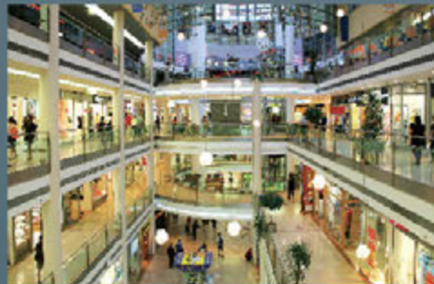
Gurgaon - Credo Galleria