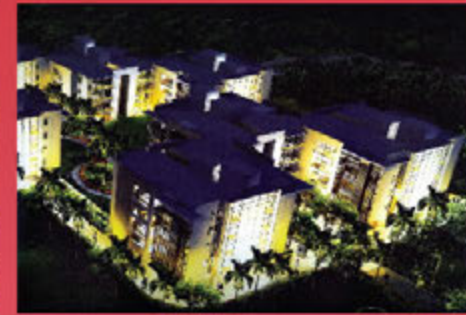
Stupendous Luxury apartments, Amritsar