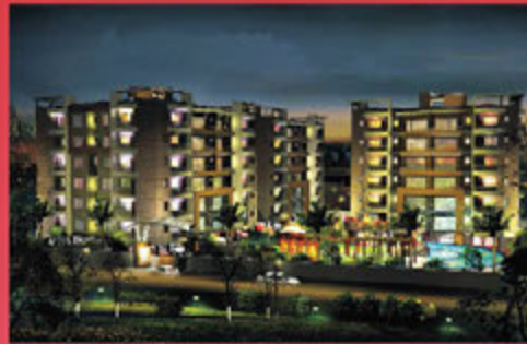
Aerobera apartments, Jammu