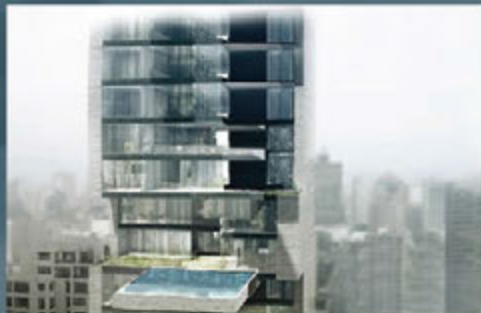
Greater Noida - Orizzonte