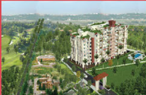
River Castle Apartments, Jammu

When the shades of serenity are spread over the wet canvas of realty sector, we witness three beautiful emerging ventures of Horizon Concept. One such project is located near the heavenly Harminder Sahib, Amritsar, the Stupendous Luxury Apartments . The apartments are built to provide valued living to the non-resident Indians who want to stay close to the divine Golden Temple. Jammu's Aerobera Apartments second the series. These apartments are a perfect blend of beautifully detailed interiors and the best in class amenities. These extensively spaced apartments are a perfect example of an opulent stay. Jammu's River Castle Apartments is another such lavishly detailed project. These apartments are located on the banks of river Tawi, overlooking the golf course. These apartments are aesthetically designed to provide its residents with all the comfort and luxury they can think of.