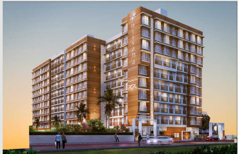
Nirvana Malad (W)