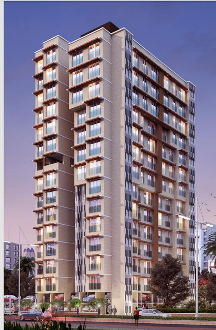
Sparsh Malad (W)