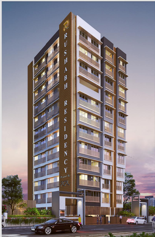
Rushabh Residency Malad (E)

PCPL don't just build homes, they build memories with several such loving homes have become their legacy.