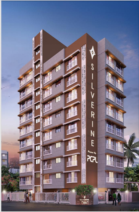
Silverene Malad (W)