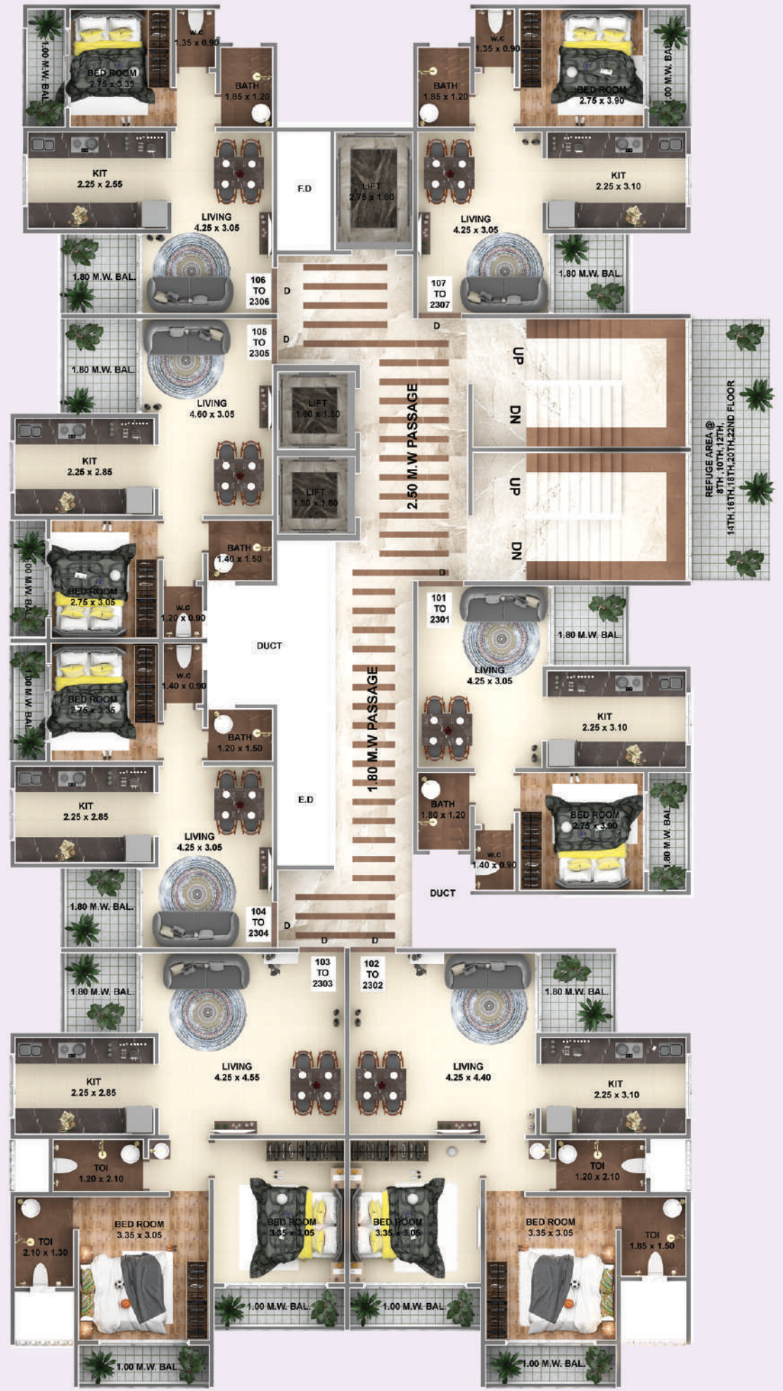
1st to 23th floor plan (11th to 23th Future expansion)