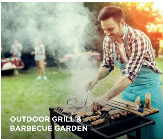
OUTDOOR GRILL & BARBECUE GARDEN