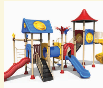
MULTI PLAY STATION