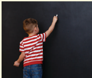
WRITING BOARD FOR CHILDREN