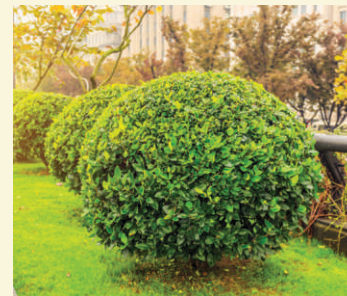
DENSE TREES / SHRUBS