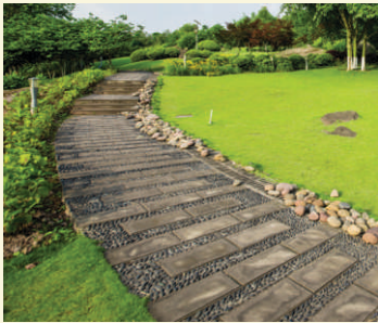
WALKING & JOGGING TRACK