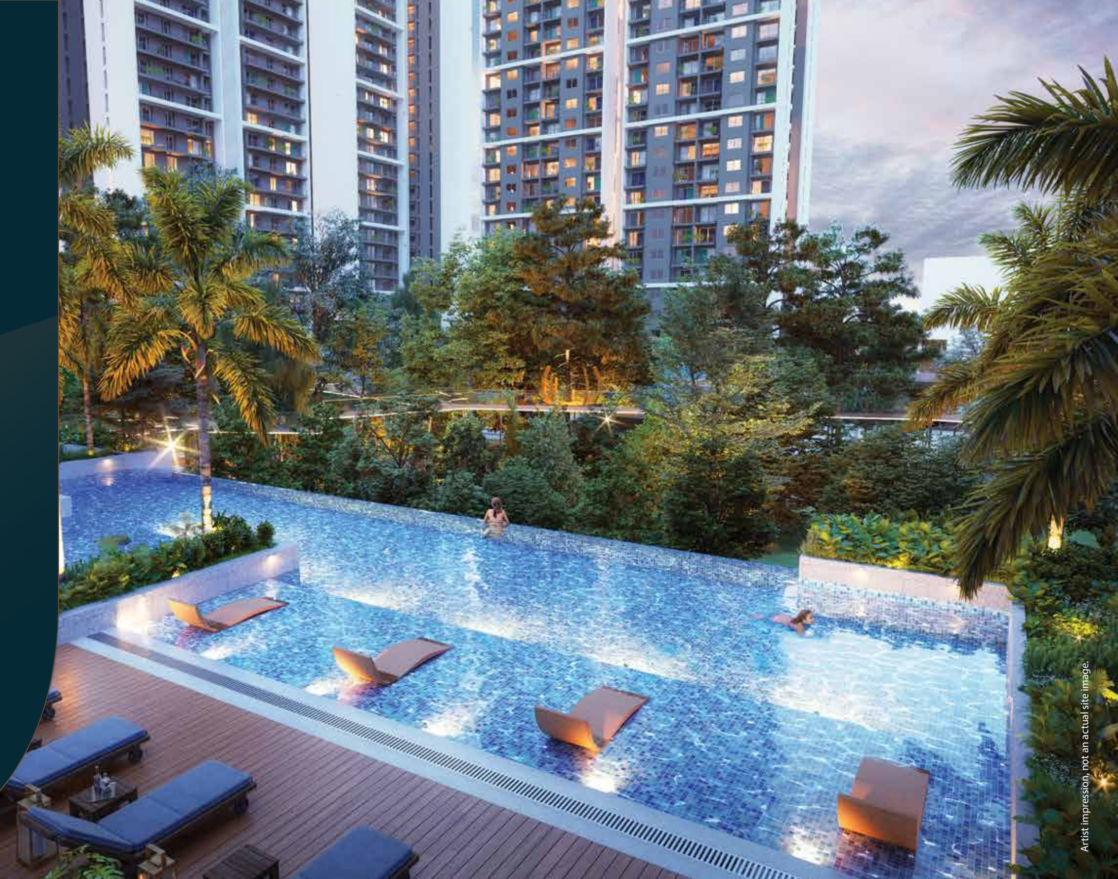
Artist impression, not an actual site image.

When you're in At #PLUMERIA by Godrej Woods, peace of mind is guaranteed. Enjoy exclusive privileges like taking a dip in the swimming pool, munching on your favorite snacks at the cafe or simply taking a stroll in the woods with your loved ones. The choice is always yours!