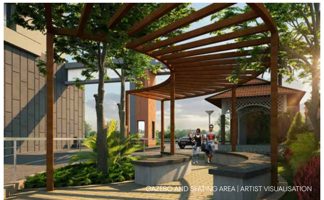
GAZEBO AND SEATING AREA | ARTIST VISUALISATION