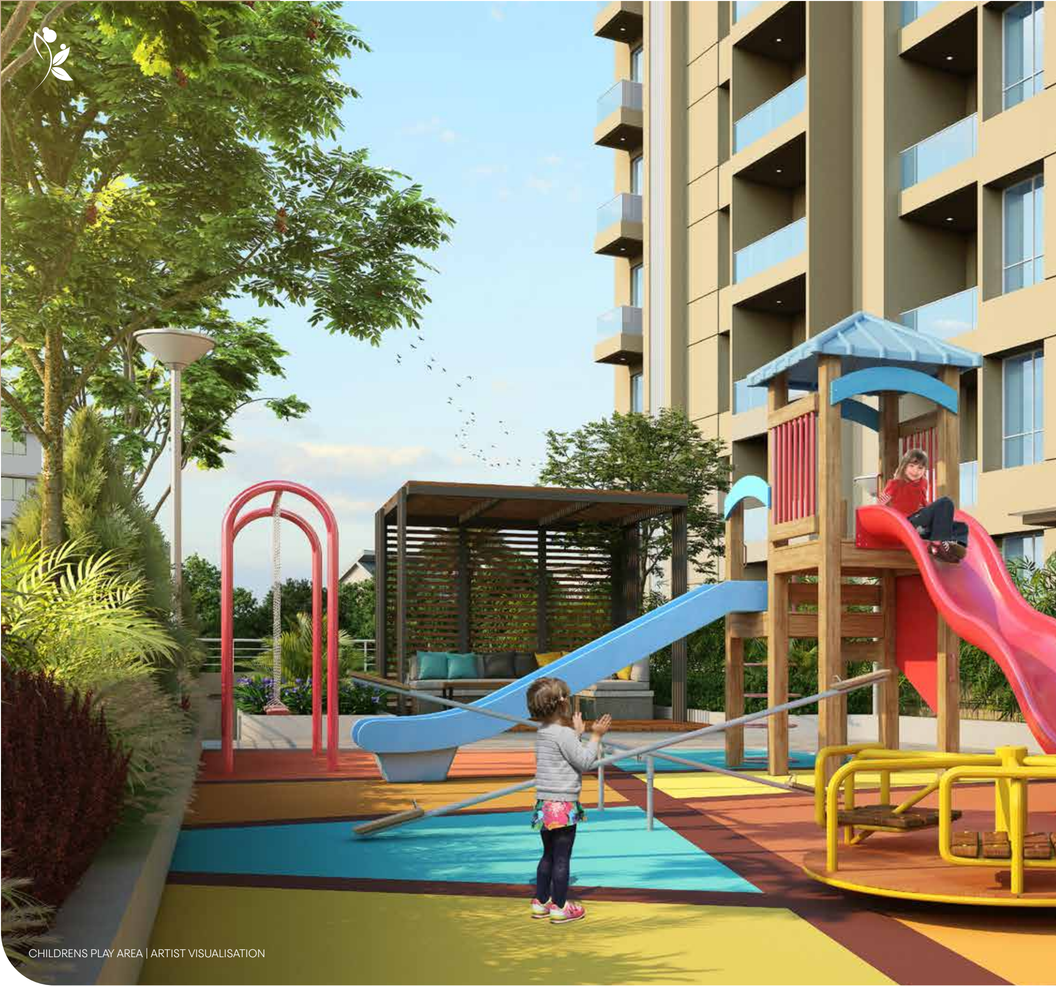
CHILDRENS PLAY AREA | ARTIST VISUALISATION