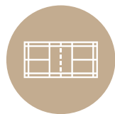
Multipurpose Sports Court