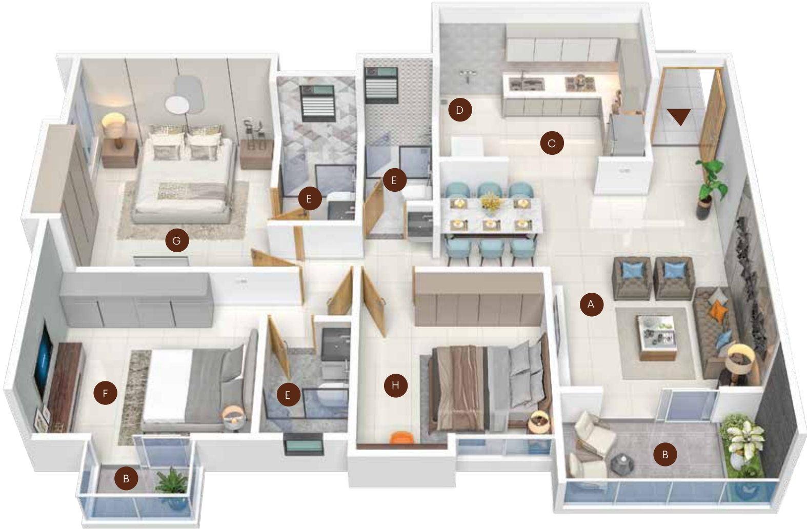
A: Living Room | B: Balcony | C: Kitchen | D: Dry Balcony | E: WC / Bath F: Kids Bedroom | G: Master Bedroom | H: Guest Room