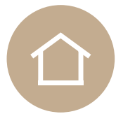
Multipurpose Club House

Delve into the vibe of luxury living wrapped with effulgence of elegance. Devour the pure essence of comfort and leisure at its best. An embodiment that defines the opulence with astounding infra and alluring amenities. Reside amid the most secure gated community, and stroll worry-free around every corner of the project. We know secured services and a safer neighborhood is of paramount importance, that's why your safety is our topmost priority.