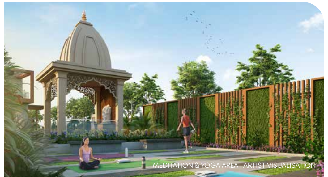
MEDITATION & YOGA AREA | ARTIST VISUALISATION