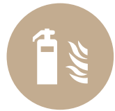
Fire Fighting System for Building as per NBC norm