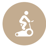
Well Equipped Gymnasium