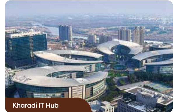
Kharadi IT Hub