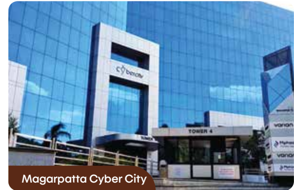
Magarpatta Cyber City