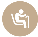
Senior Citizens Sit Out