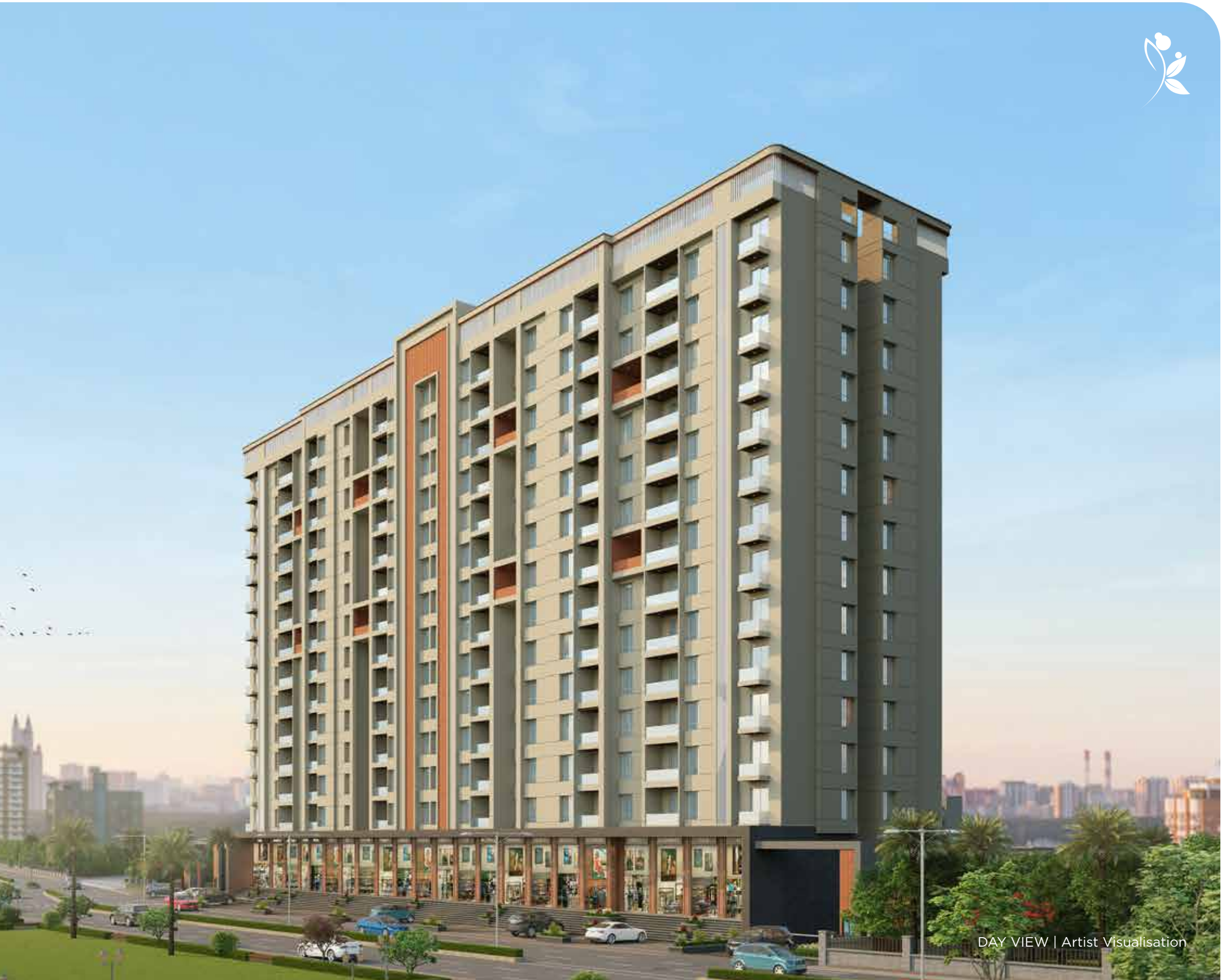
DAY VIEW | Artist Visualisation