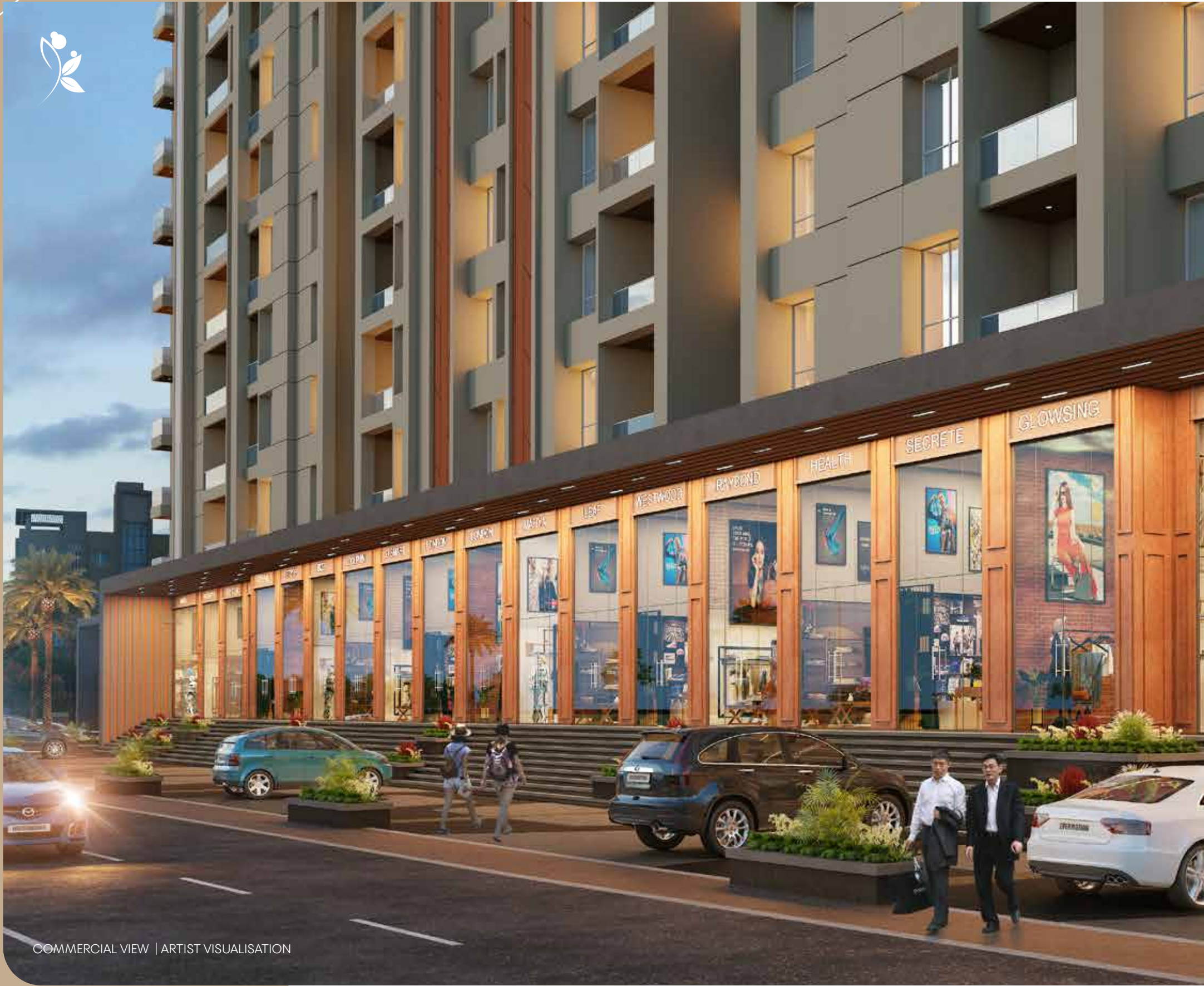
COMMERCIAL VIEW | ARTIST VISUALISATION