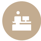
Decorative Entrance Lobby