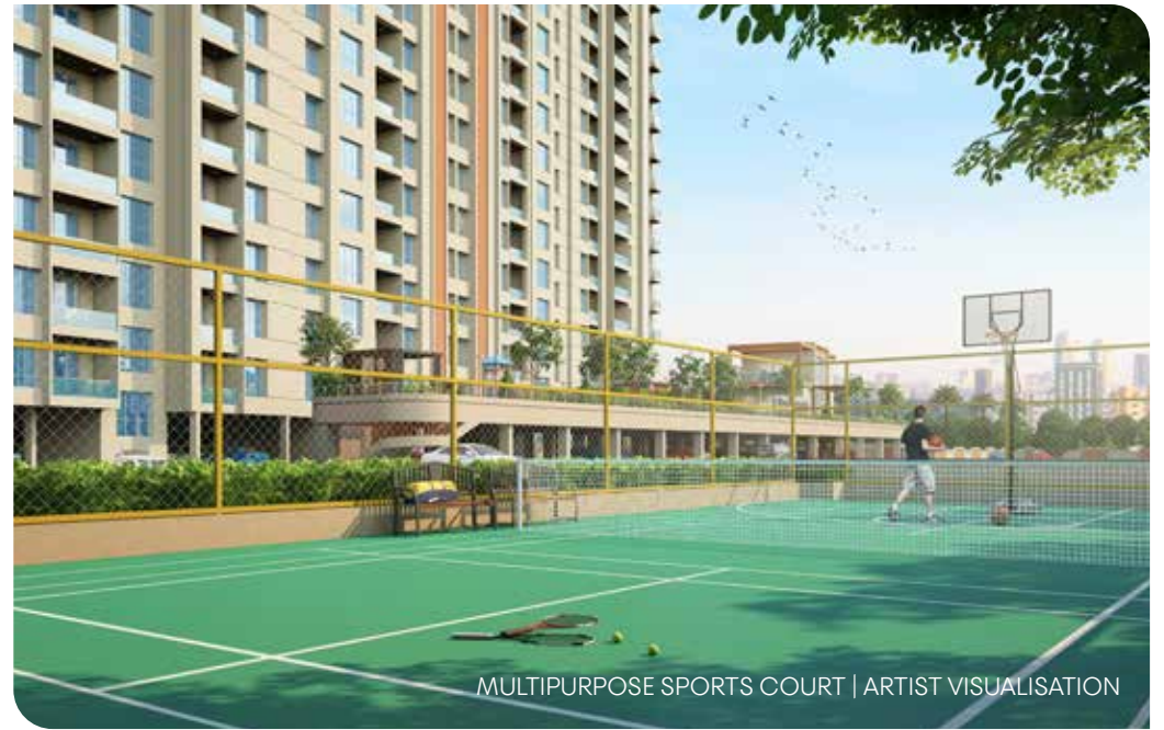
MULTIPURPOSE SPORTS COURT | ARTIST VISUALISATION