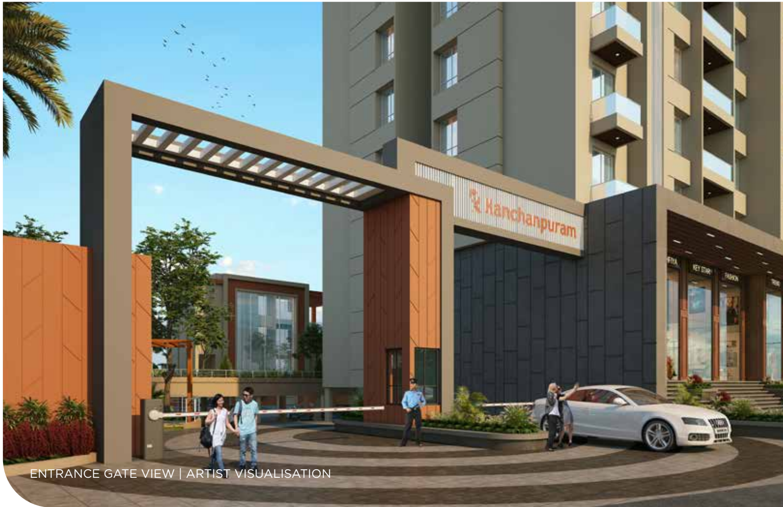
ENTRANCE GATE VIEW | ARTIST VISUALISATION