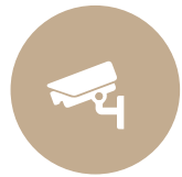
CCTV Surveillance in Common Area