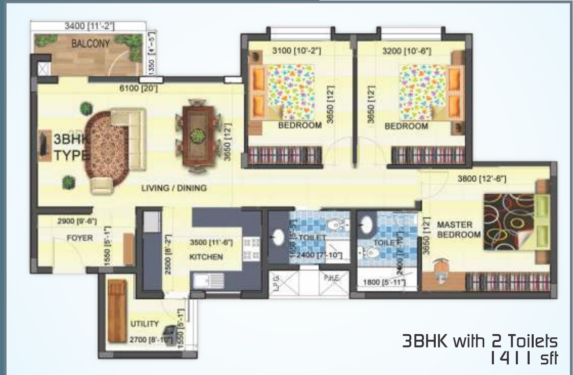
3BHK with 2 Toilets 1411 sft

There's enough room to put everything you need. A little balcony garden, a ventilated utility for storage, washing and hanging clothes, a corridor wall for all those family photos, good sized bedrooms.