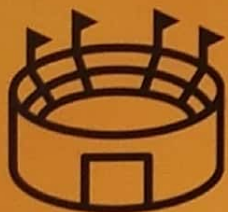
International Cricket Stadium