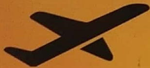
Approved Noida International Airport