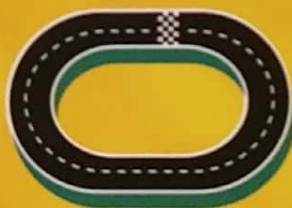
Buddha International Circuit