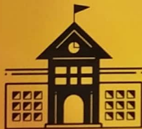
World Class Universities