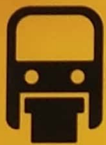
Proposed Mono Rail