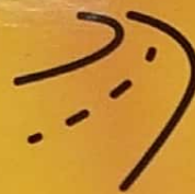
Eastern Peripheral Expressway