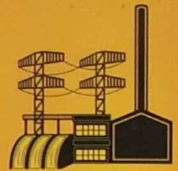
765 KV Power Station