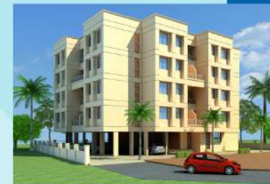
ISHWAR PARADISE NX