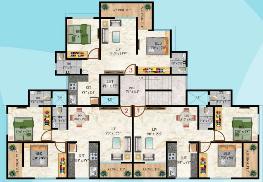
1ST TO 7TH FLOOR PLAN 2 BHK LUXURIOUS FLAT