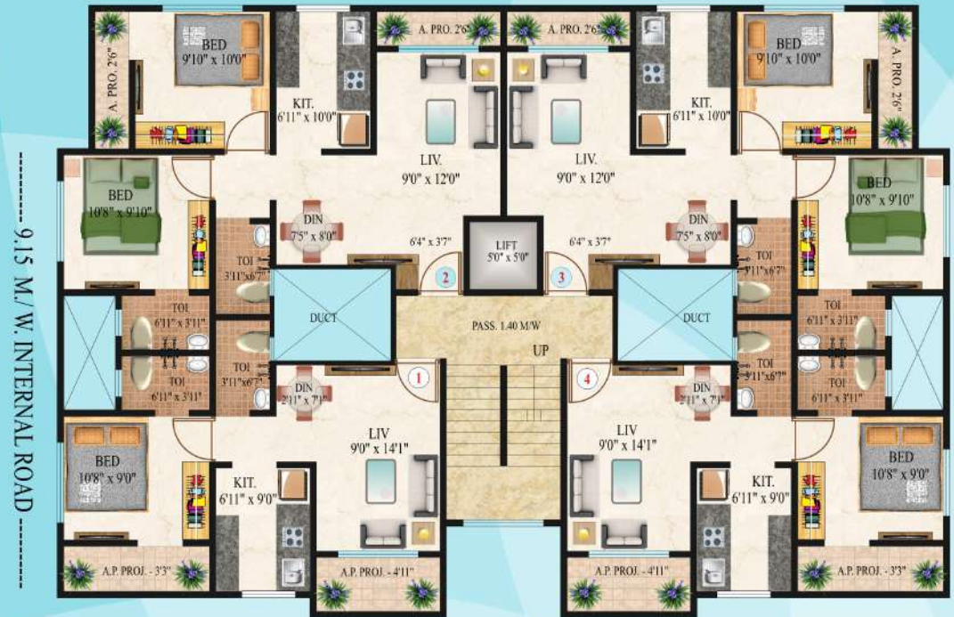
1ST TO 7TH FLOOR PLAN 1 & 2 BHK LUXURIOUS FLAT