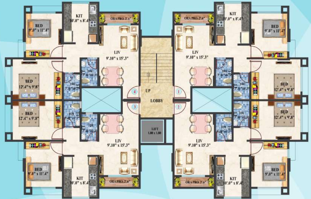
1ST TO 7TH FLOOR PLAN 2 BHK LUXURIOUS FLAT