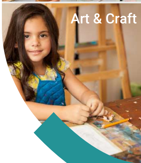
Art & Craft