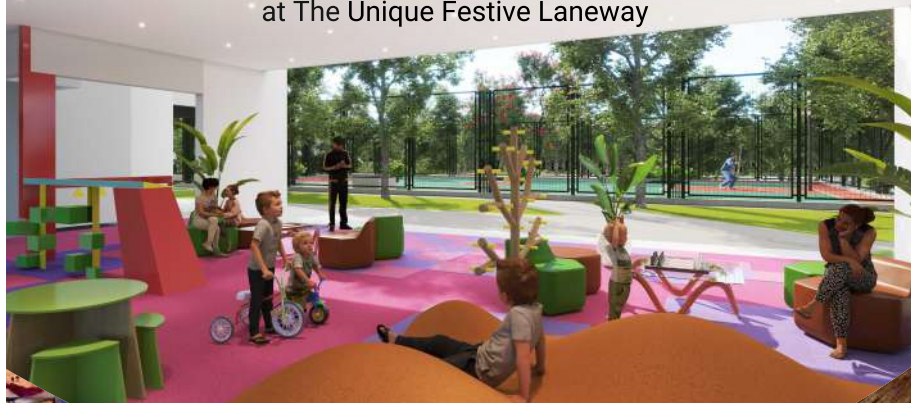
Tiny Tot Play Arena

is enjoying all activities with Family, Friends & Neighbours at The Unique Festive Laneway