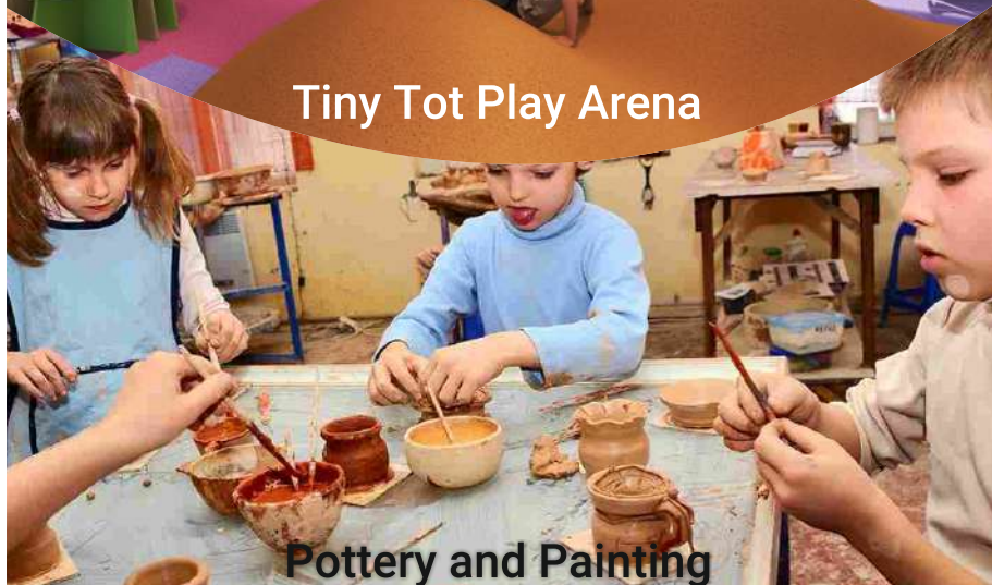
Pottery and Painting