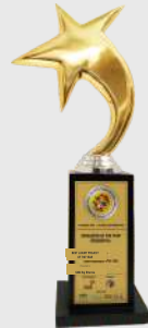
SNN Raj Eternia "Best Luxury Project" by CMO Asia Leadership, Dubai