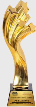
SNN Clermont Awarded Ultra Luxury Project Of The Year 22-23 by ET Awards