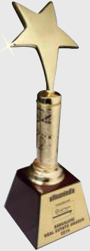
SNN Builders 'Fastest Growing Real Estate Company in Bangalore' By Siliconindia Awards