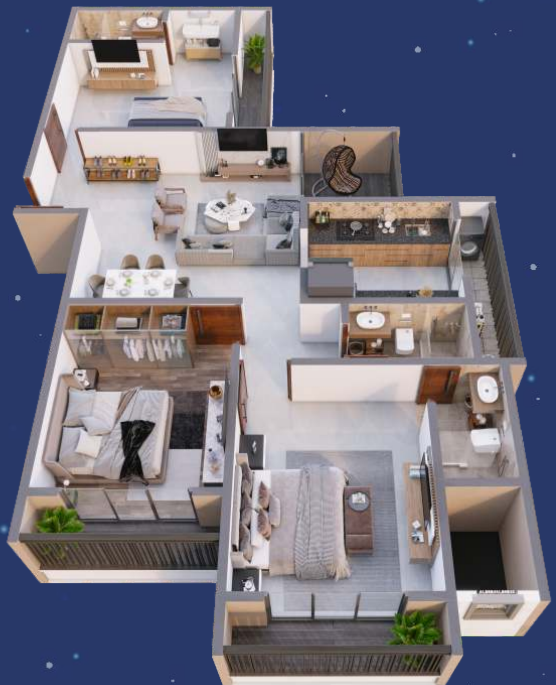
SAI GALAXY 3 BHK SECTION VIEW