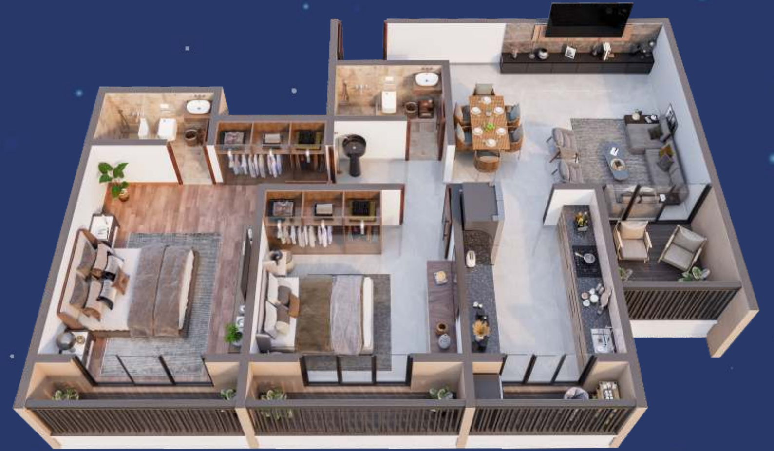
SAI GALAXY 2 BHK SECTION VIEW