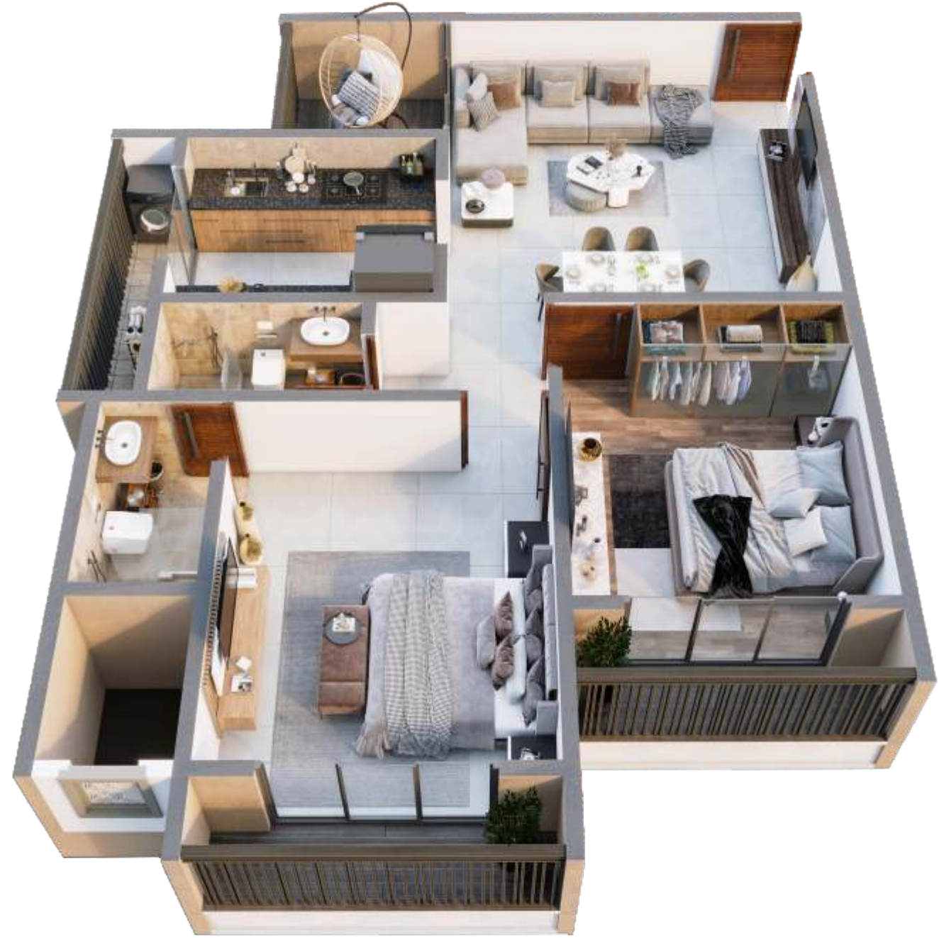
SAI GALAXY 2 BHK SECTION VIEW