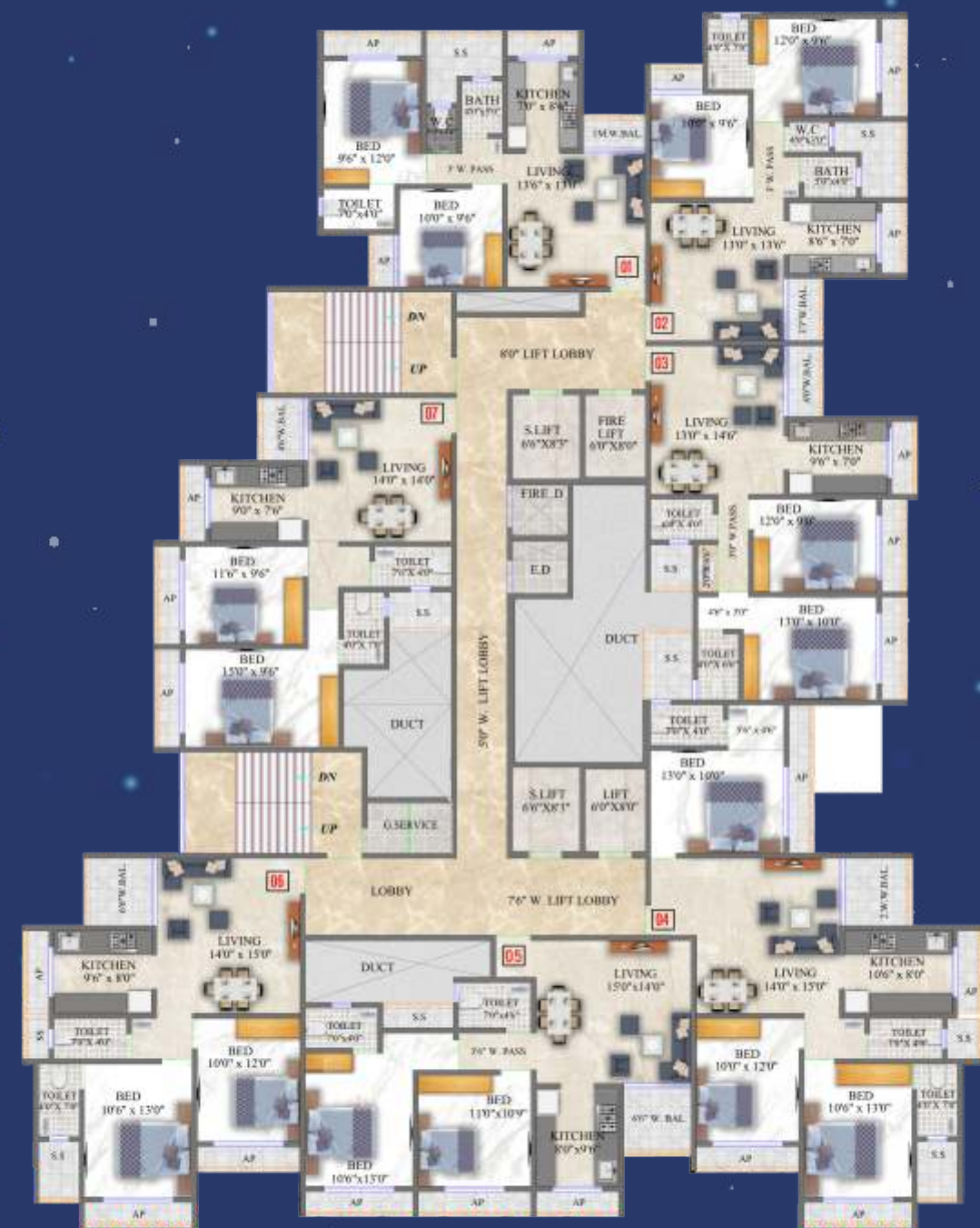
9 TH TO 11 TH , 13 TH TO 16 TH FLOOR PLAN