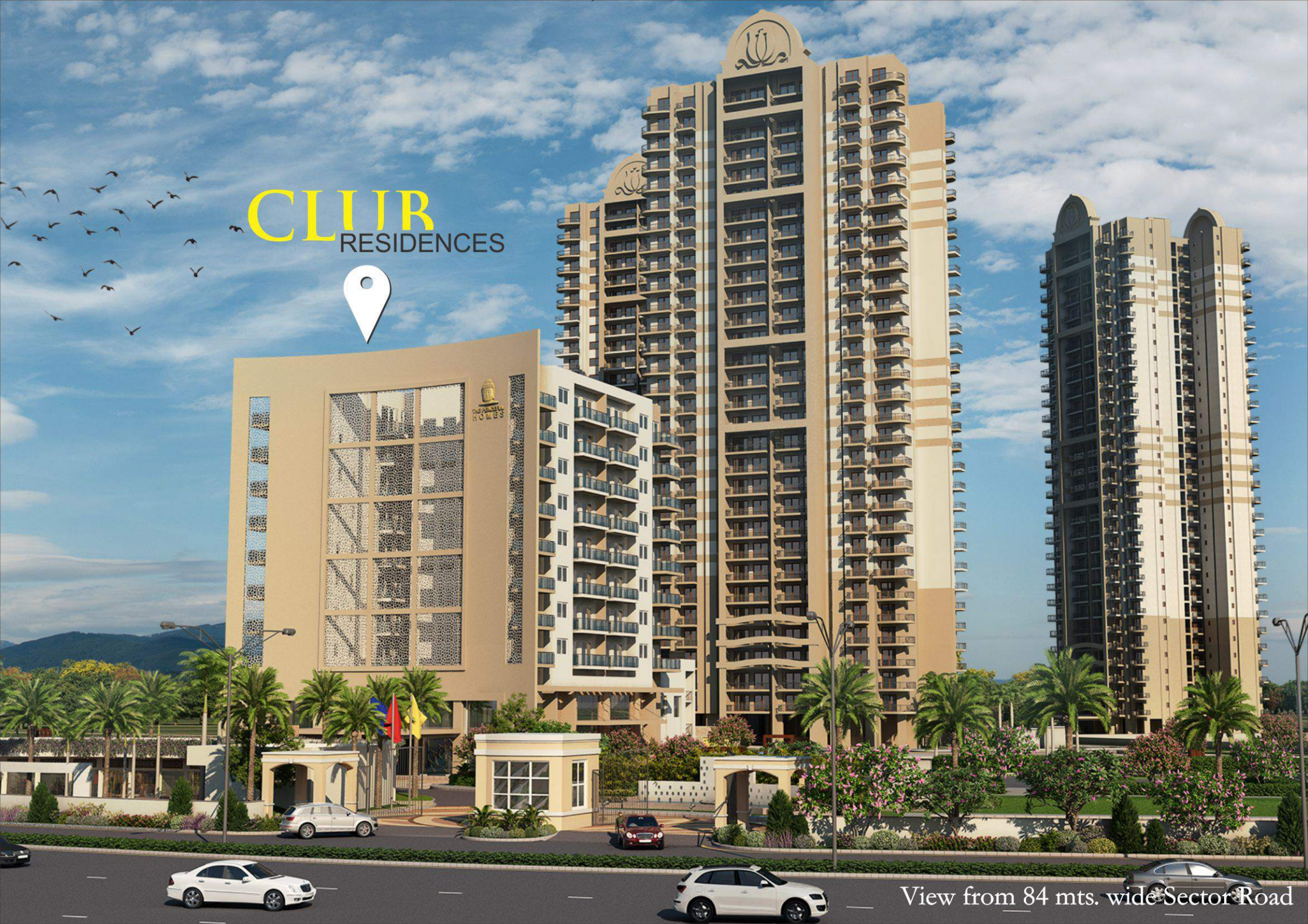
View from 84 mts. wide Sector Road