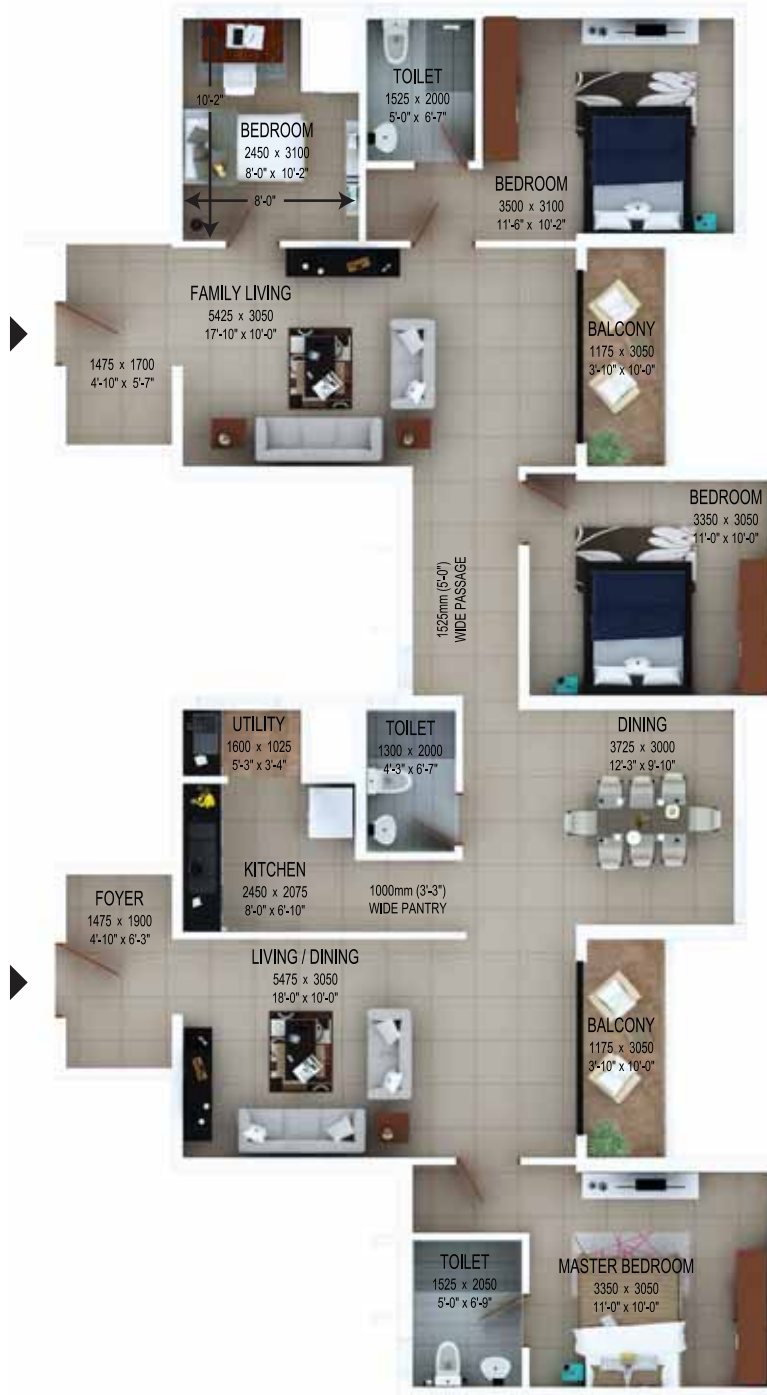
Typical 4 BHK Regal

*The 4 BHK Regal (Customization) will continue to retain units as two independent units with two independent sale deeds and two independent main door numbers for all statutory and documentation purposes.