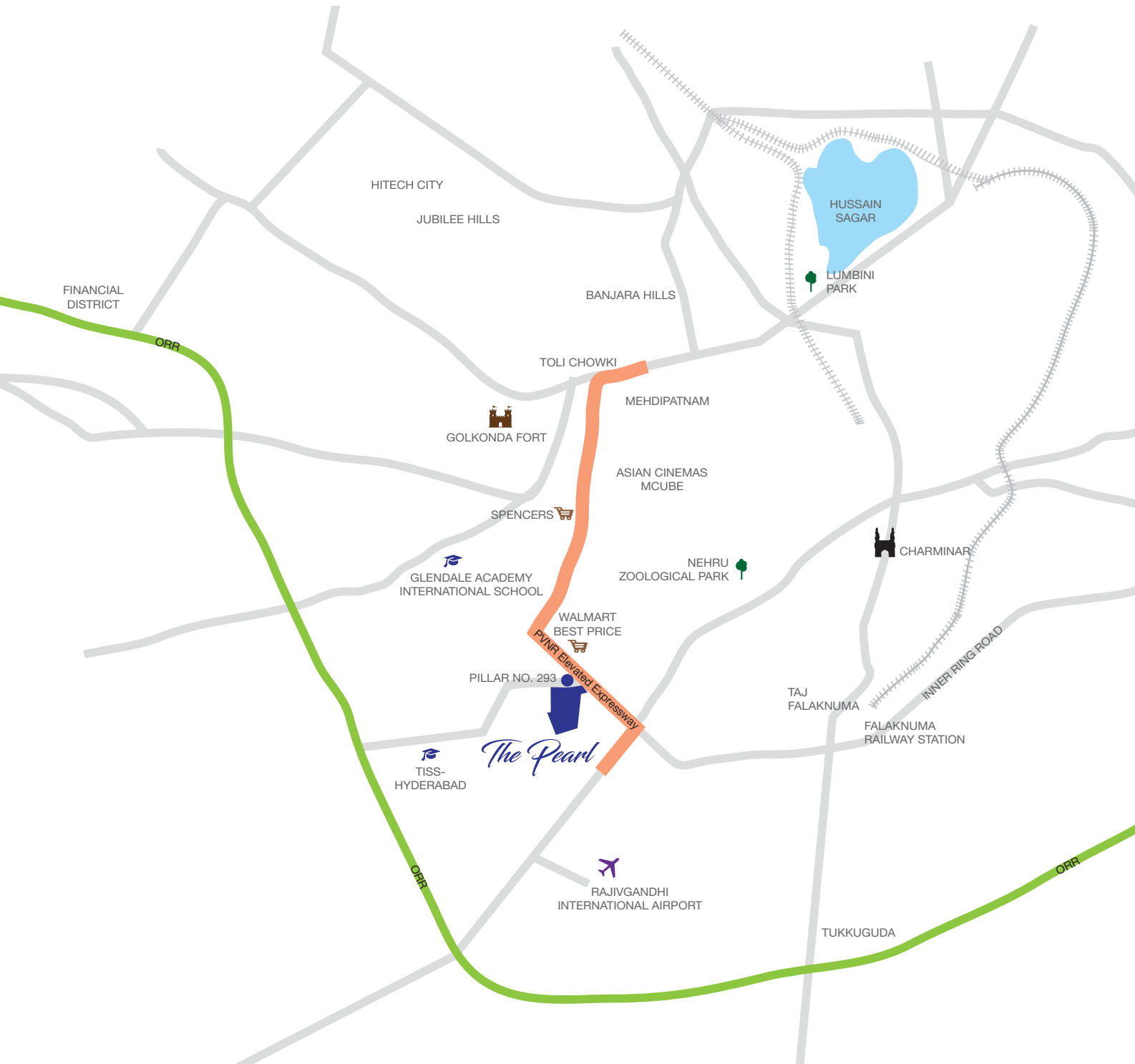
Location map (not to scale)