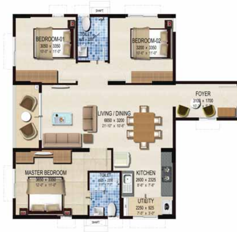
Typical 3 BHK Grand