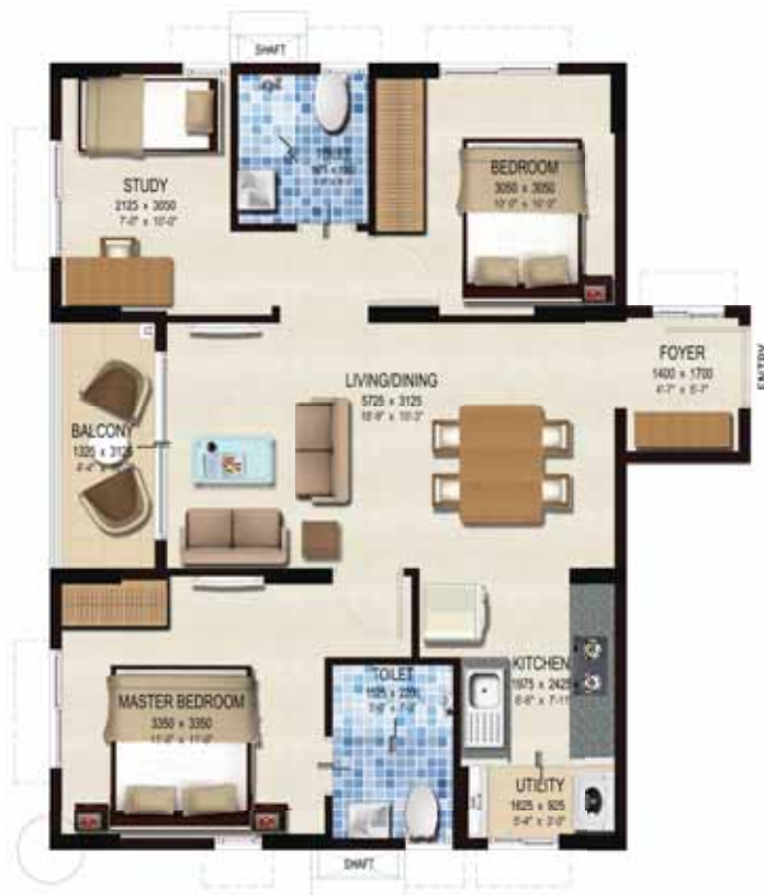
Typical 3 BHK Comfort