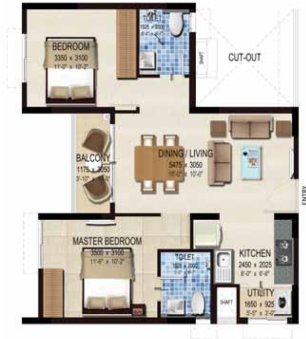
Typical 2 BHK Grand