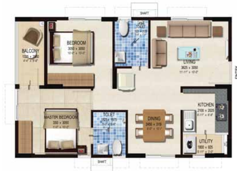
Typical 2 BHK Comfort