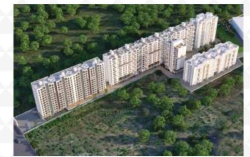
SHIN CITY 1 & 2 BHK APARTMENT CHIKHALI