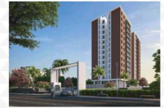
GOLDEN FORTUNE ULTRA SPACIOUS 2 BHK FLATS MOSHI