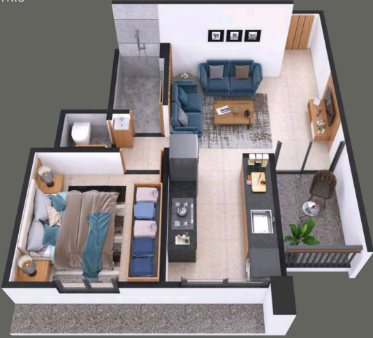
1BHK ISOMETRIC VIEW