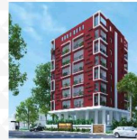
GOLDEN NEST 1BHK FLATS WAKAD