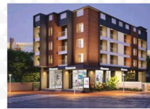
GOLDEN FORTUNE 2 BHK HOMES | SHOWROOMS WAKAD