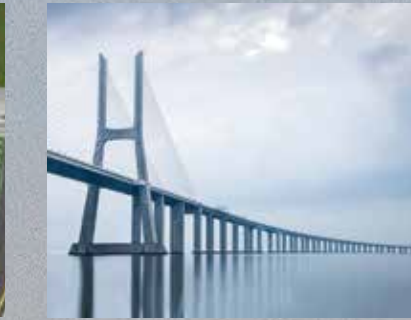
Sewri-Nhava Sheva Trans Harbour Link is a proposed freeway grade road bridge connecting the Indian city of Mumbai with Navi Mumbai, its satellite city.