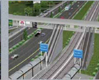
The 126 Km long ring-road of Virar - Alibag Multimodal passageway consolidates multiple modes such as Buses, Trucks, Cars, Metro Rails and non-motorized tracks.