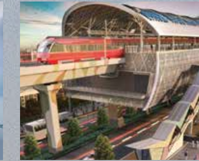
Metro from Vashi to Panvel (part of extended Navi Mumbai Metro Line 2) is a rapid transit system under construction.