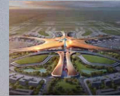
The biggest Navi Mumbai International Airport (NMIA) is in creation at Ulwe Kopar-Panvel in Maharashtra, India. It will be reckoned as India's first urban multi-airport system