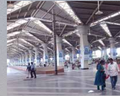
Panvel is on the path of becoming one of the biggest new terminals for passengers and goods trains.