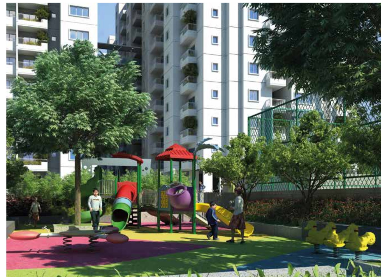
Above: Party deck and barbecue Below: Kids' play area