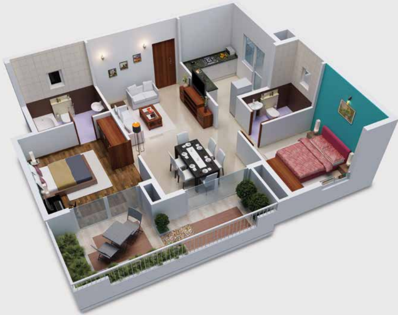
Typical 2 Bedroom Apartment