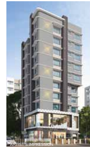
RISHABRAJ MONALISA - Borivali W