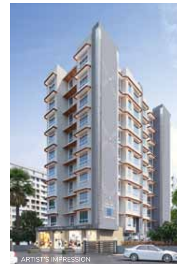
RISHABRAJ AGNEL - Borivali W MahaRera No. P51800030530