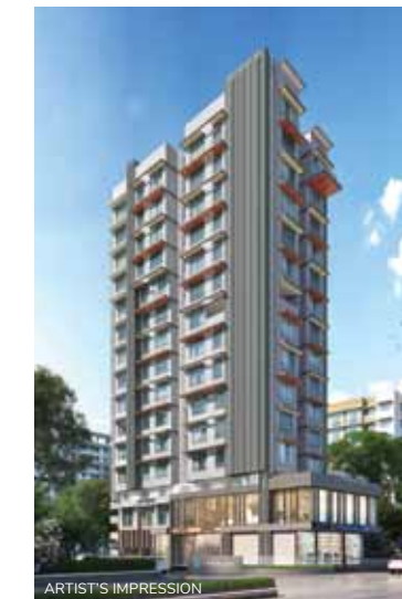
RISHABRAJ SURAJ - Borivali W MahaRera No. P51800029277