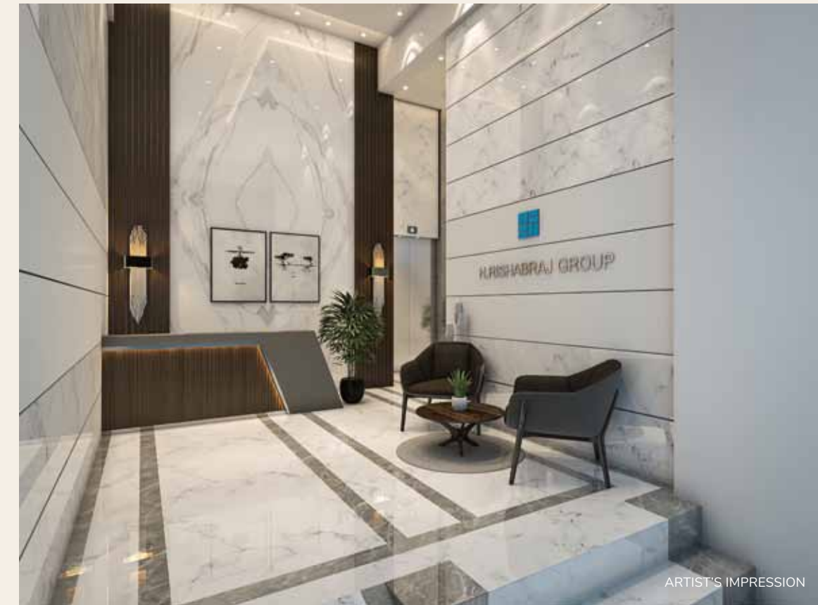
ELEGANTLY DESIGNED ENTRANCE LOBBY