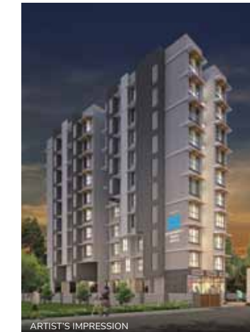
RISHABRAJ ELEGANCE - Kandivali W MahaRera No. P51800024456