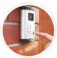
Emergency/ Panic button & Smart Indoor Siren