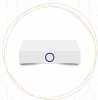
Smart Home Hub