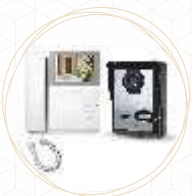
Video Door Bell

*These are a part of the standard offering provided by Joyville Shapobriji to all apartment buyers independent of their decision to subscribe to JioFiber or not. Service charges applicable towards usage of these services will be borne by the customer.