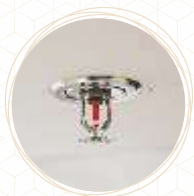
Combustible Gas Leak Sensor