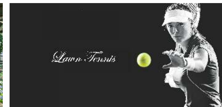
Multi Purpose Court