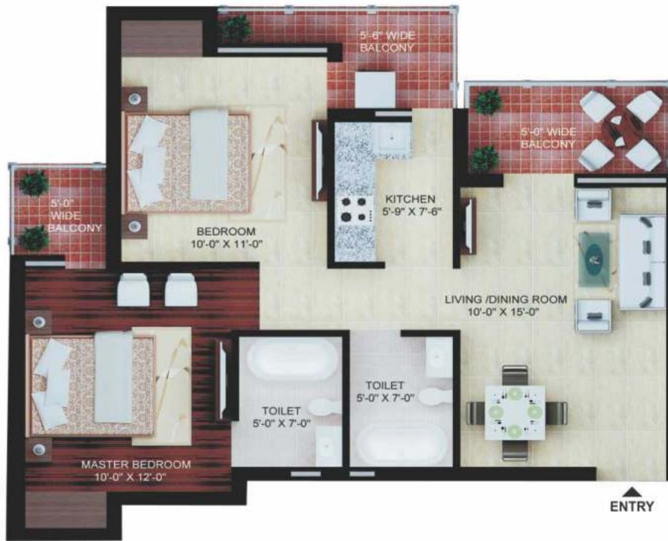
Type-A Super Area = 980 sq. ft. 2 Bedroom + Drawing/Dining + 2 Toilet + Kitchen + Balcony

Note: *Above mention Super Area is inclusive of wall thickness, cupboards, puja area and common area proportionally*