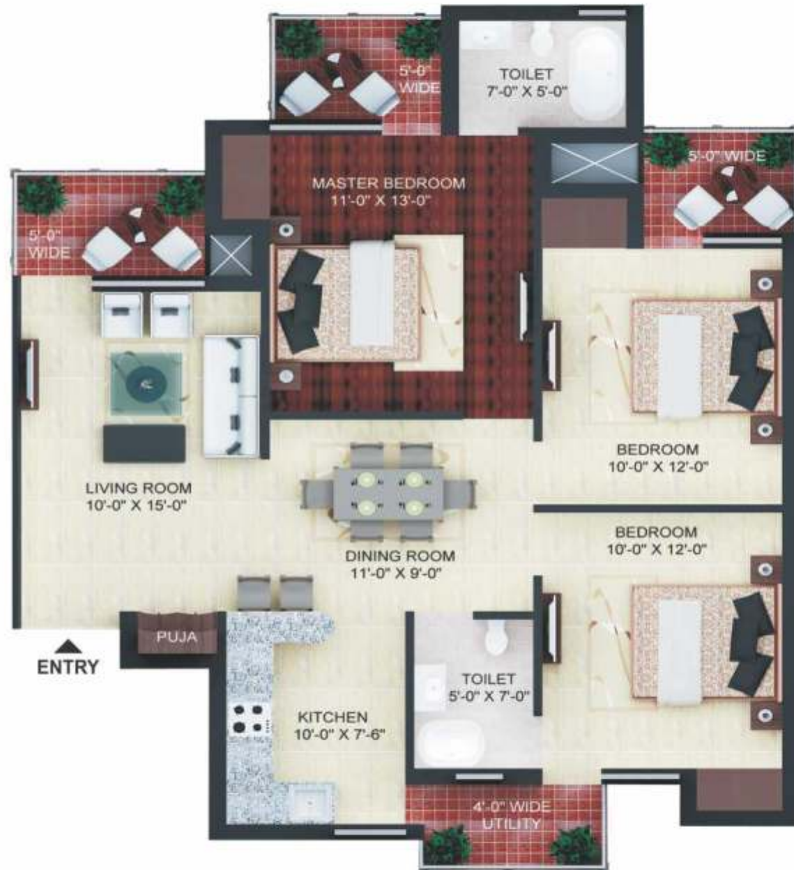
Type-C Super Area = 1390 sq. ft. 3 Bedrooms + Drawing/Dining + 2 Toilet + Kitchen + Balcony

Note: *Above mention Super Area is inclusive of wall thickness, cupboards, puja area and common area proportionally*