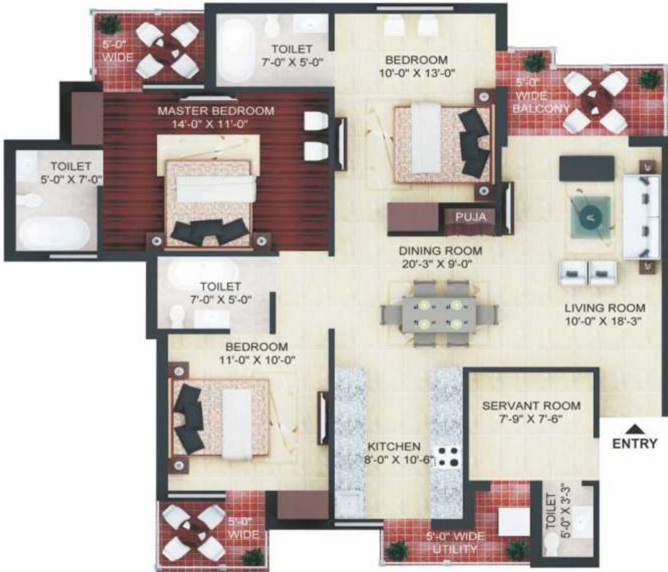
Type-E Super Area = 1620 sq. ft. 3 Bedrooms + Drawing/Dining + 4 Toilets + Kitchen + Servant Room + Balcony

Note: *Above mention Super Area is inclusive of wall thickness, cupboards, puja area and common area proportionally*