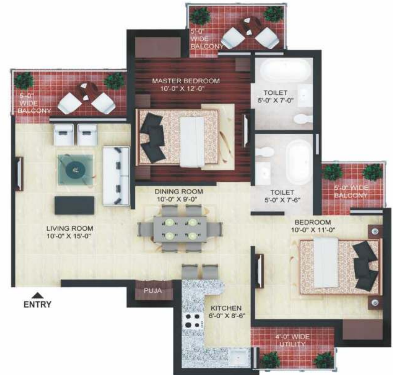
Type-B Super Area = 1130 sq. ft. 2 Bedroom + Drawing/Dining + 2 Toilet + Kitchen + Balcony

Note: *Above mention Super Area is inclusive of wall thickness, cupboards, puja area and common area proportionally*