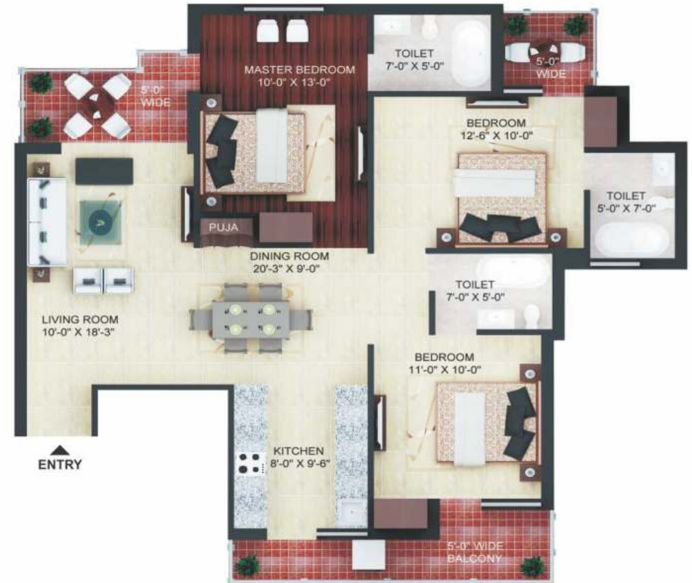
Type-D Super Area = 1460 sq. ft. 3 Bedrooms + Drawing/Dining + 3 Toilets + Kitchen + Balcony

Note: *Above mention Super Area is inclusive of wall thickness, cupboards, puja area and common area proportionally*