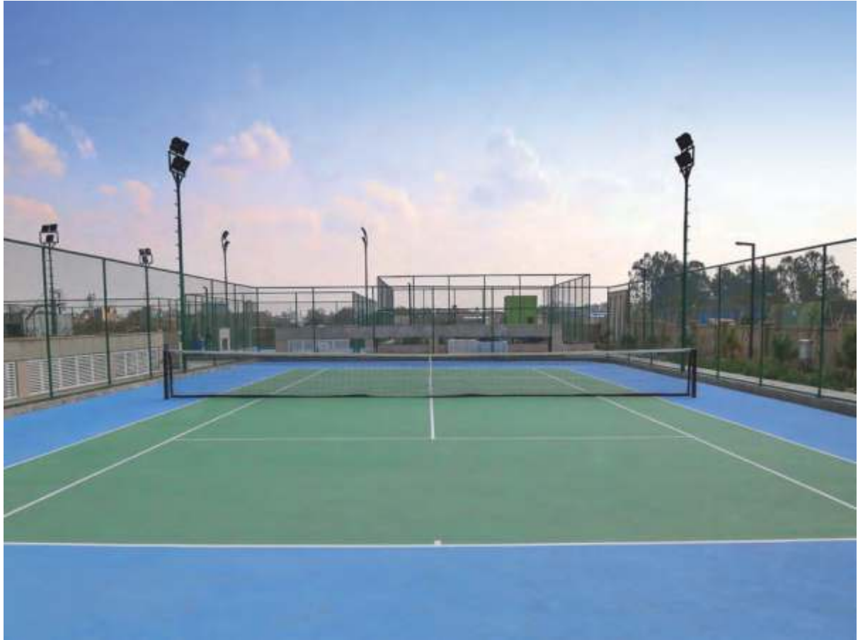
ACTUAL IMAGE OF TENNIS COURT