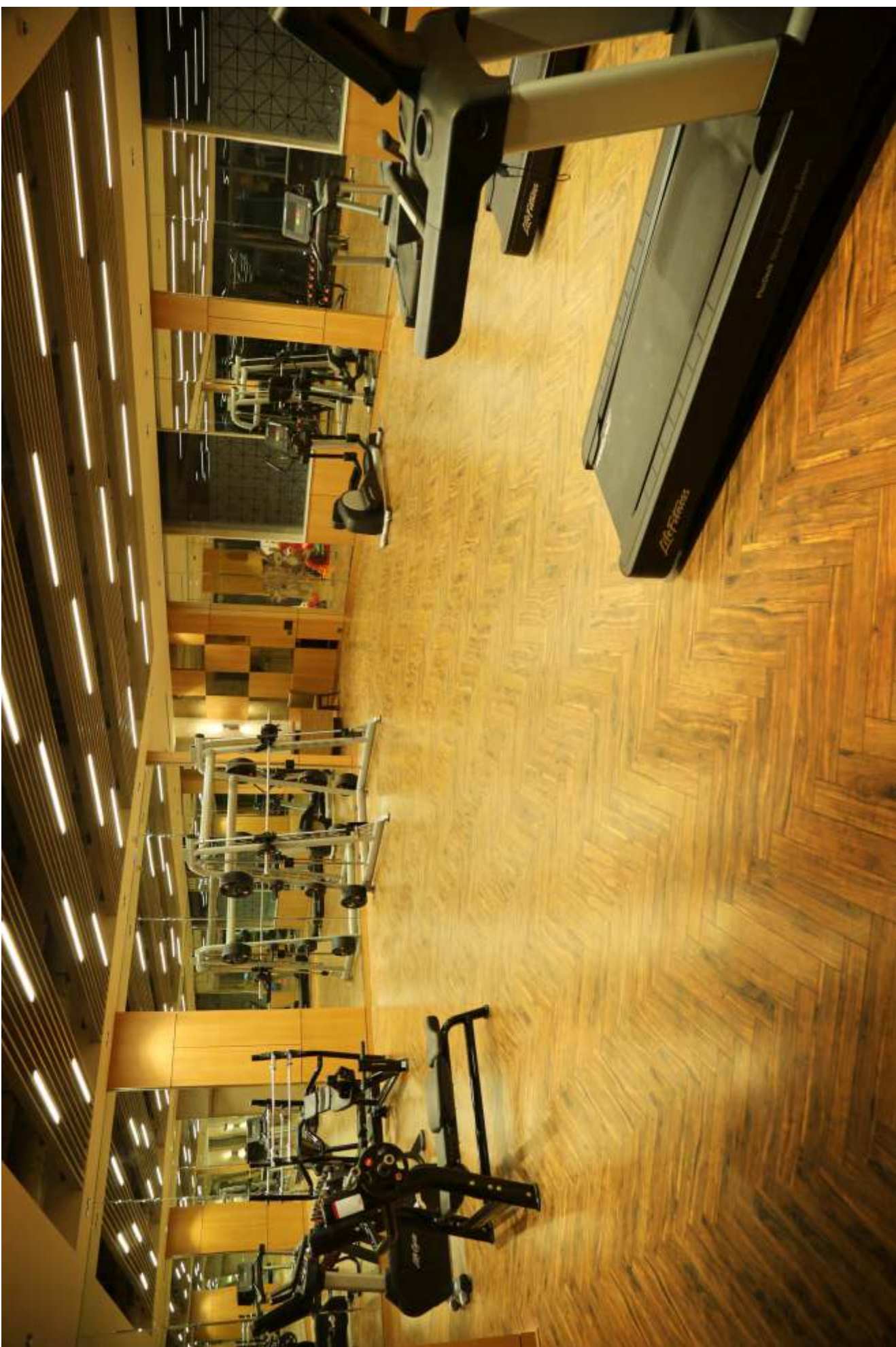
GYM at Pocket B Club