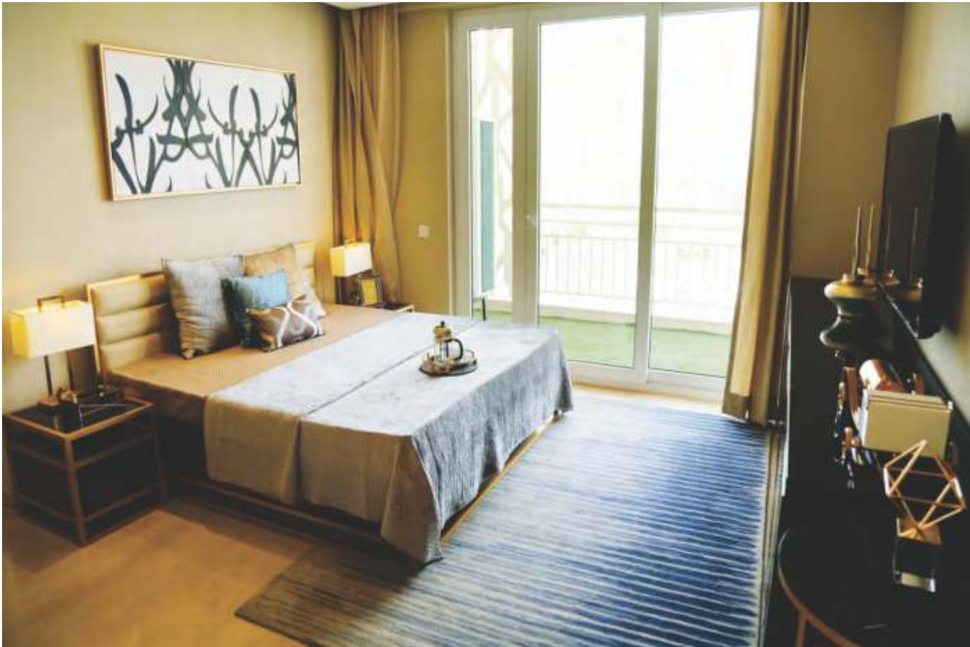
ACTUAL SAMPLE APARTMENT IMAGES