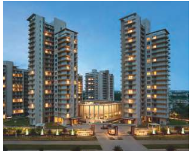
DIPLOMATIC GREENS, GURGAON