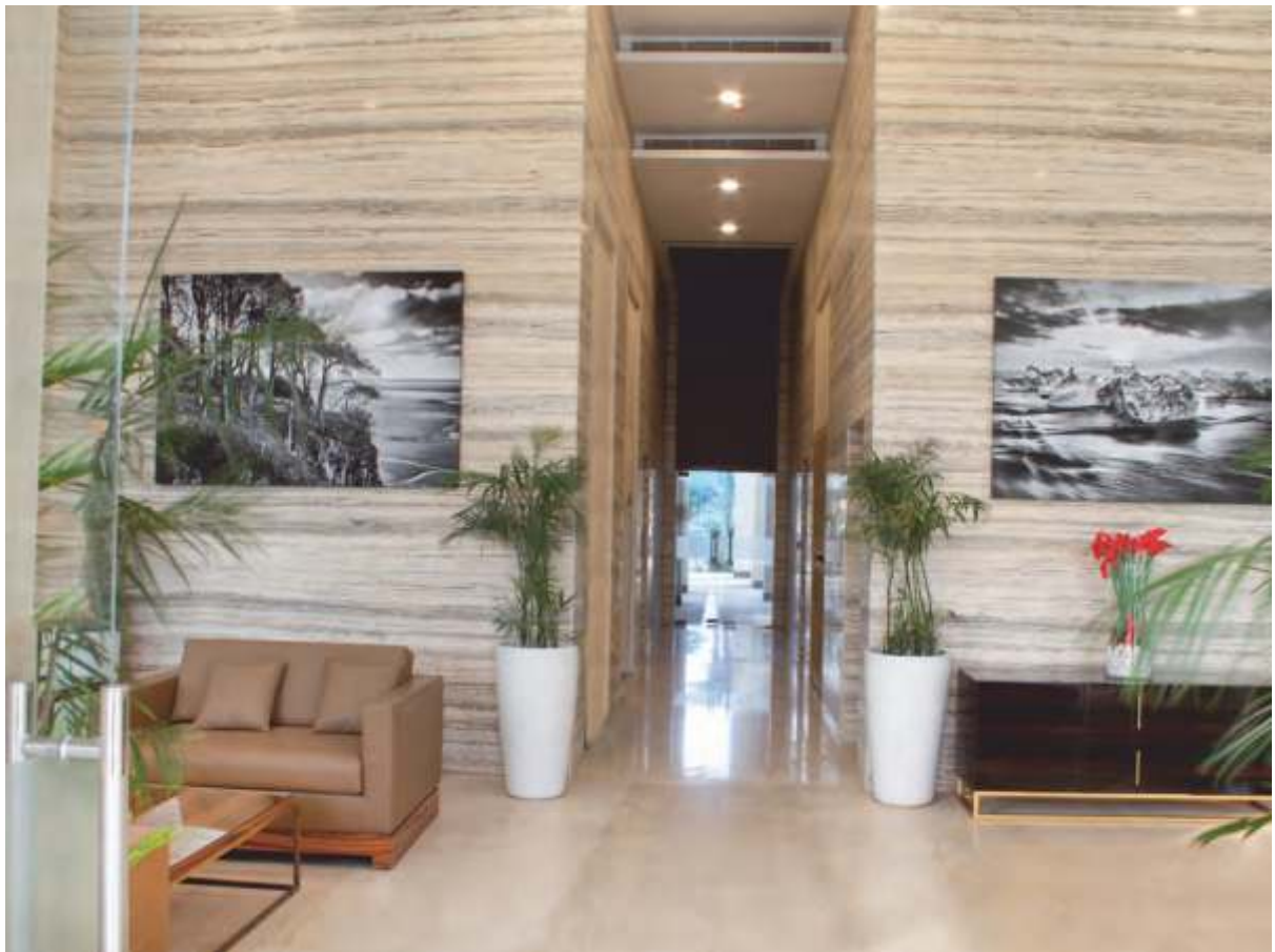
ACTUAL PICTURES OF EMERALD BAY, GURGAON