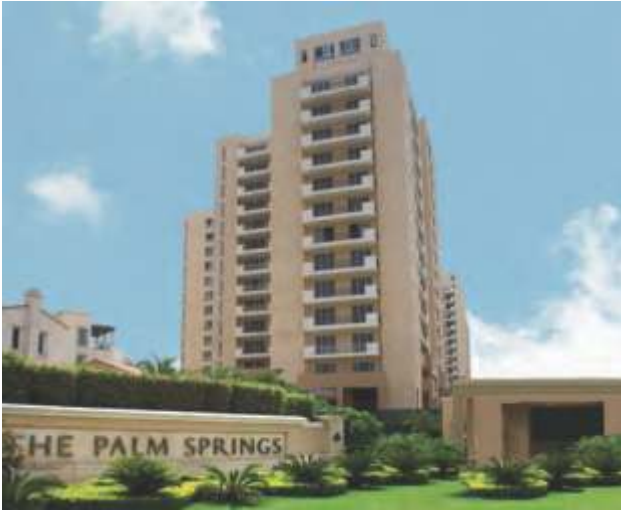
THE PALM SPRINGS, GURGAON