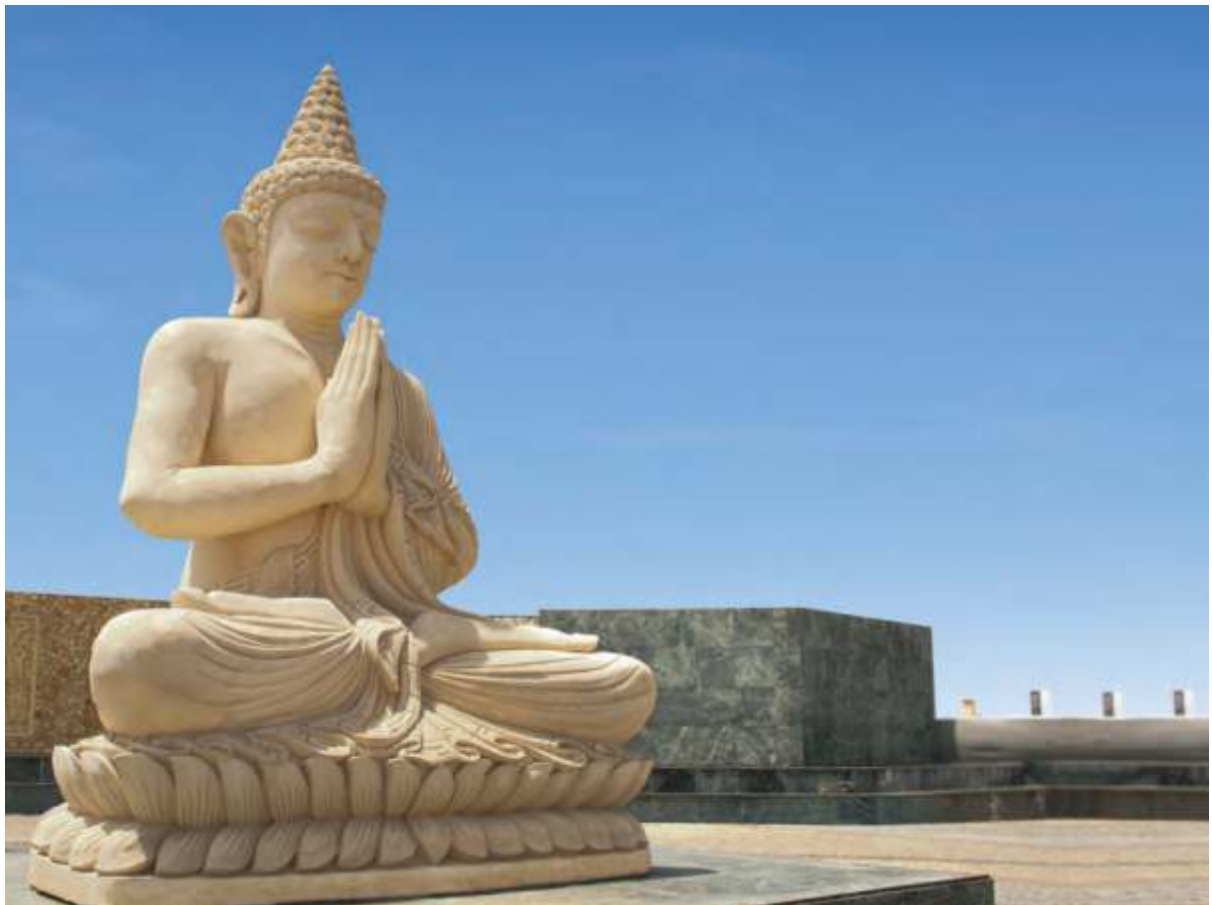
ACTUAL PICTURES OF EMERALD BAY, GURGAON