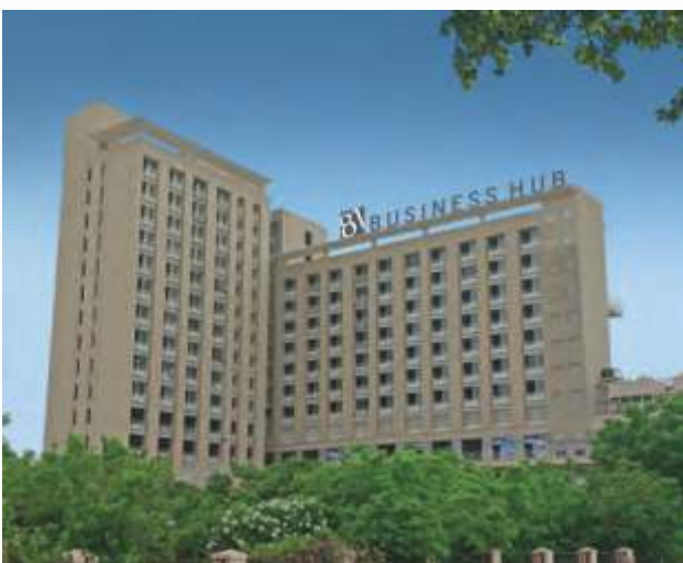
81 BUSINESS HUB, FARIDABAD