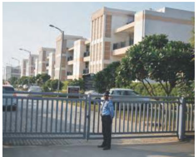
V.I.P FLOORS, FARIDABAD