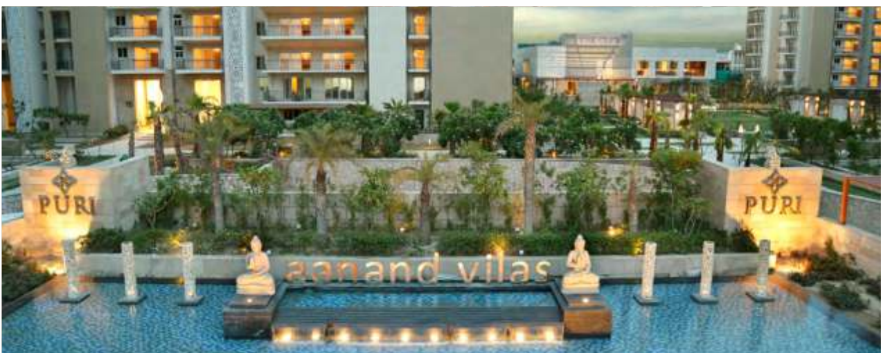
AANANDVILAS, FARIDABAD | READY FOR POSSESSION