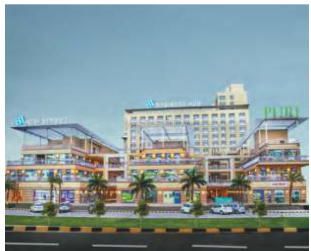
81 HIGHSTREET, FARIDABAD