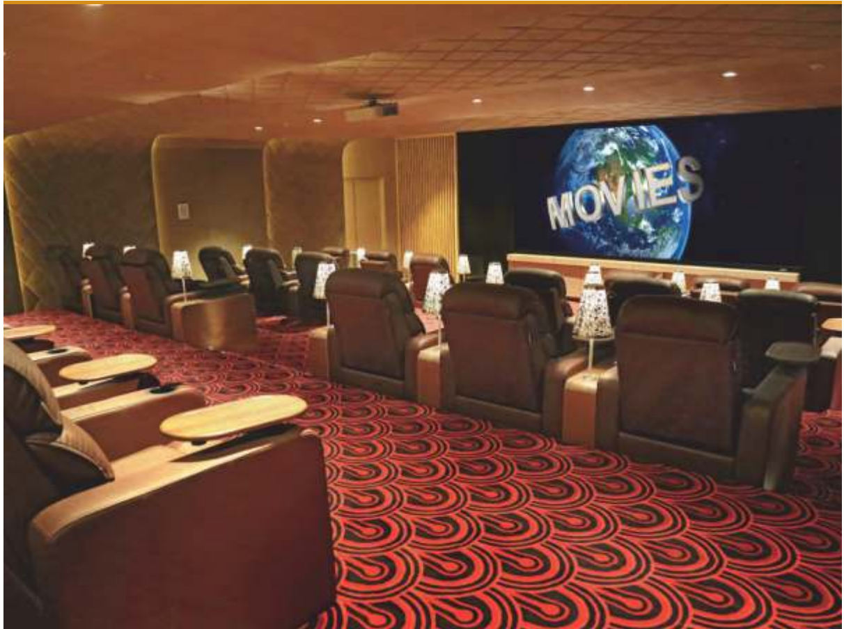
ACTUAL IMAGE OF MOVIE THEATRE