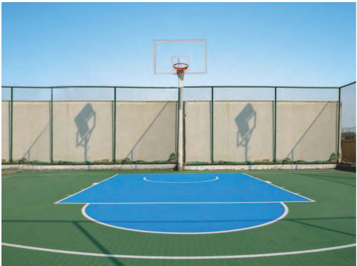
ACTUAL IMAGE OF BASKET BALL COURT