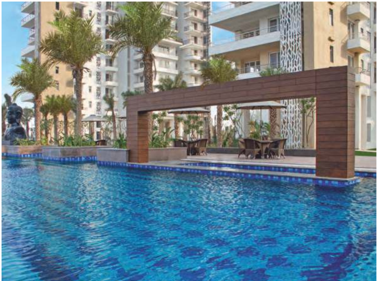
ACTUAL PICTURES OF EMERALD BAY, GURGAON