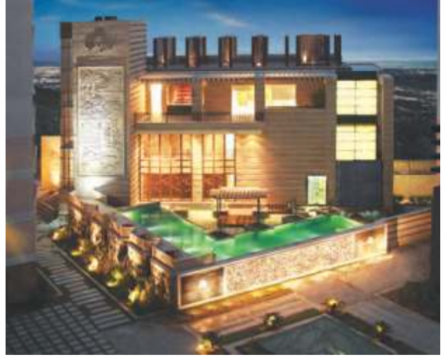
THE PRANAYAM, FARIDABAD