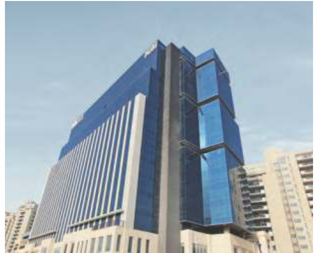
THE PALM SPRINGS PLAZA, GURGAON