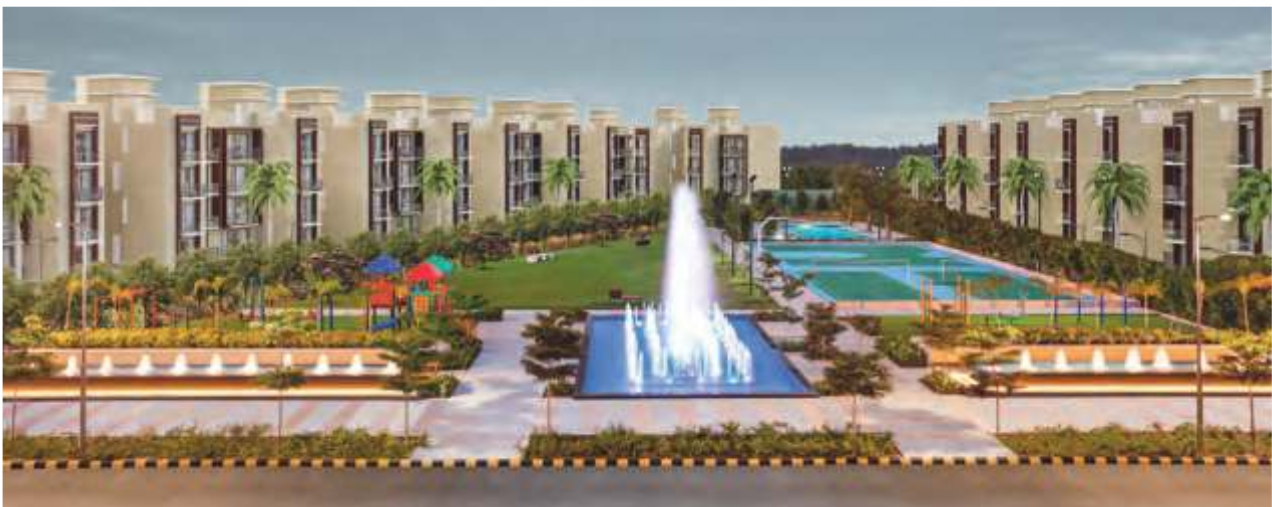
LUXURIA FLOORS AT AMANVILAS, FARIDABAD