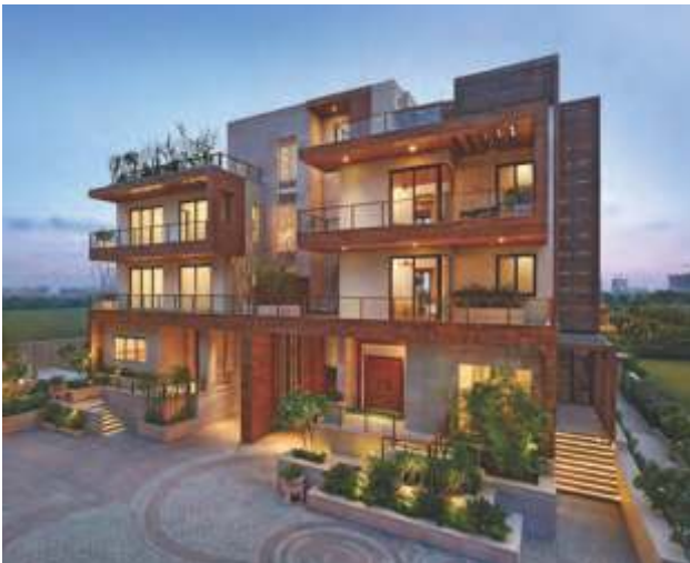
VILLAS AT DIPLOMATIC GREENS, GURGAON