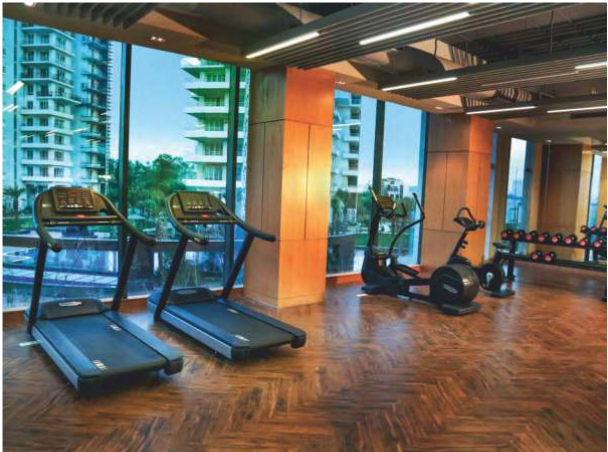
ACTUAL IMAGE OF GYMNASIUM