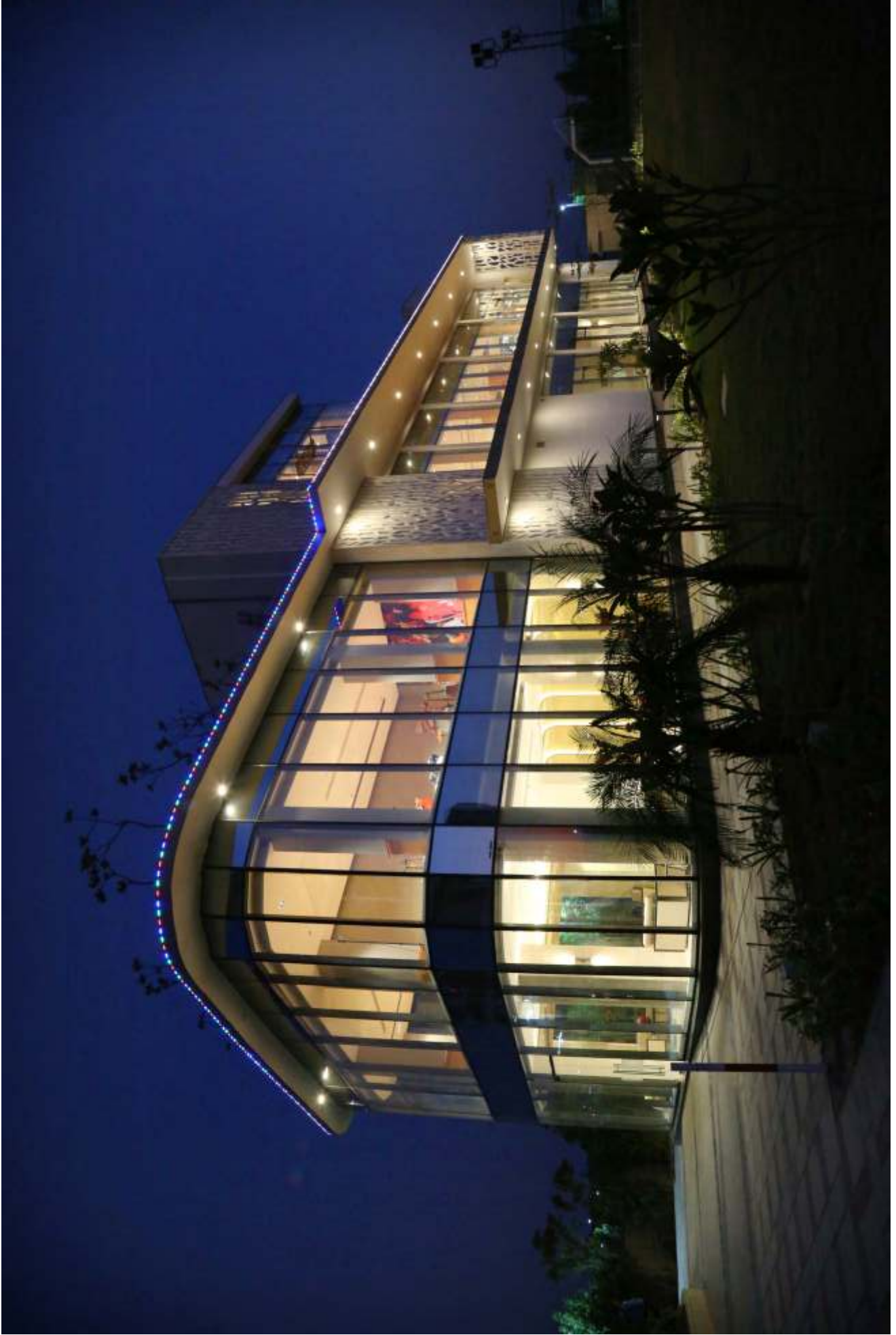
Actual Image of Pocket B Club