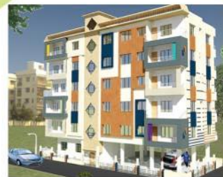
Nirman Enclave Samarpally, Kestopur