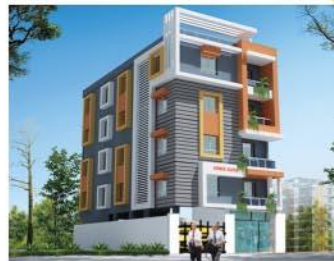
Nirman Alpha Action Area I, Newtown

Nirman Group has established itself as a leading real estate developer in Kolkata. Each project is executed after thorough and meticulous planning, thus catering to the preference and taste of our customers. The company's aim is to accommodate every need of its customers' during the design phase. Our planning, attention to detail and excellent designs are evident in all our projects and hence these have become prime properties of North Kolkata. Nirman Group has to its credit an impressive list of previously completed and ongoing projects. Our residential and commercial properties are considered as real estate landmarks and have proved to be secure and sound investments for all our investors and have helped us gain the satisfaction and trust of all our stakeholders.