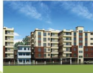
Nirman Garden Purbapara, Kestopur