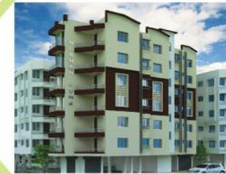
Nirman Kunj Christianpara, Kestopur